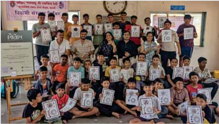
Children display their artwork, along with Rotarians, at the RYLA.