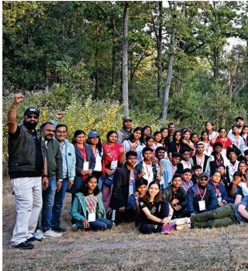
Participants at the RYLA.

Additional projects include installing water coolers across the city during the summer and launching the Helping Hands project, which provides essential medical equipment free of cost to patients in need. ■