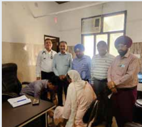
Left: A woman gets her parameters checked at the Rotary medical camp.