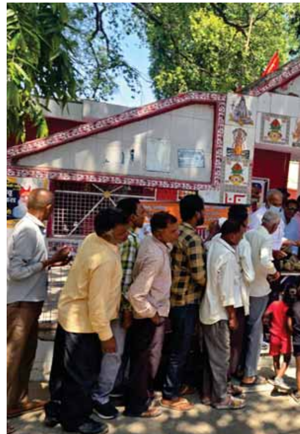
Right: A food donation drive organised by the club.