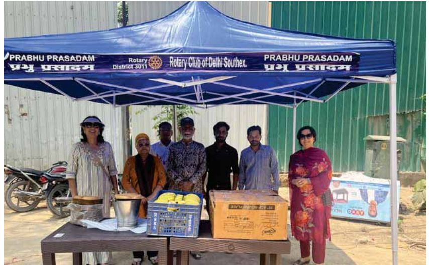
Members of RC Delhi Southex at a stall to distribute food and fruits for the public.

The club has now expanded this noble initiative to include labourers working at construction sites. ■