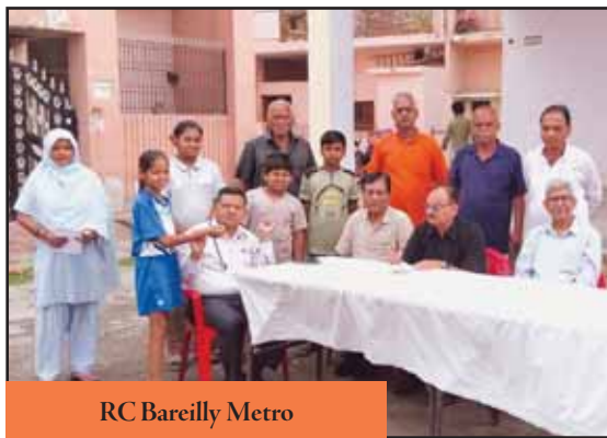
RC Bareilly Metro