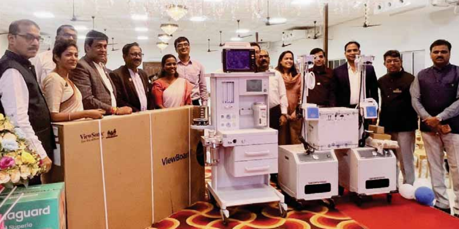
Below: Rotarians handing over the equipment to hospital authorities.

On the cover: A sanitation worker being recognised at the Sevai Nayagigal event organised by RC Erode Nexus, RID 3203.