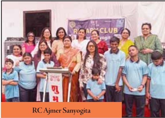
RC Ajmer Sanyogita