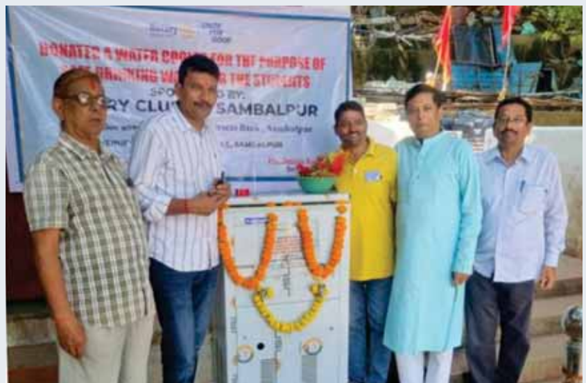
RC Sambalpur members at the inauguration of a water cooler.