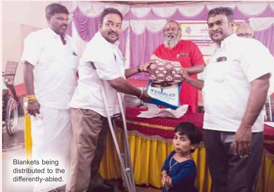
Blankets being distributed to the differently-abled.