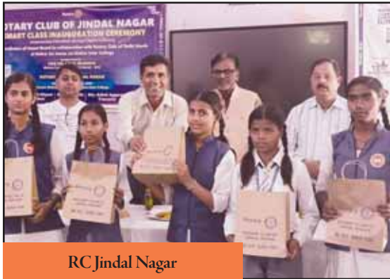
RC Jindal Nagar