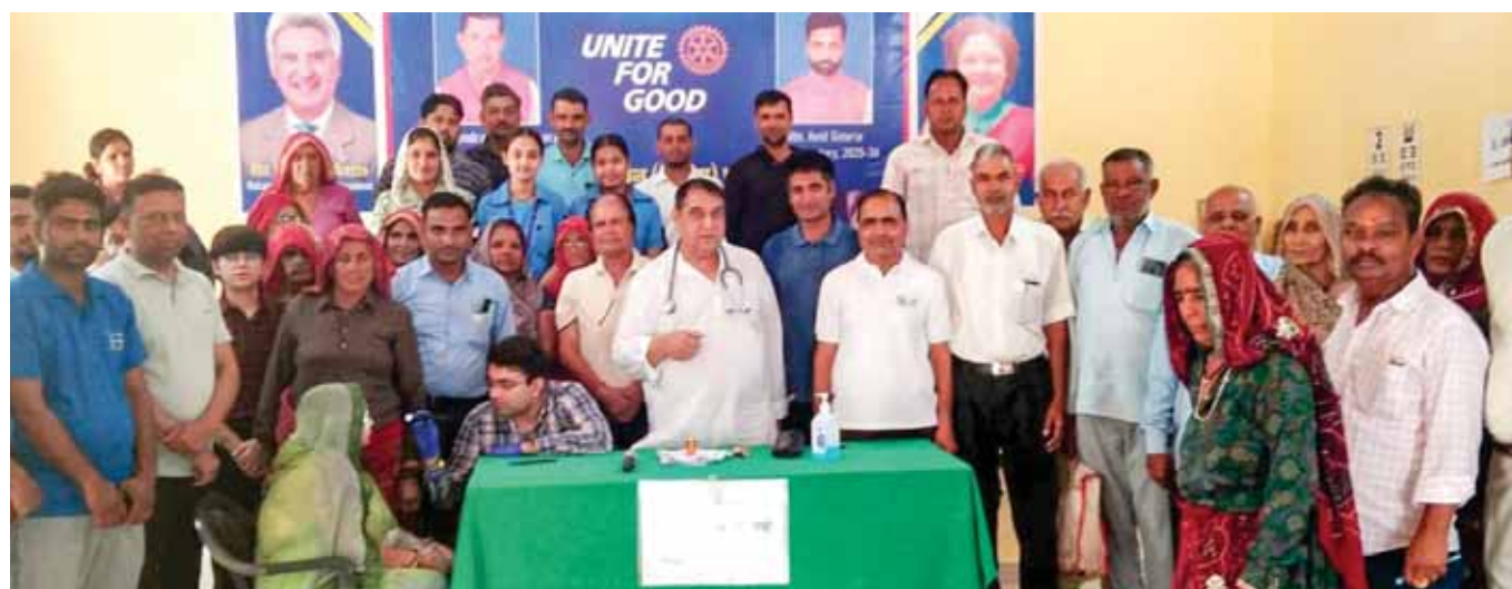
An eye specialist with Rotarians and patients at the cataract screening camp.