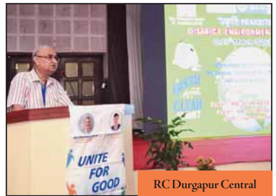
RC Durgapur Central