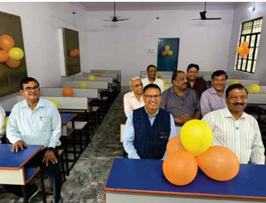
Club members after donating benches and computers at the Saraswati Vidya Mandir School.