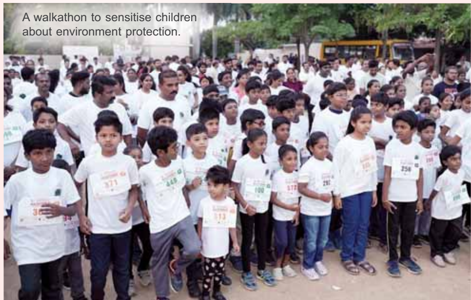
A walkathon to sensitise children about environment protection.

Government Hospital, the club organised a walkathon to sensitise the public about obesity and its related health issues. Around 100 students of the Velalar College of Nursing participated in the event, and along with the Rotarians, they carried placards with impactful messages highlighting the need to combat obesity and adopt healthier lifestyle.