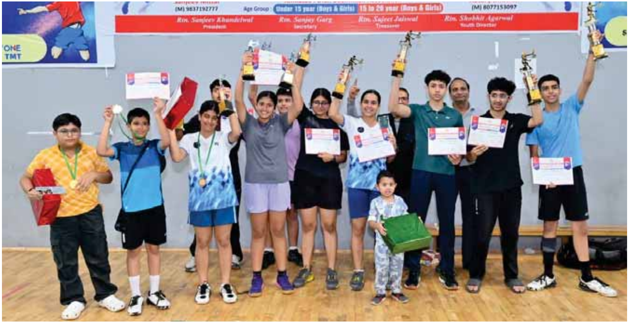
Winners of the badminton tournament with their trophies.