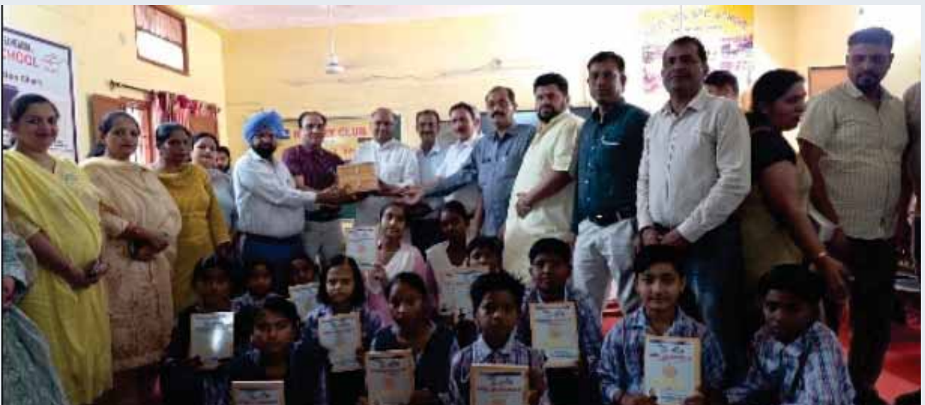
Below: Students with notebooks given to them by the club.