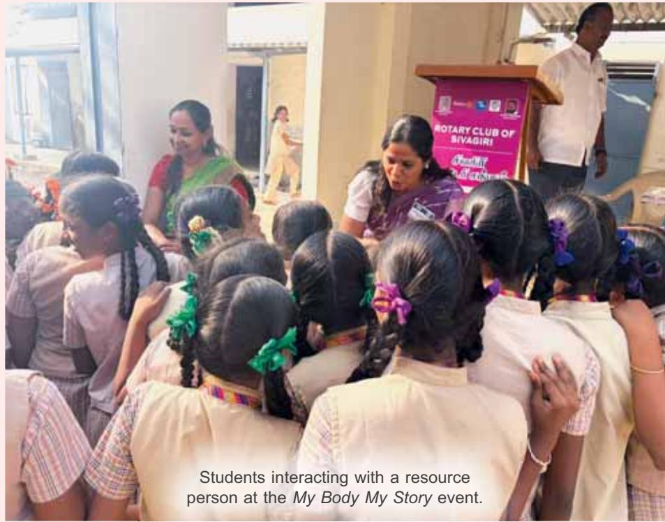
Students interacting with a resource person at the My Body My Story event.