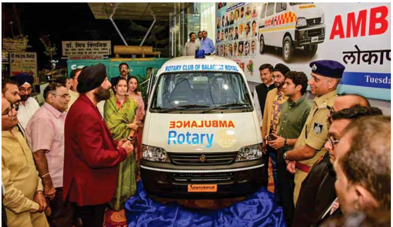
Below: Club members at the ambulance handing over ceremony.