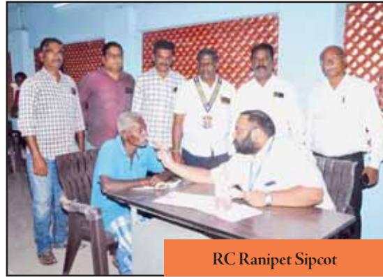
RC Ranipet Sipcot