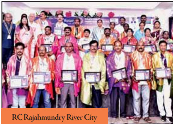
RC Rajahmundry River City