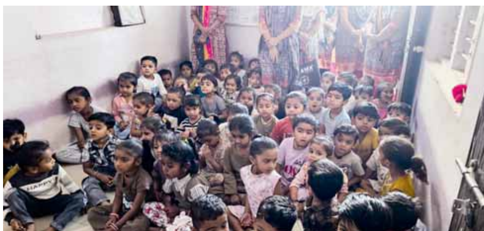
Children at one of the anganwadis where RC Halvad distributed nutrition kits and games accessories.

The Rotary Club of Halvad, RI district 3060, provided specialised nutrition kits to children across 10 anganwadis located in the slum areas of Halvad, Morbi district, Gujarat. Each kit included moringa