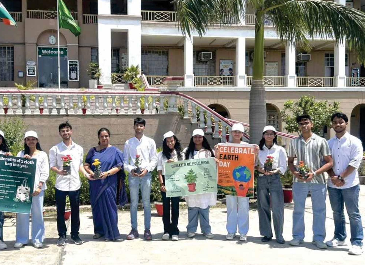
Members of the Interact Club of Zenith creating environmental awareness through Project Bloom .