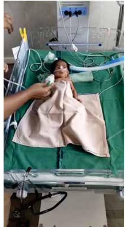
A newborn receives critical care at the Government Medical College and Hospital, Sindhudurg, with the newly donated equipment.

The initiative also benefitted Zilla Parishad Primary School No. 1 in Oras, where a solar power system, an interactive digital learning panel, and a water purifier were installed. The additions are expected to improve access to digital education, ensure reliable electricity and provide safe drinking water for students. ■