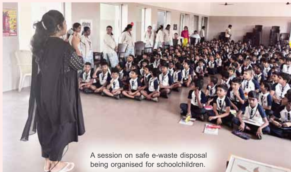
A session on safe e-waste disposal being organised for schoolchildren.

who is a fertility consultant at the Lotus Women Care hospital. She gave valuable insight into Human Papillomavirus (HPV), its risks, and the importance of timely vaccination in preventing cervical cancer.