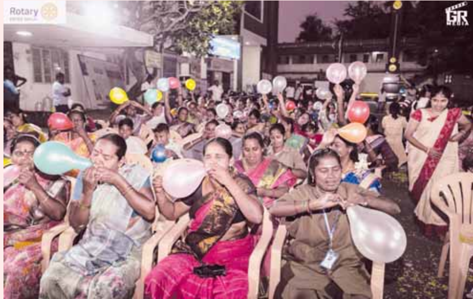
Sanitation workers enjoying their evening at the Sevai Nayagigal .

Around 250 women sanitation workers were welcomed with warmth