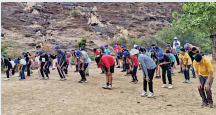
Morning warm-up session near the Kalra Caves.

A three-day residential RYLA was conducted for around 70 children near the scenic Karla Caves by RC Pune Royal, RID 3131, with the support of Akhil Maharashtra Shri Ekvira Devi Bhaktangan Twashta Seva Mandal, a spiritual organisation.