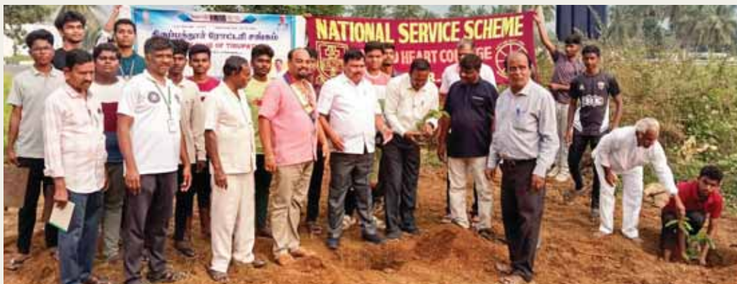
Mega tree planting drive at the Amritalaya College of Education, Tiruppatur, with the participation of Rotarians, students, faculty and the public.

than 200 Rotarians and beneficiaries took part in the Diwali gala.