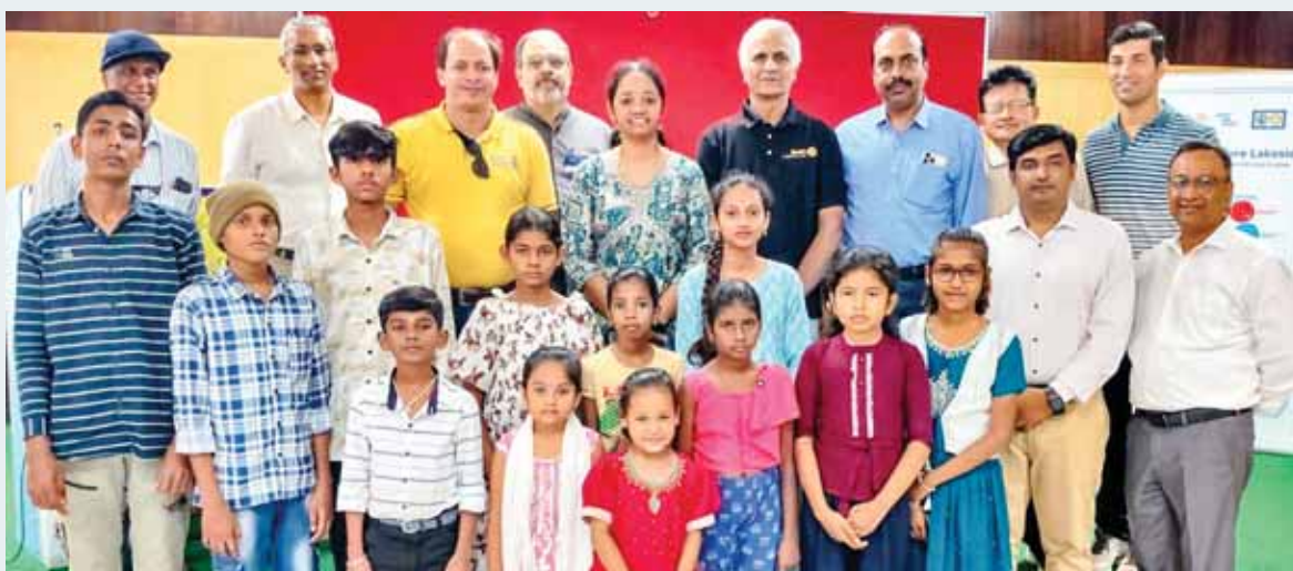
Rotarians with children with type 1 diabetes.

The Rotary Club of Bangalore Lakeside aims to install automatic water generator units in 100 locations including schools, colleges, hospitals and public places with CSR or NGO partners. ■