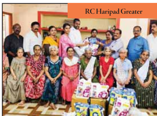
RC Haripad Greater