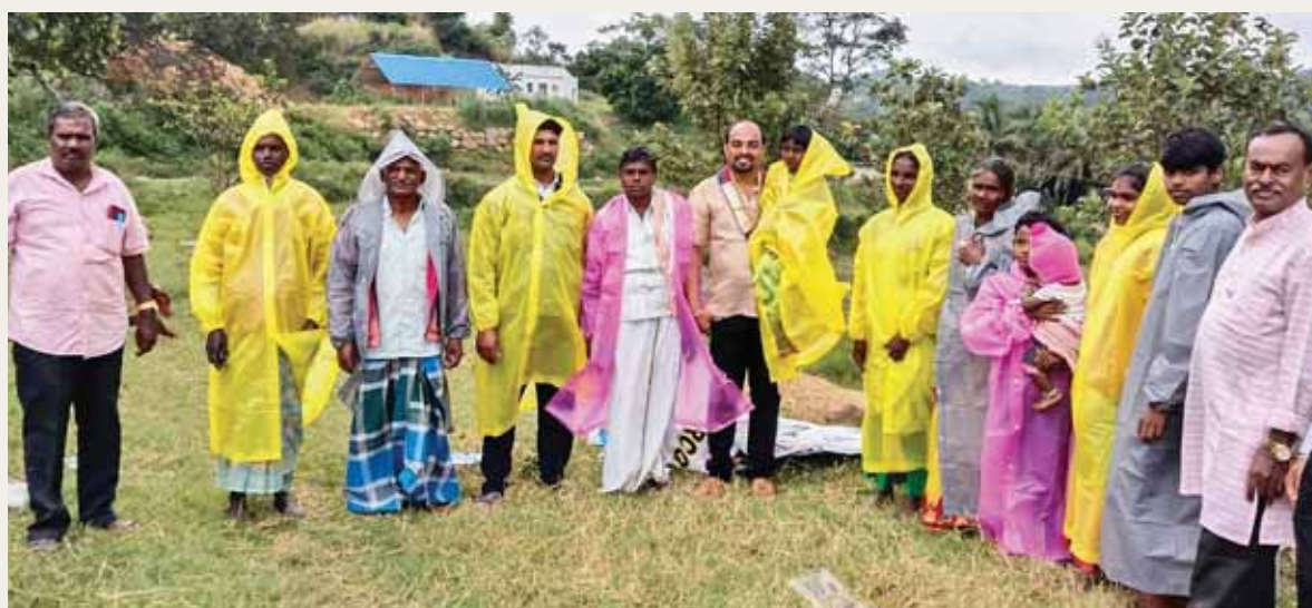
Raincoats distributed to needy families in remote villages.

Eye testing and surgery camp was held at Bommikuppam village in which 200 people were screening for sight disorders. ■