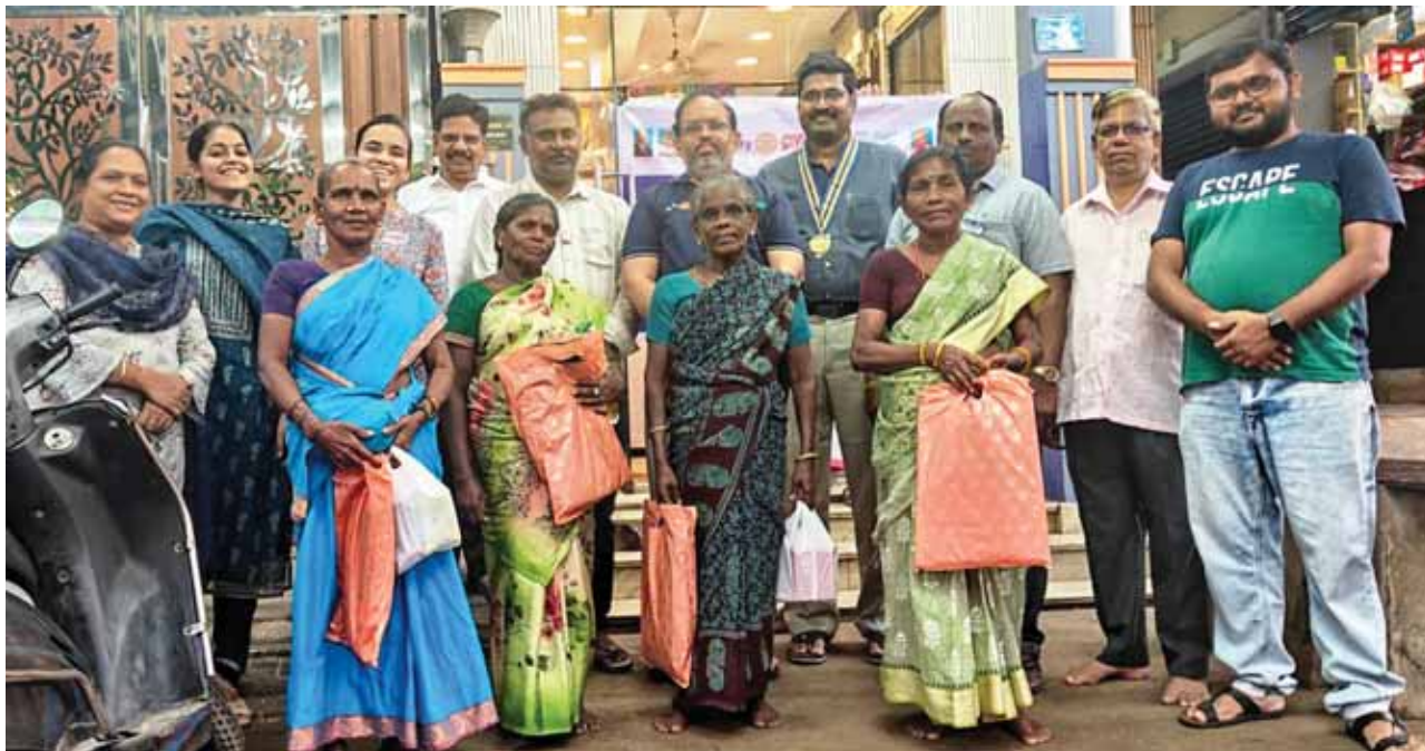
Rotarians with sanitary workers holding Diwali gifts at the Sivapuri panchayat village.