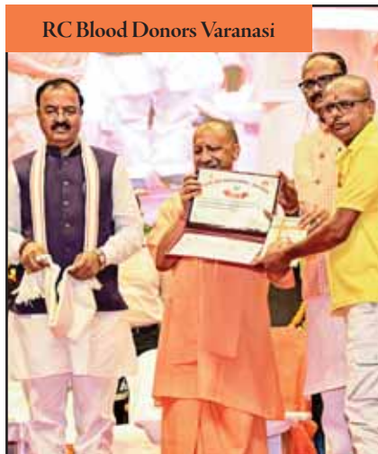
RC Blood Donors Varanasi