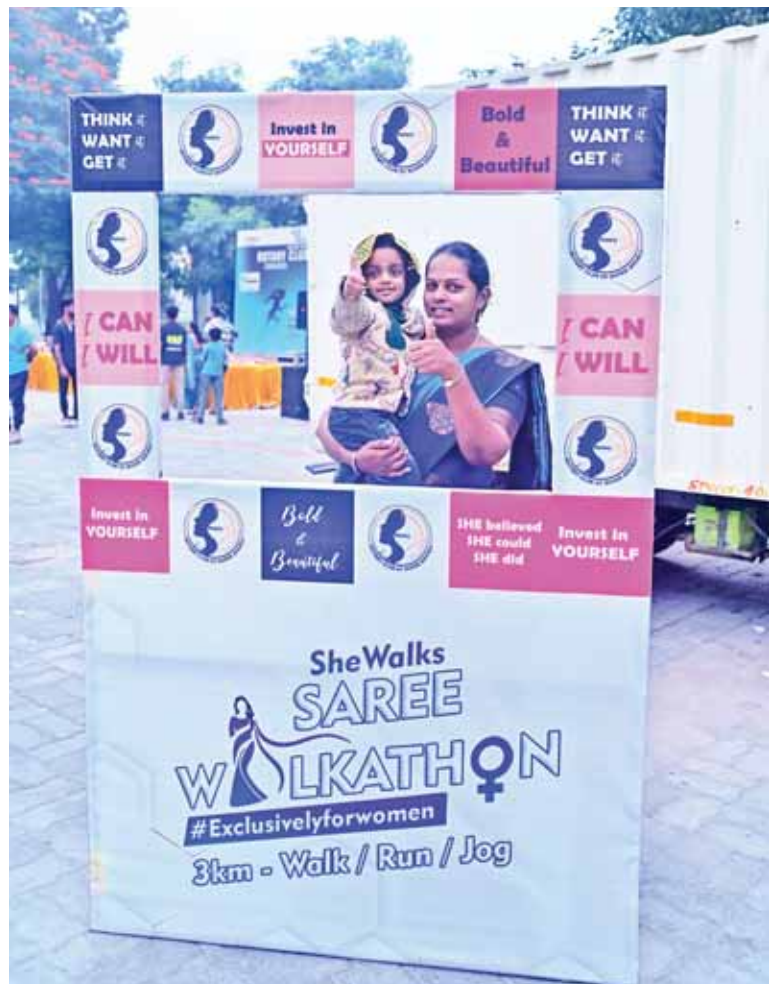
A participant poses with her child at the selfie booth during the walkathon.