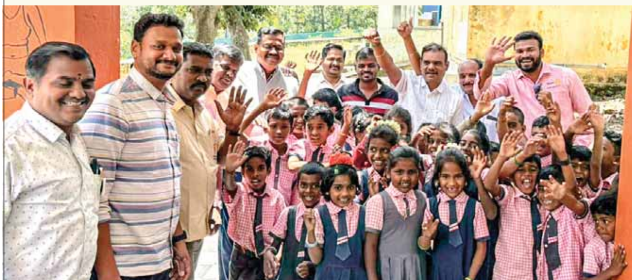
Rotarians, along with the students, at the Piliyur Panchayat Union Primary School.