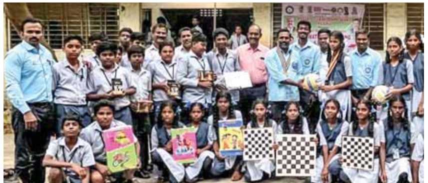
Members of RC Pondicherry Marina with students of one of the newly-chartered Interact club.

Other initiatives of RC Pondicherry Marina include a blood donation drive for the Mundiambakkam Government Medical College and Hospital in the neighbouring town Villupuram, and a ROTA sports event for the city's school and college students. ■