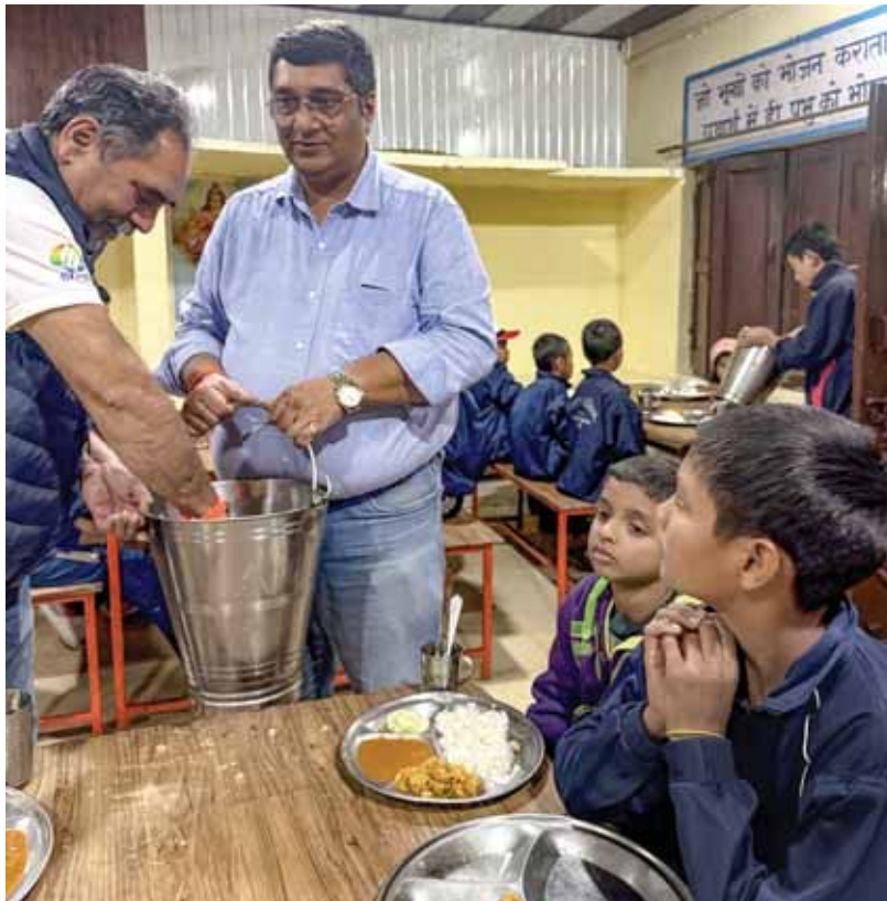
Club members serving lunch to children.

Over 500 units of blood was donated to the Manya Charitable Blood Centre in Hardwar through eight blood donation camps organ-