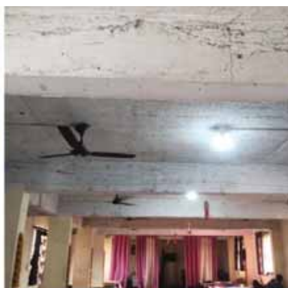
The new-look dormitory (left) after the renovation.