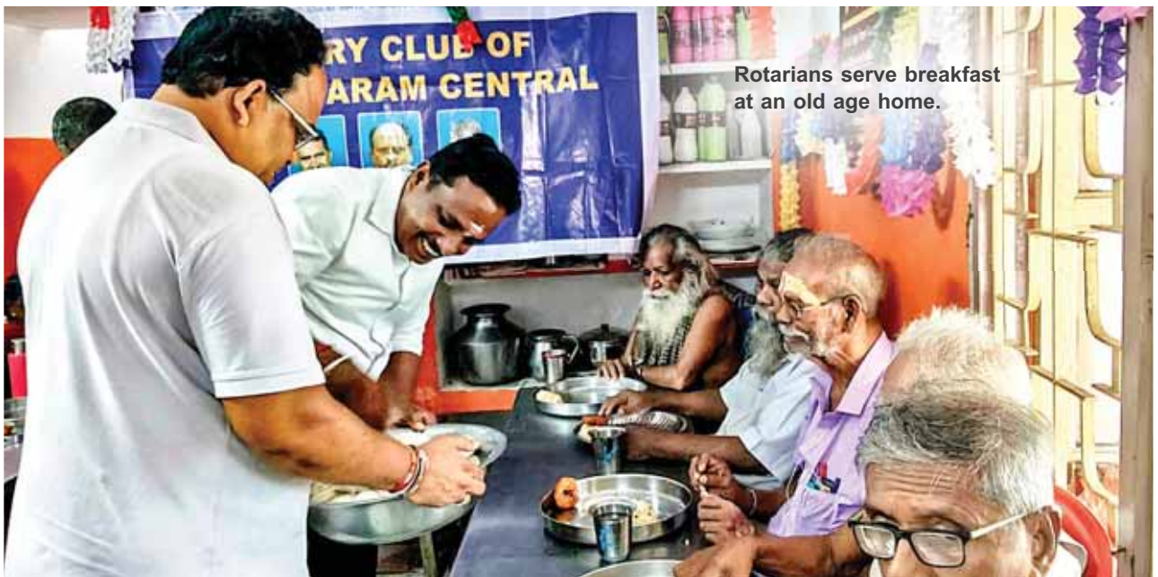
Rotarians serve breakfast at an old age home.

Another initiative, the Annapoorna project, launched as a monthly service activity by the club, focuses on providing nutritious breakfast to the residents of Anbagam Old Age Home in the town on the first day of every month.■