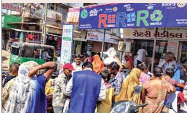
The Reduce, Reuse and Recycle poster in Halvad.

As part of six-day Diwali Funfair celebrations, RC Jetpur put up 24 large hoardings across the town featuring the Rotary logo, the Four-Way Test, Rotary’s history, and details of current initiatives. The outreach campaign received extensive coverage from local media and news channels. ■