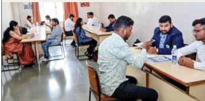
Aspirants at the job fair.