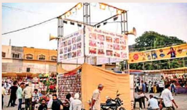
A display of Rotary's history and The Four-Way test in Jetpur.