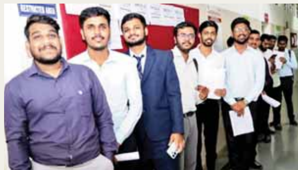
Interviews underway at the fair.