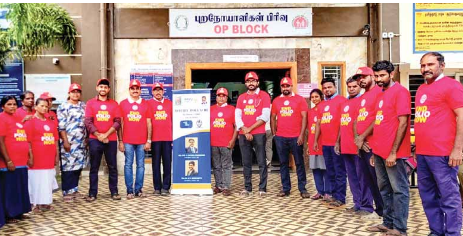
Club members commemorate World Polio Day at the government hospital in Pollachi.