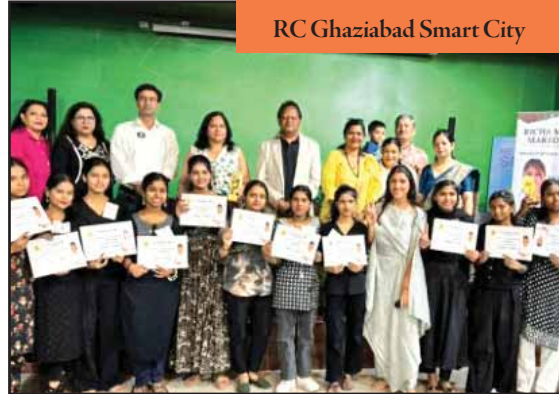
RC Ghaziabad Smart City