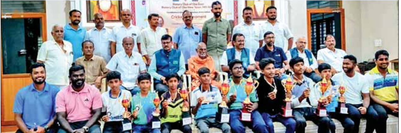
Children at the prize distribution ceremony of the cricket tournament.

R C Coimbatore East, RID 3206, in partnership with RC Coimbatore New Town and Coimbatore District Sports and Games Welfare Association, organised a cricket tournament for rural school students in October, coinciding with Gandhi Jayanthi.