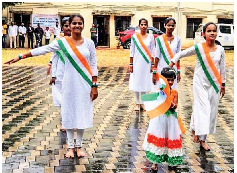
Hearing and speech-impaired children of the Sayudh School perform the national anthem in sign language.

The Rotarians participated in the Independence Day celebrations at the school and were impressed by the students' disciplined march past, inspiring cultural programmes and vibrant rangoli designs. ■