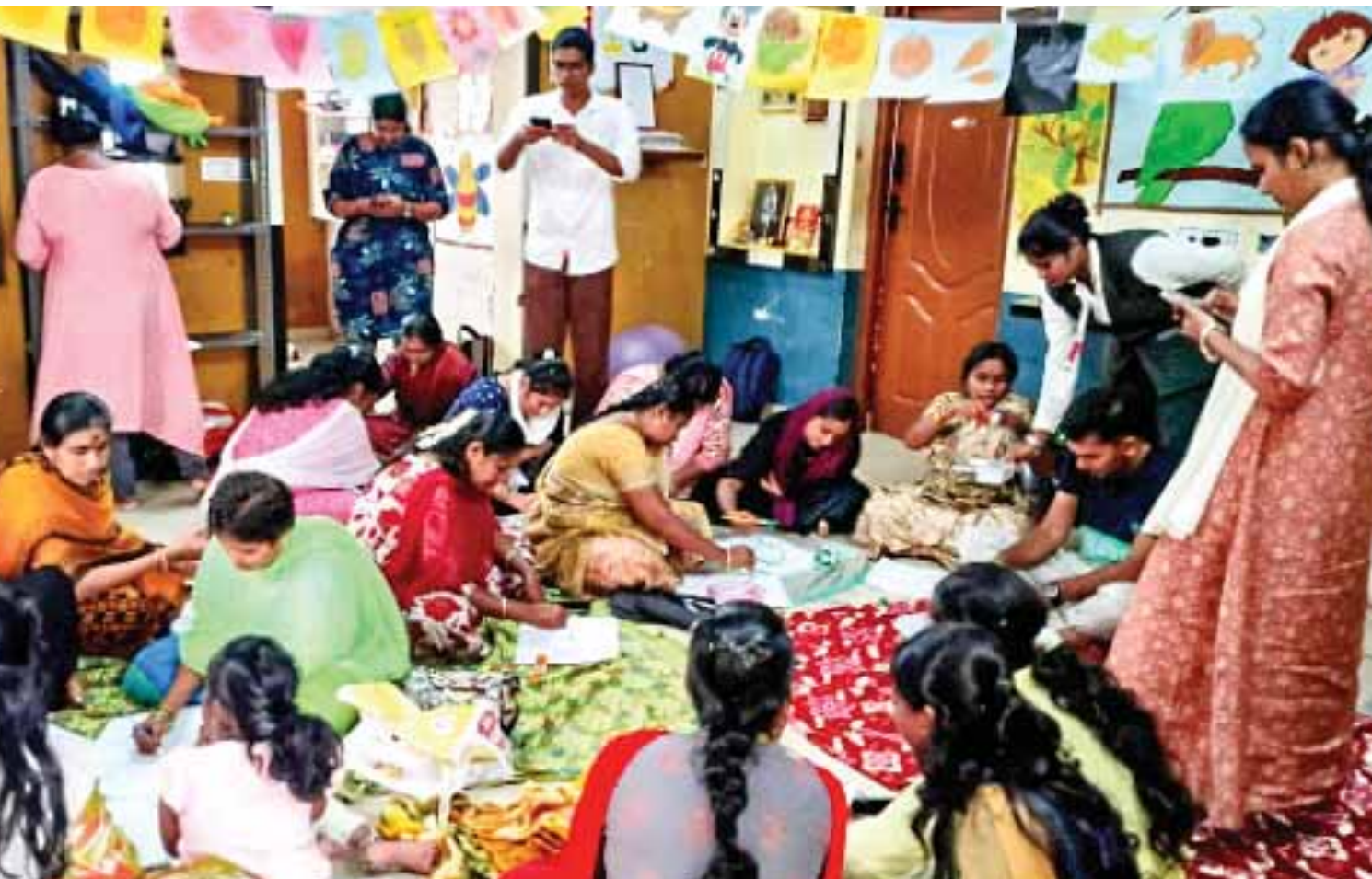
Parents of children with disability engaged in therapeutic activities.

A blood donation camp organised at the NGM College in the town saw overwhelming participation from students, Rotaractors and members of the public. Over 70