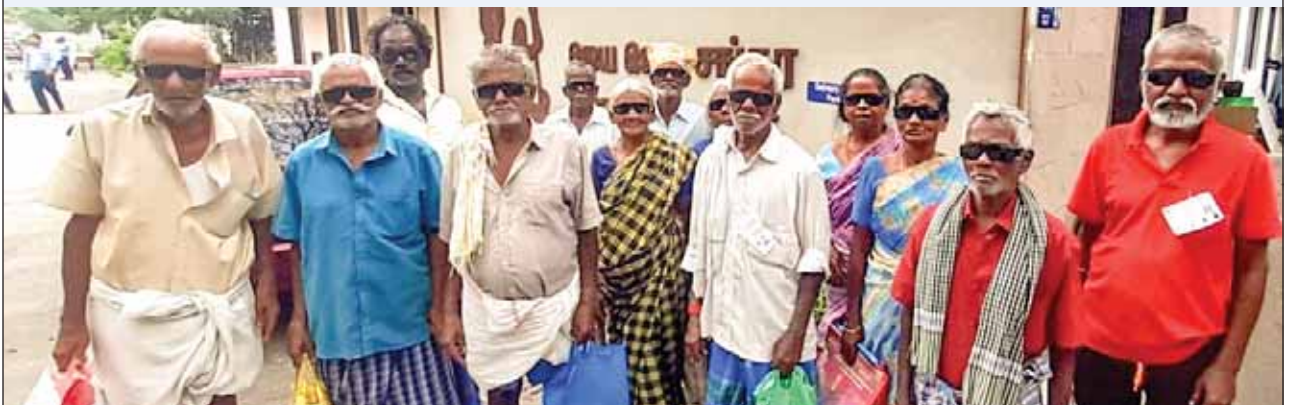
Beneficiaries after cataract surgery.

The club also conducted an eye care camp at the Sarkarsamakulam Town Panchayat in association with the Sankara Eye Hospital. The camp catered to residents of 12 surrounding villages. Beneficiaries requiring further treatment were transported to the hospital, where cataract surgeries were done. The patients were sent back home. ■