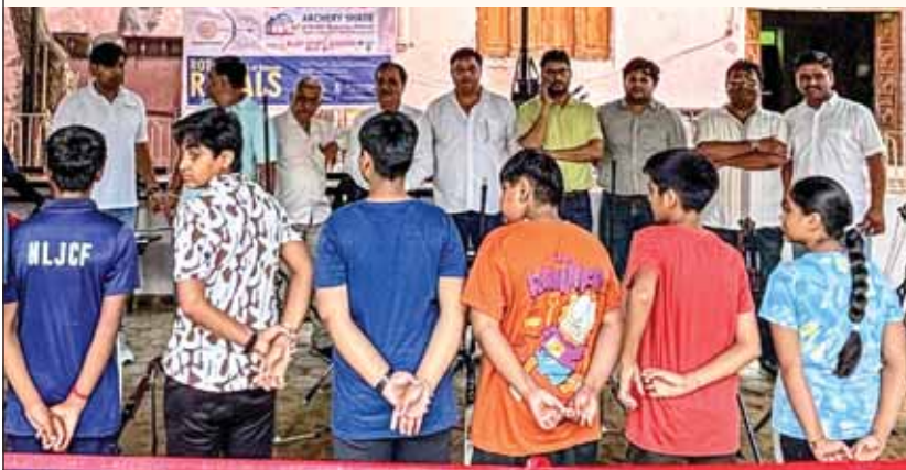
Young archers and Rotarians at the inauguration of the new shed at Eklavya Archery Academy.