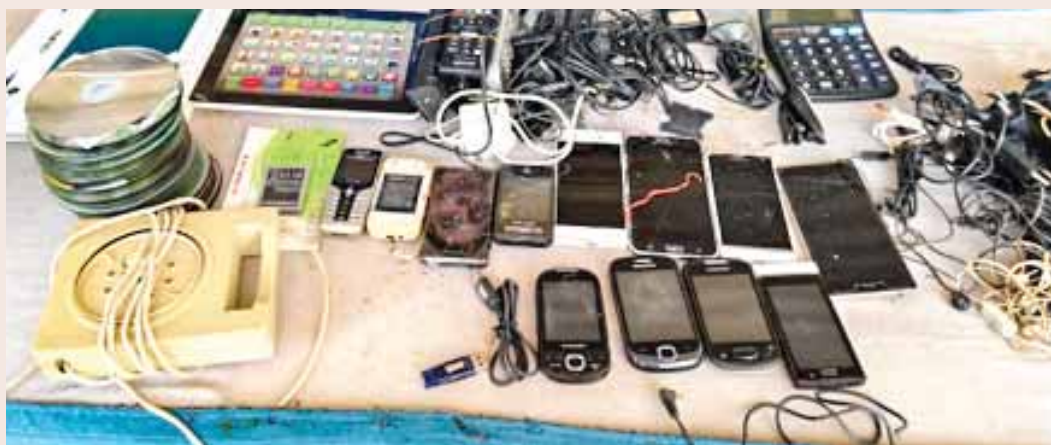
E-waste collected by RC Amreli Gir.

The Rotary and Rotaract Clubs of Amreli Gir, RID 3060, organised an e-waste collection drive that gathered more than 300kg of discarded electronic items, including laptops, mobile phones, televisions and cables. The waste was handed over to an authorised recycler. According to the club, the effort prevented an estimated 450–600kg of CO 2 emissions, the equivalent of planting 25–30 trees. The drive also helped raise local awareness about responsible disposal of e-waste.