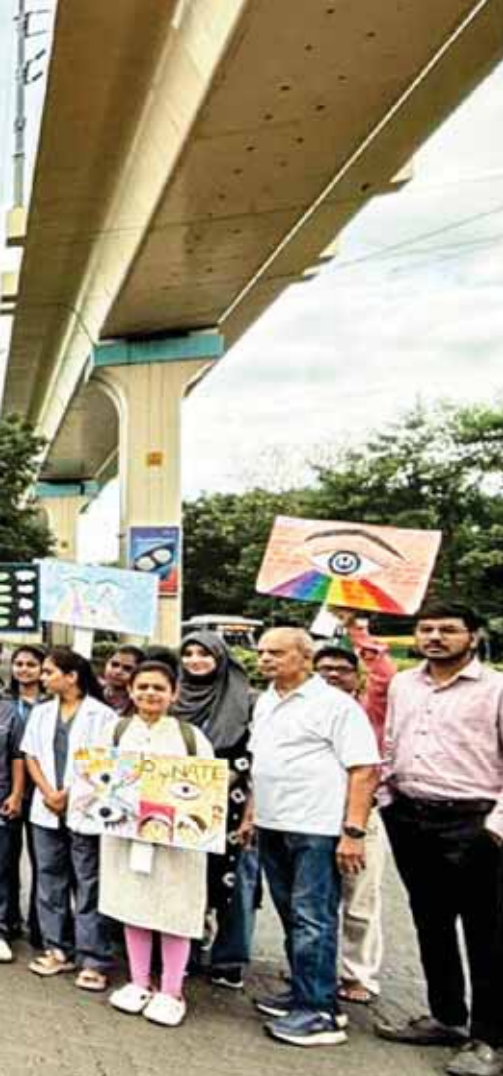
Club members along with medical students and Interactors at an eye donation awareness rally.

Over 2,500 students and teachers have been trained in CPR and Basic Life Support in collaboration with Swasthya Hospital and Chitnavis Trust.