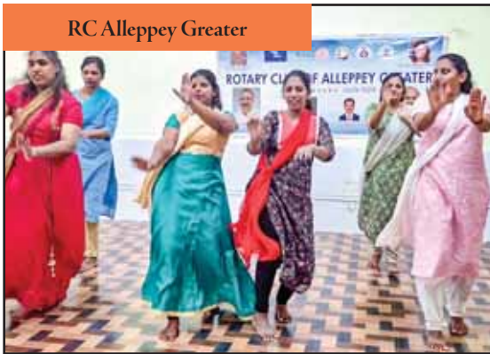
RC Alleppey Greater