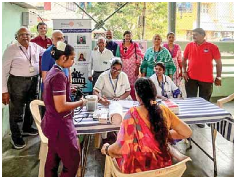
A patient being screened at the health camp.

R C Nanganallur Elite, RID 3234, conducted Nrithya Utsav , a Bharatanatyam competition to promote classical dance and provide young performers with a platform to showcase their talent.