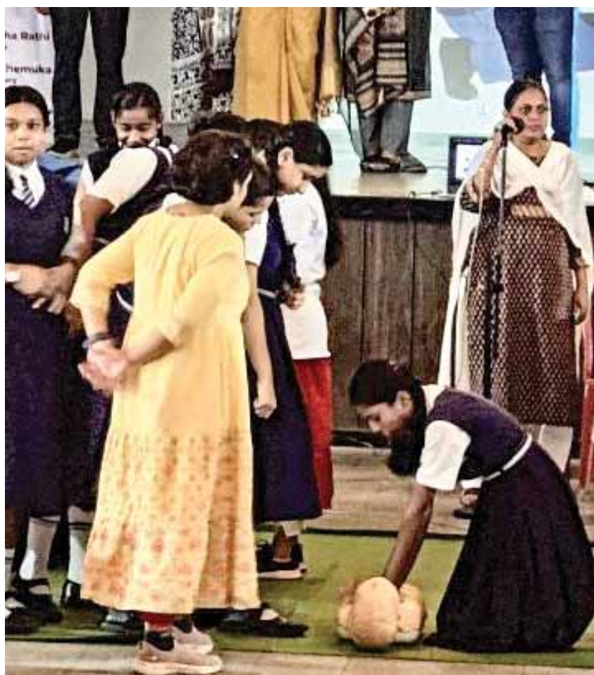
A student performs CPR in the presence of medical trainers.