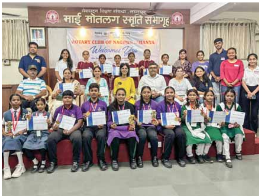
Winners of the drawing competition which was part of the eye donation awareness programme.