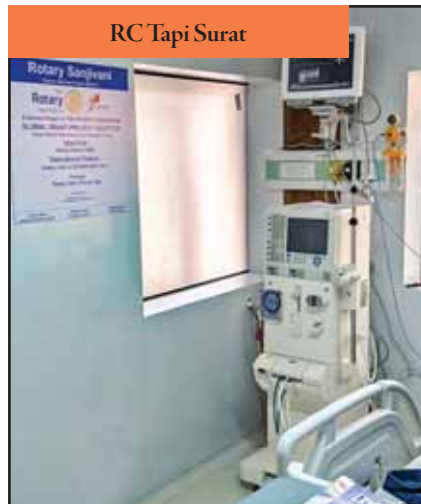
RC Tapi Surat