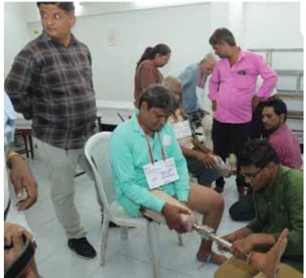
A person being fitted with a prosthetic limb.