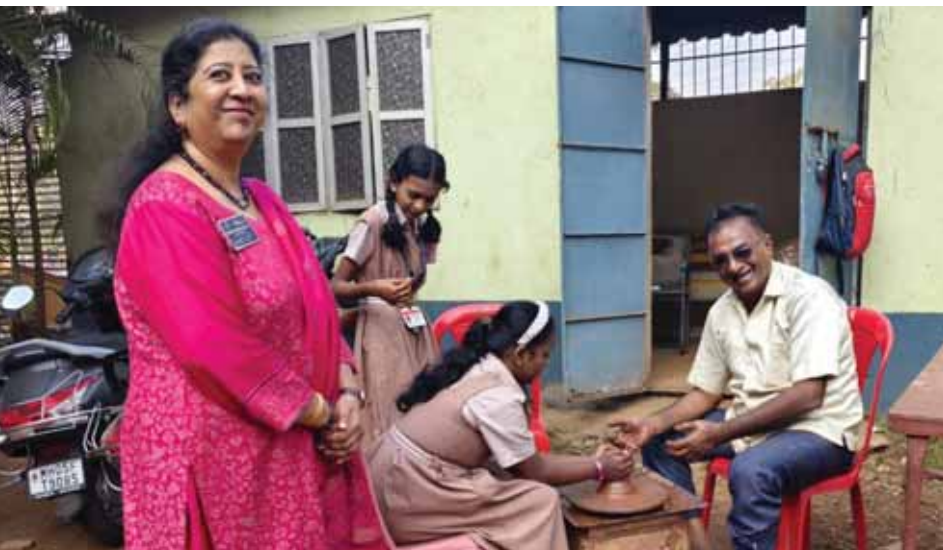
A pottery workshop for Interactors as part of the National Wildlife Week celebrations.