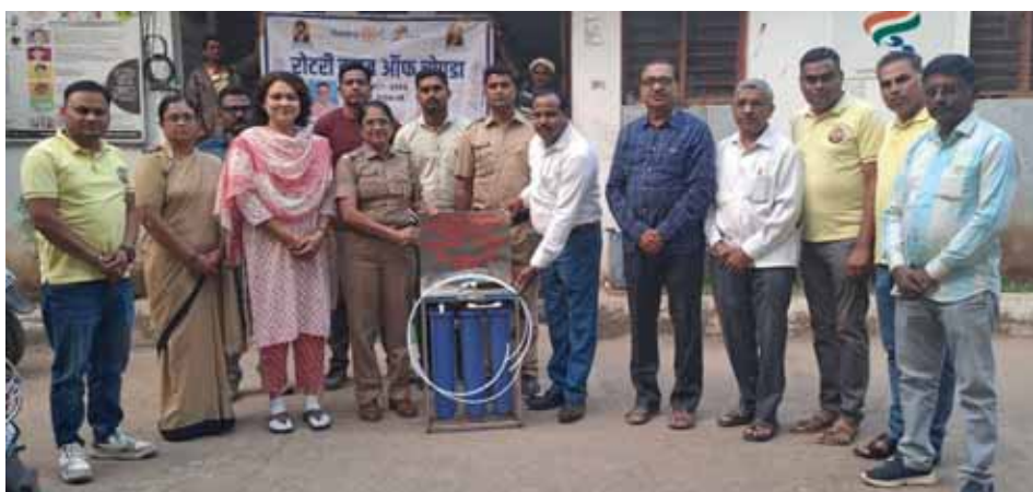
Rotarians and police personnel at the installation of a water purifier at the Chopda police station.