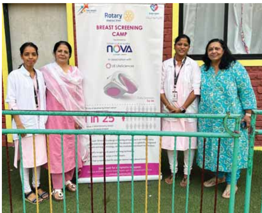
Rotarians with doctors at the breast cancer screening camp in Kandivali, Mumbai.

Over 75 patients were examined at a breast cancer screening camp organised by RC Mumbai Kandivli West, RID 3141, at the Ekveera School, Charkop, in partnership with RC Mumbai Nova.