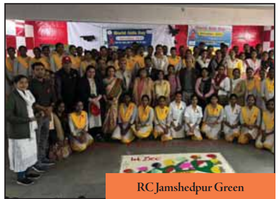
RC Jamshedpur Green