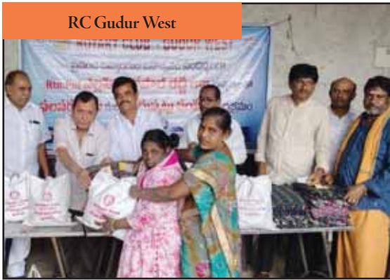
RC Gudur West