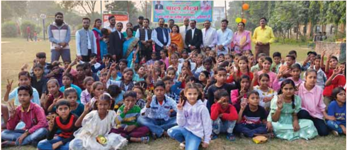
Rotarians along with children at the Bal Mela.