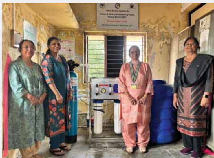
Water filter installed at the village school.