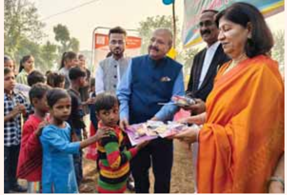
A participant receiving a gift hamper from a Rotarian.