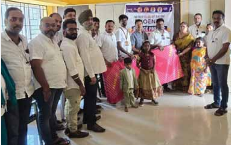
Club members inaugurating the renovated orphanage.

R C Salem Phoenix, RID 2982, completed a service project worth ₹1.35 lakh to benefit children at the Annai Sathya Ilam, an orphanage for children aged 4 to 15 years.