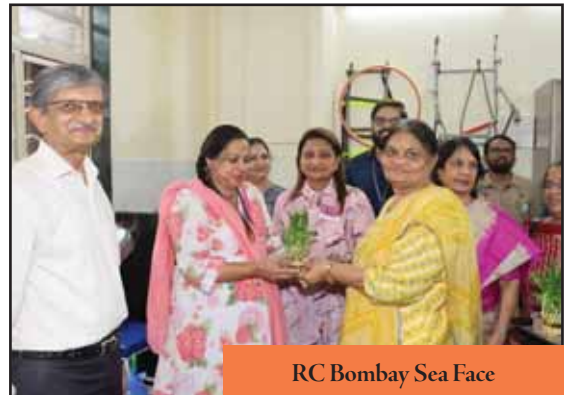
RC Bombay Sea Face