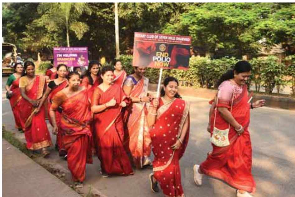
Participants of the Rotary Saree Run.

In another initiative, the club donated solar bulbs to a government school and to a household. ■