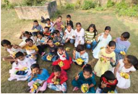
Children enjoying nutritious snacks.