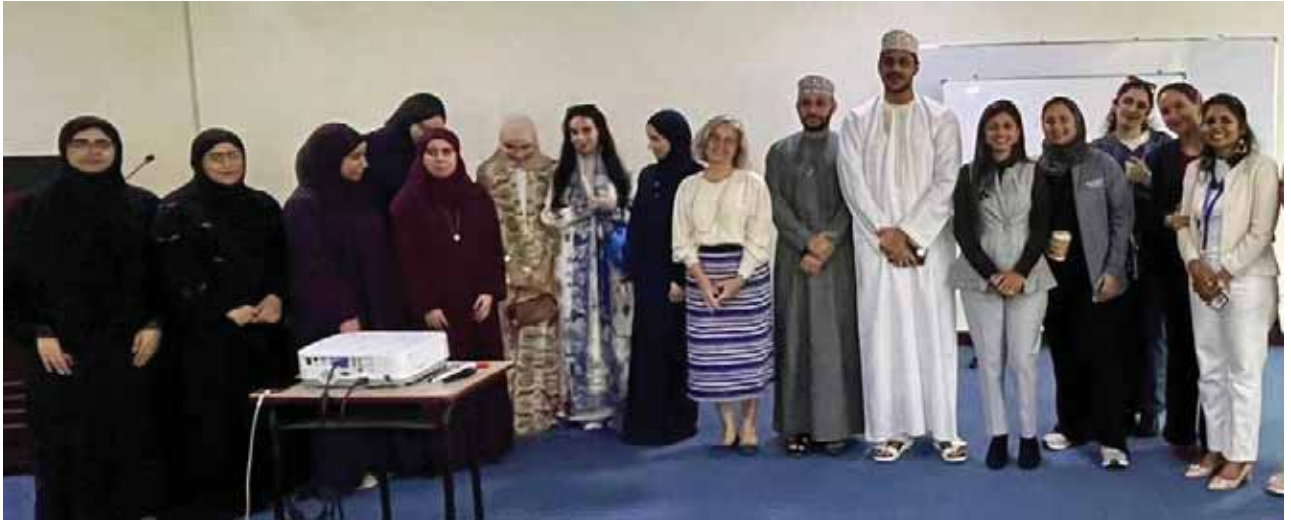
Dental students and doctors at the workshop on deaddiction therapies in Muscat.

Around 75 dental students and dentists took part in a training workshop on deaddiction therapies conducted by RC Addiction Prevention, RID 3141, its first global project of the year, at the Oman Dental College in Muscat.