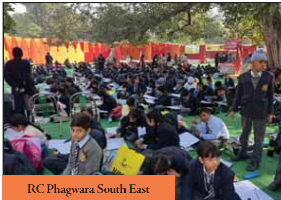
RC Phagwara South East