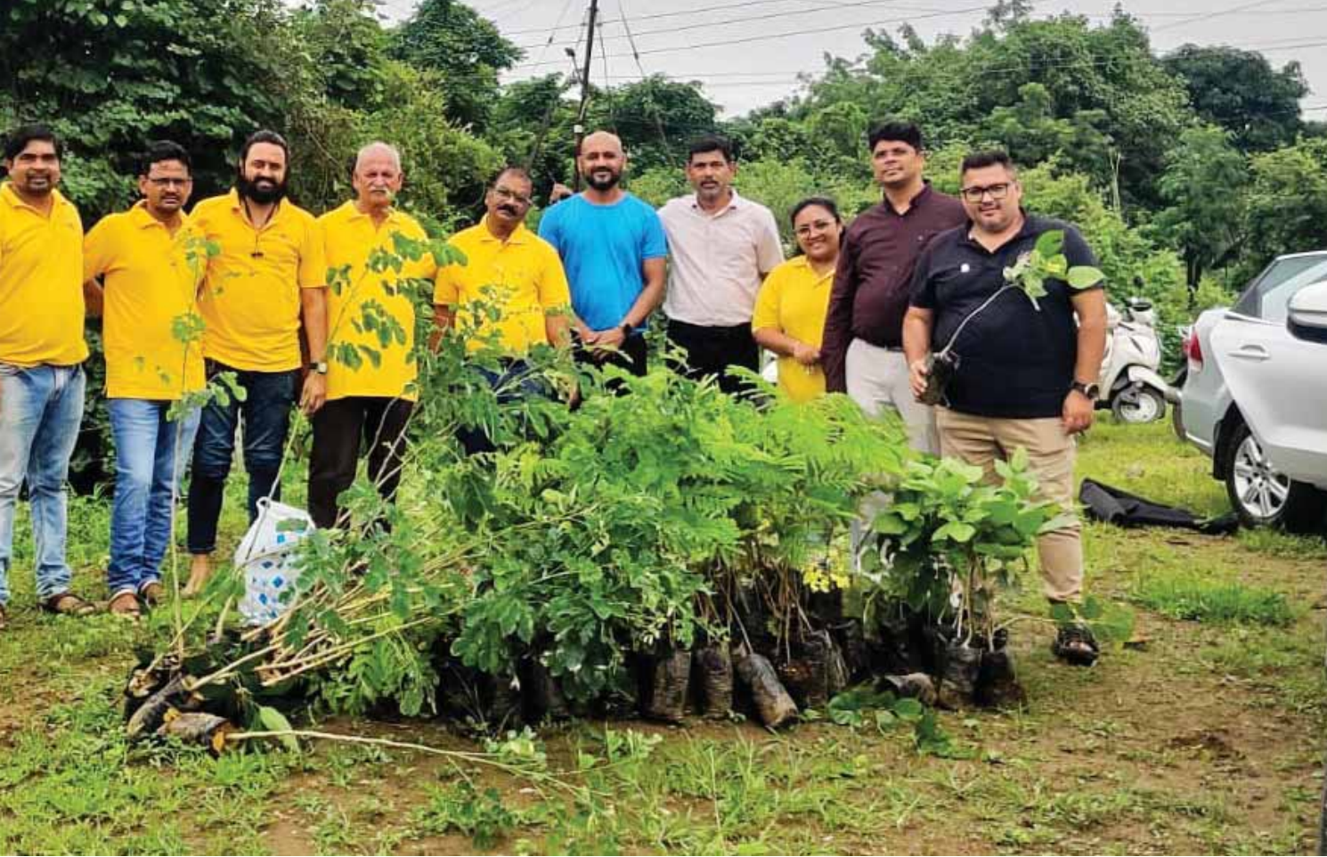
Above: Club members with saplings ready for planting.