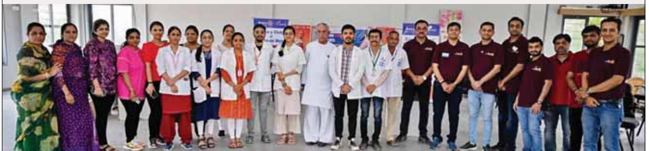
Medical staff along with club members at the blood donation drive.

In collaboration with RCC Bhojka, the club distributed school bags, uniforms, and stationery kits to 210 students at Bhojka village school. They also provided lunch to the students and participated in a tree plantation drive at the school. This project, aimed at promoting basic education and literacy, was done at a cost of ₹50,000. ■