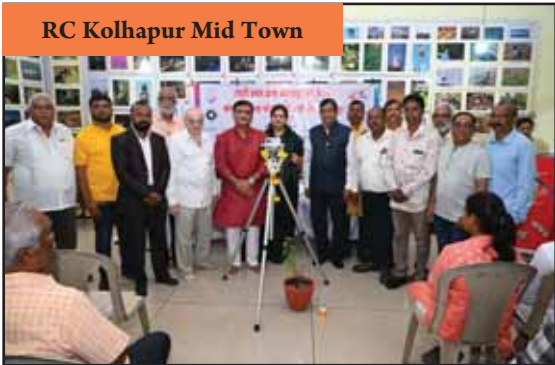
RC Kolhapur Mid Town