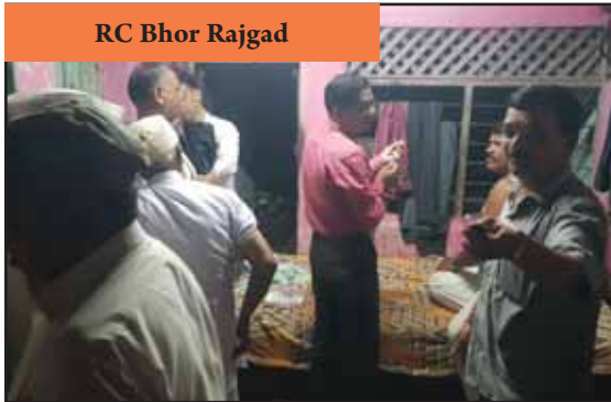
RC Bhor Rajgad