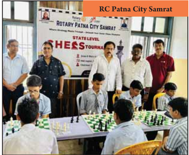
RC Patna City Samrat