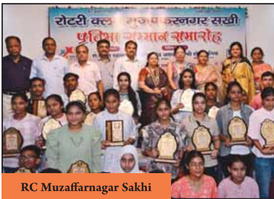
RC Muzaffarnagar Sakhi