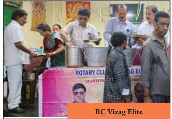
RC Vizag Elite