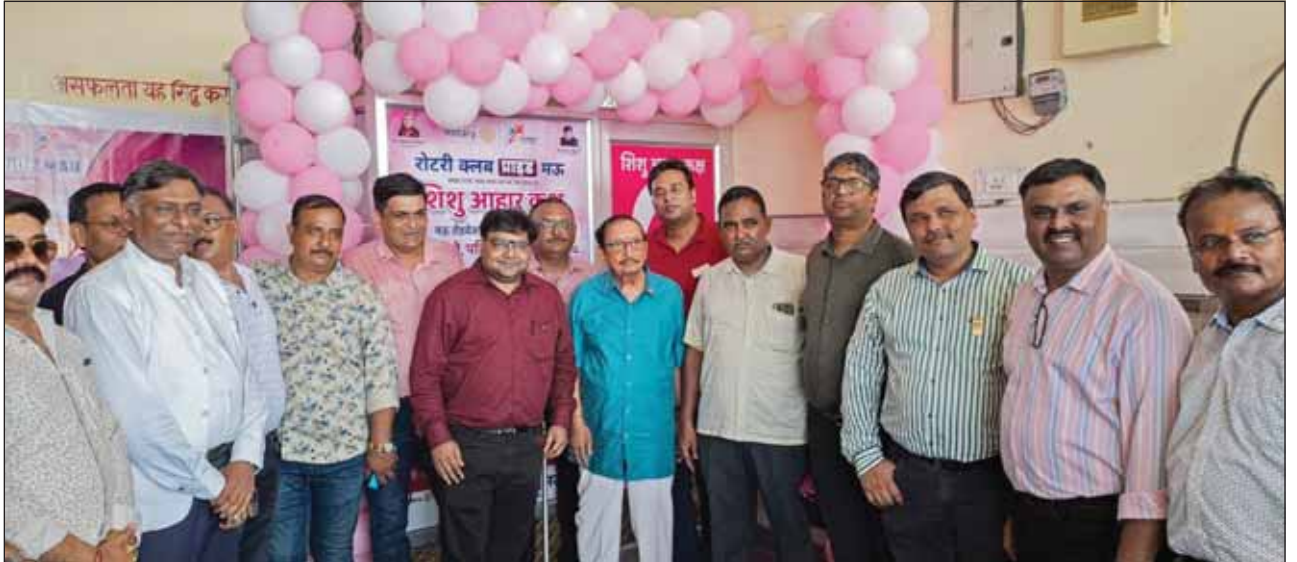
Members of the club at the inauguration of a breastfeeding room at a government bus stand in Maunath Bhanjan.