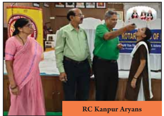
RC Kanpur Aryans