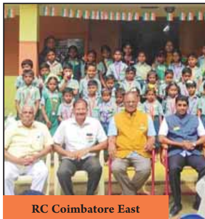
RC Coimbatore East

Over 500 pictures were displayed at the three-day photography exhibition and competition. Kolhapur MP Dhananjay Mahadik distributed prizes to the winners. The exhibition titled 'Nature and heritage of Kolhapur' was held to celebrate World Photography Day at Shahu Smarak Bhavan.