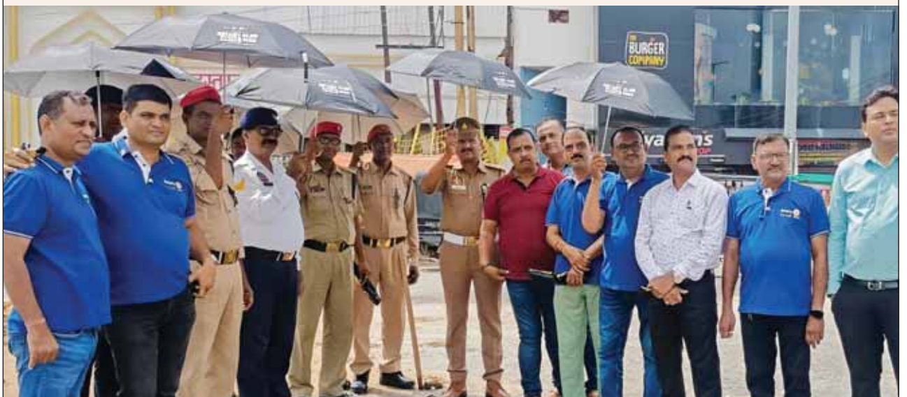
Rotarians, along with police personnel, after the umbrella distribution.

The club also distributed 60 umbrellas to traffic police constables stationed at various road junctions across the city. The initiative aims to protect police personnel from the sun and rain while they manage traffic at the busy areas. ■