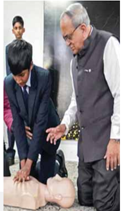
A CPR session in progress.

The club is keen to spread the CPR awareness as it would create a set of good Samaritans who can readily provide emergency help to victims of cardiac arrest before they are admitted to hospital. ■