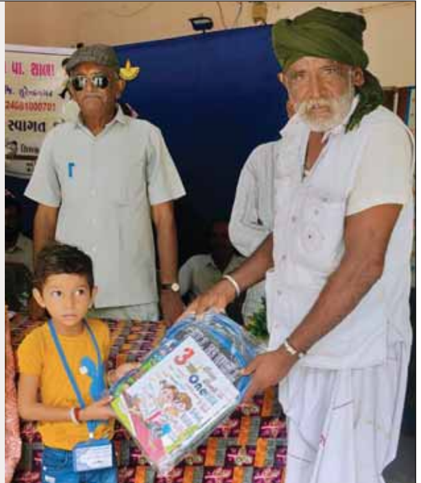
A child receiving a stationery kit at the Bhojka village school.