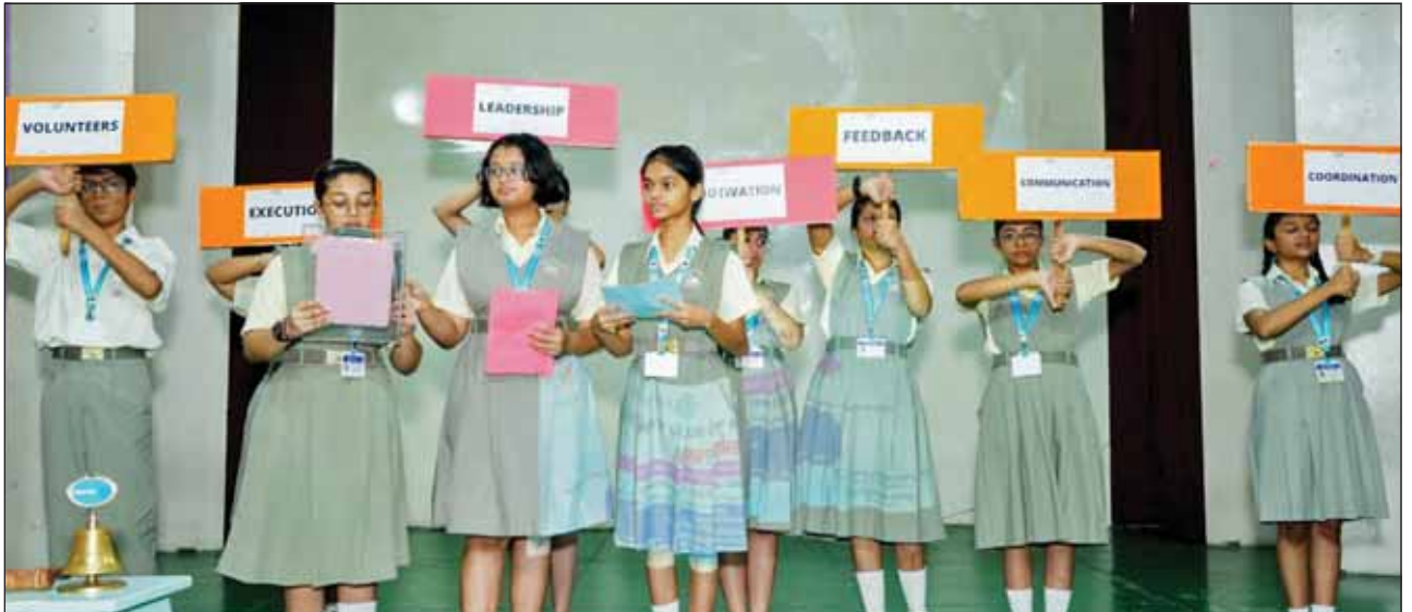
School students performing a skit at the Interact District Training Assembly titled Sanskar .