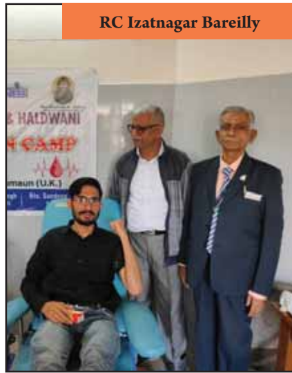
RC Izatnagar Bareilly