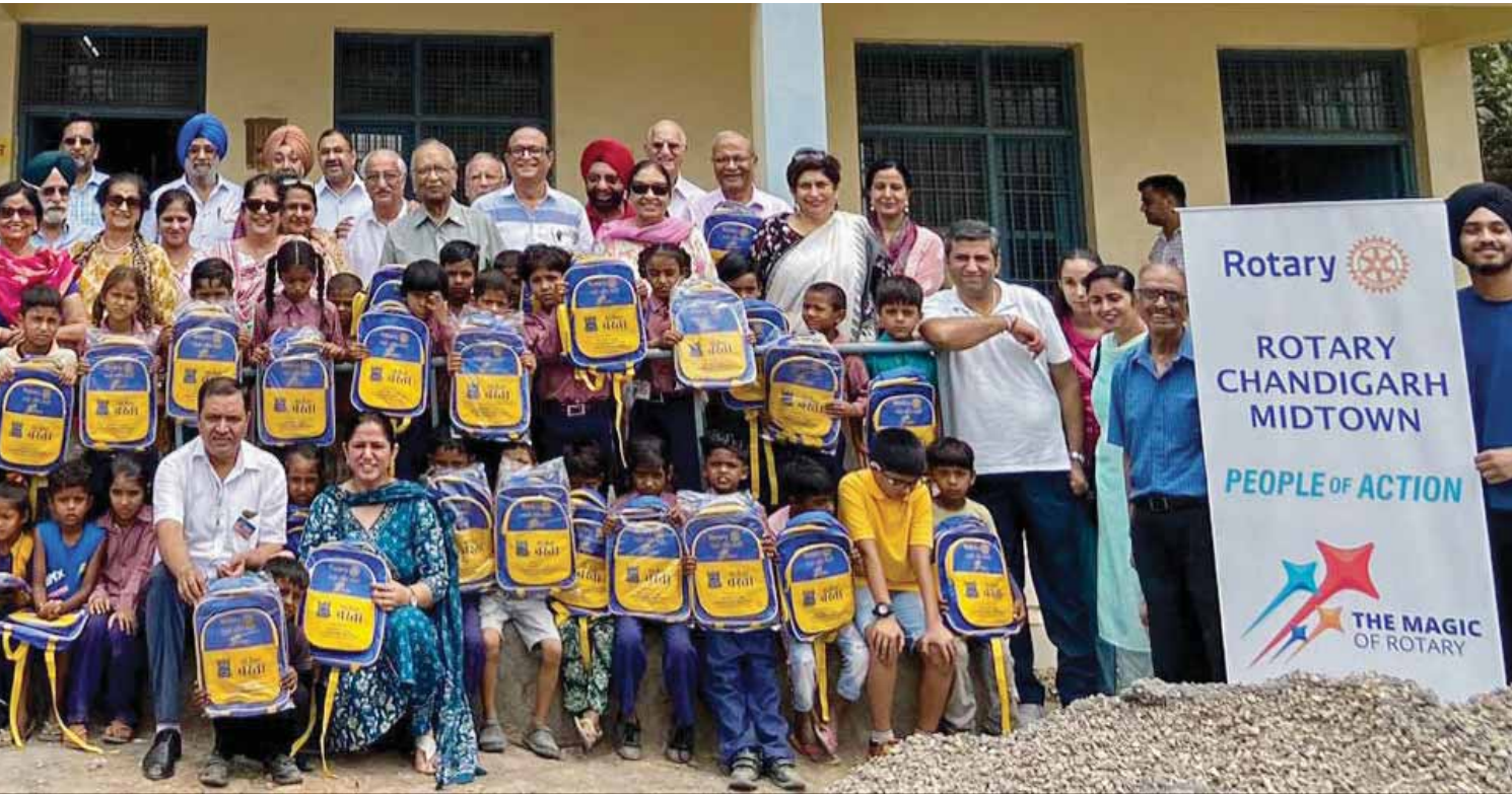
Above: Students with school bags along with members of RC Chandigarh Mid Town.