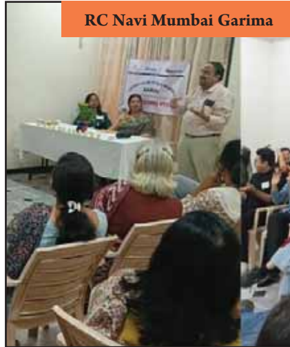
RC Navi Mumbai Garima