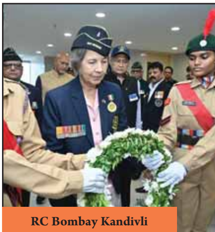
RC Bombay Kandivli

A medical check-up camp was held for around 150 pilgrims (Warkaris) to the Raireswar Temple in Bhor taluk near Pune which attracts thousands of devotees. A tetanus vaccination and medical kit were given to all the pilgrims who were also served a delicious food.