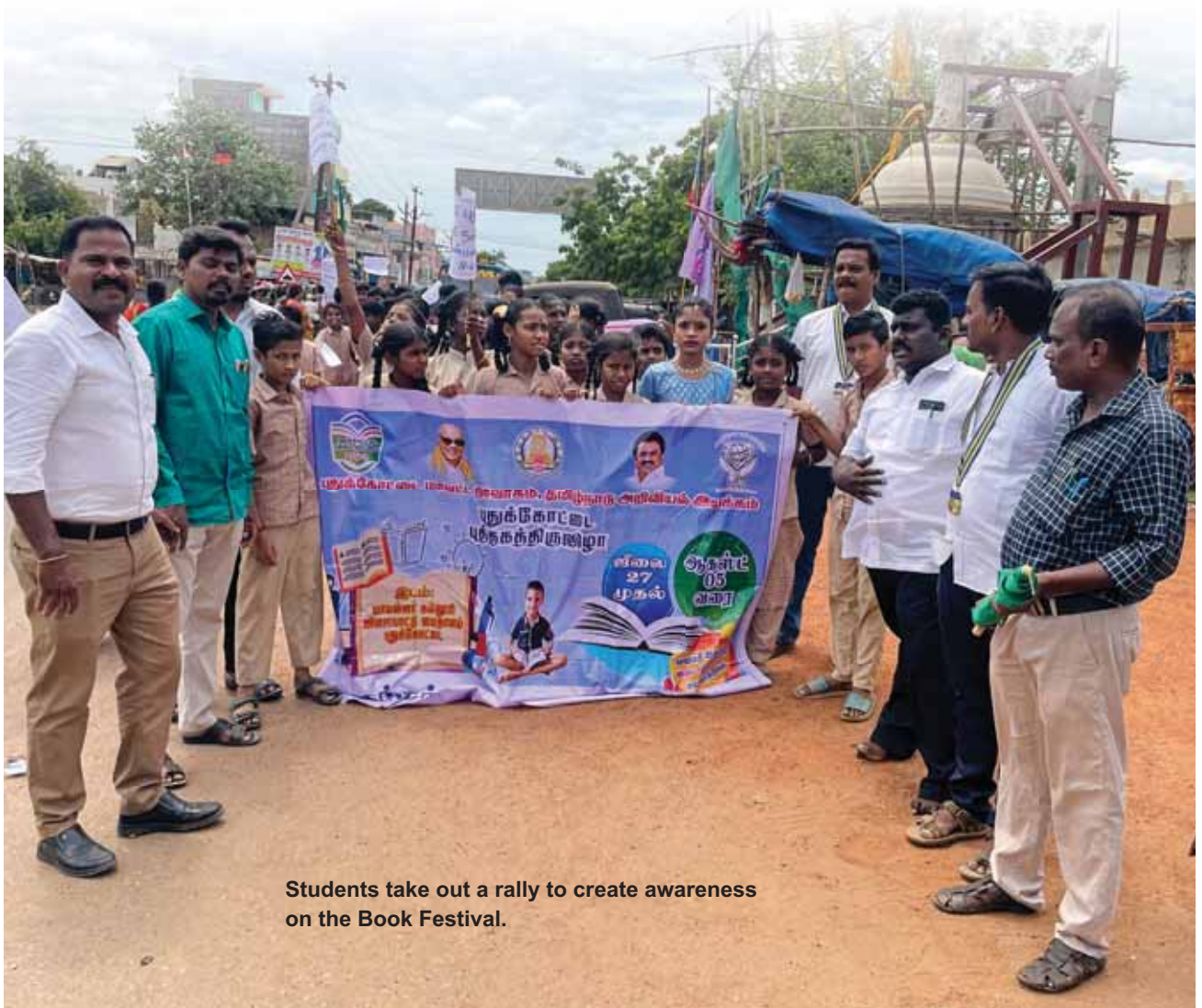
Students take out a rally to create awareness on the Book Festival.

Apart from the awareness campaign, the district officials, along with Rotary, has taken