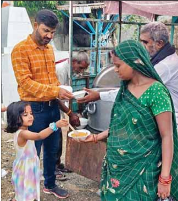
A Rotary Annet serves food to a couple.