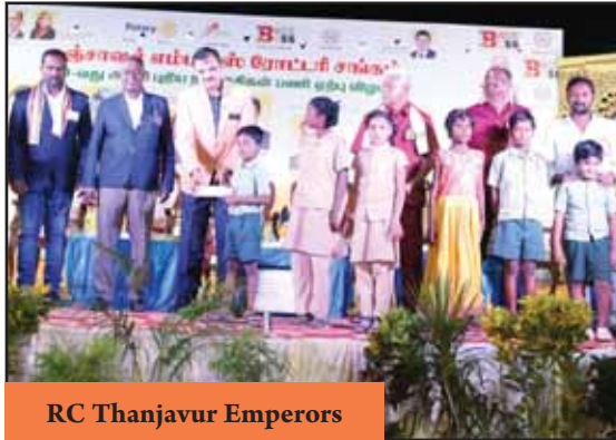
RC Thanjavur Emperors