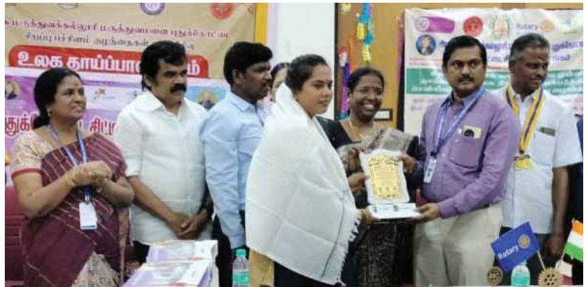
A new mother being felicitated as part of the club's Breastfeeding Week celebration.

The nurses in the neonatal ward of the hospital were also honoured for their commitment in educating young mothers about the importance of feeding breastmilk to the newborn. ■