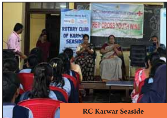
RC Karwar Seaside