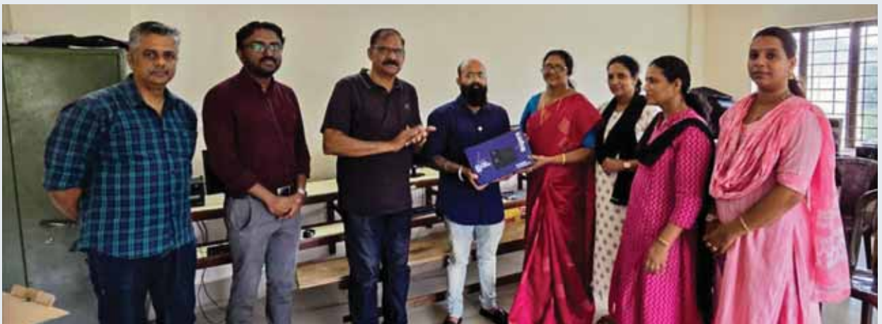
Computer accessories being given to the school administration.

The Rotary Club of Cochin Beach Side, RID 3201, equipped the government high school in Ernakulam district with new computers and an inverter at the computer lab set up by the club few years ago. The club refurbished the old computers and accessories that they had earlier donated.