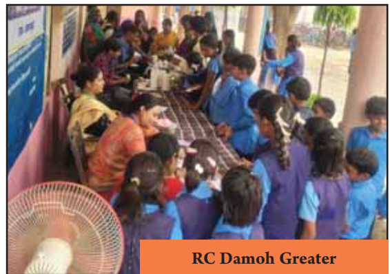
RC Damoh Greater