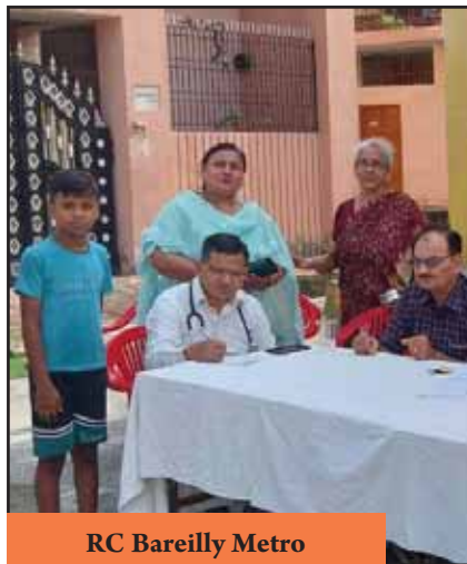
RC Bareilly Metro