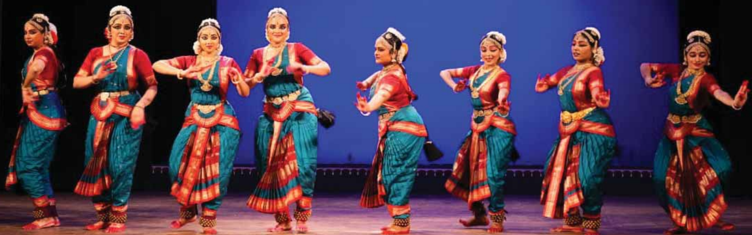
A Bharatanatyam dance performance.