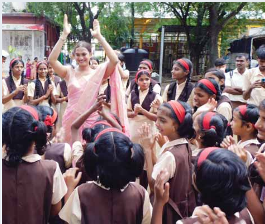
Children enthusiastically vibing with a transwoman during the Ganesh festival.