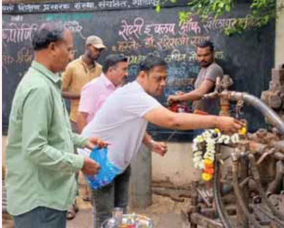
Rotarians at the inauguration of a water pump at the Vimal Kanya Prashala, Solapur.