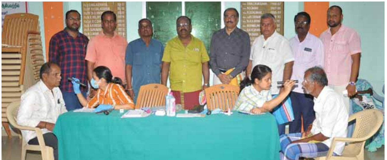
An eye check-up camp in progress.