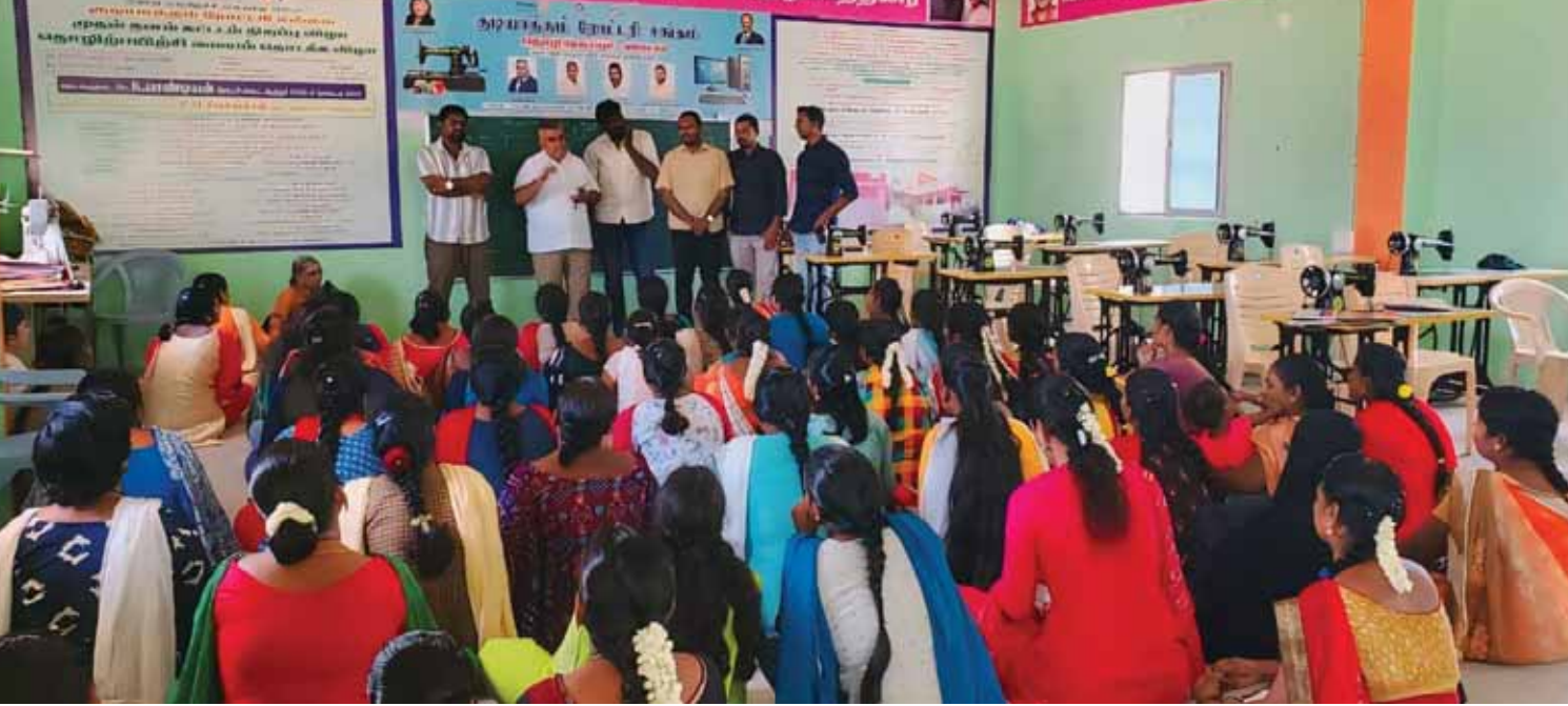
An orientation session for new batch at the tailoring centre.