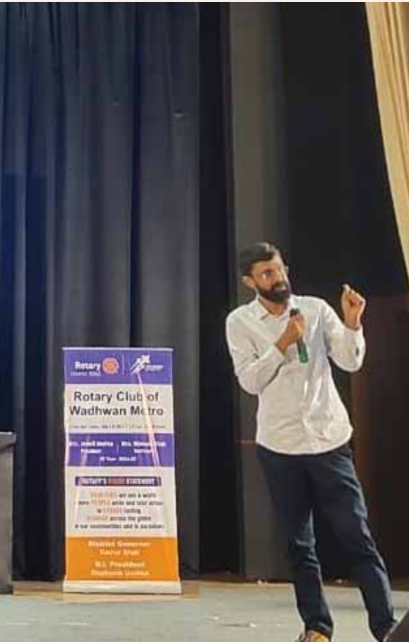
Above: An official giving a presentation at a cybercrime seminar.