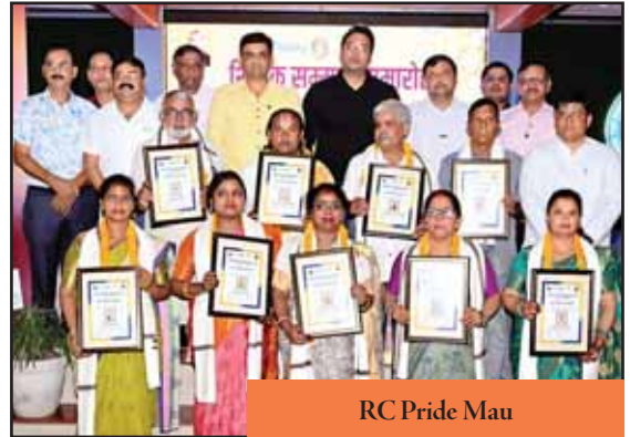
RC Pride Mau