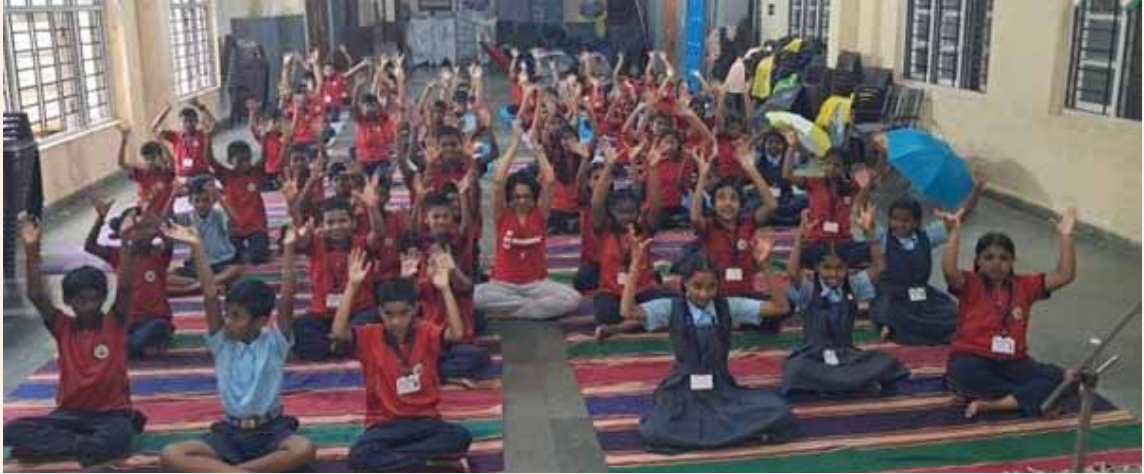
School children at a yoga session.