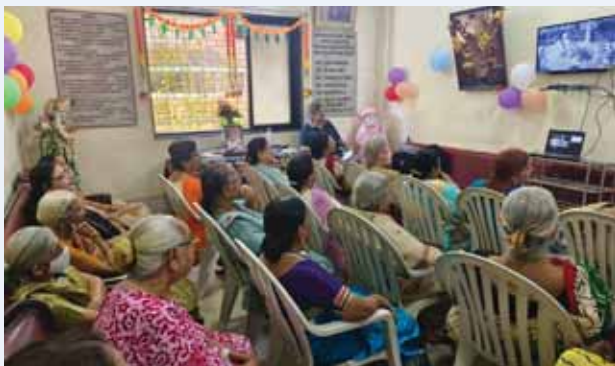
Elders watching a classic Hindi film song at Project Manoranjan Seva .

In a novel outreach to the elderly people, RC Navi Mumbai, RID 3142, is conducting Manoranjan Seva , an interactive fun show for the inmates at the old age homes. “What the