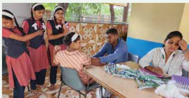
Interactors volunteering at the medical camp in Ahmednagar.