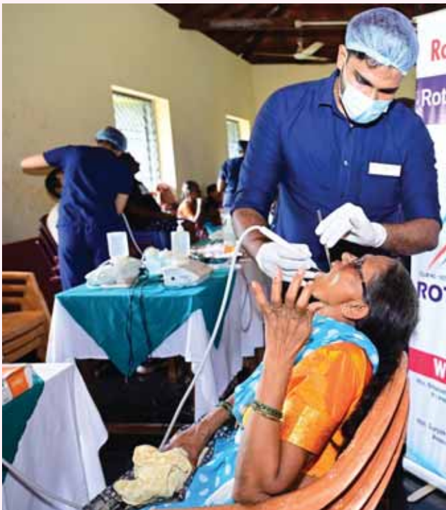
A beneficiary undergoing dental screening.