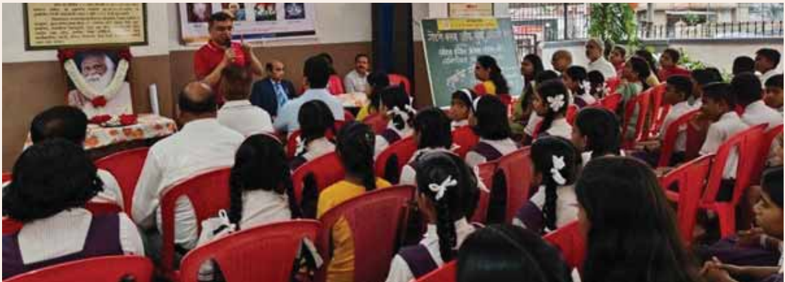
Students attending a lecture.

The project is valued at ₹8 lakh. It is supported by Rotarians, CSR contributions, and other sponsors.■