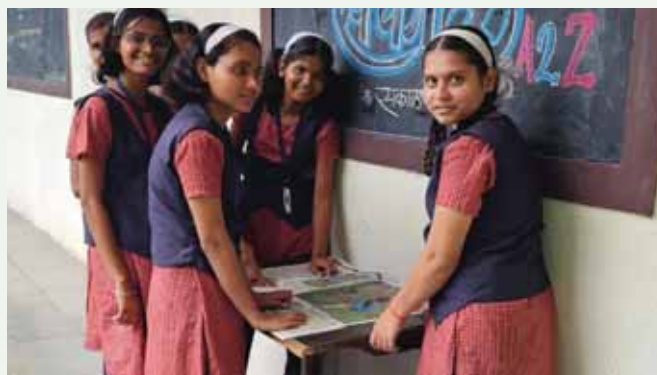
Interactors at the newspaper reading corner.

The Interact members recycled pistachio shells and dried leaves to craft handmade greeting cards and decorative items. They are also preparing to install peace poles at their schools. ■