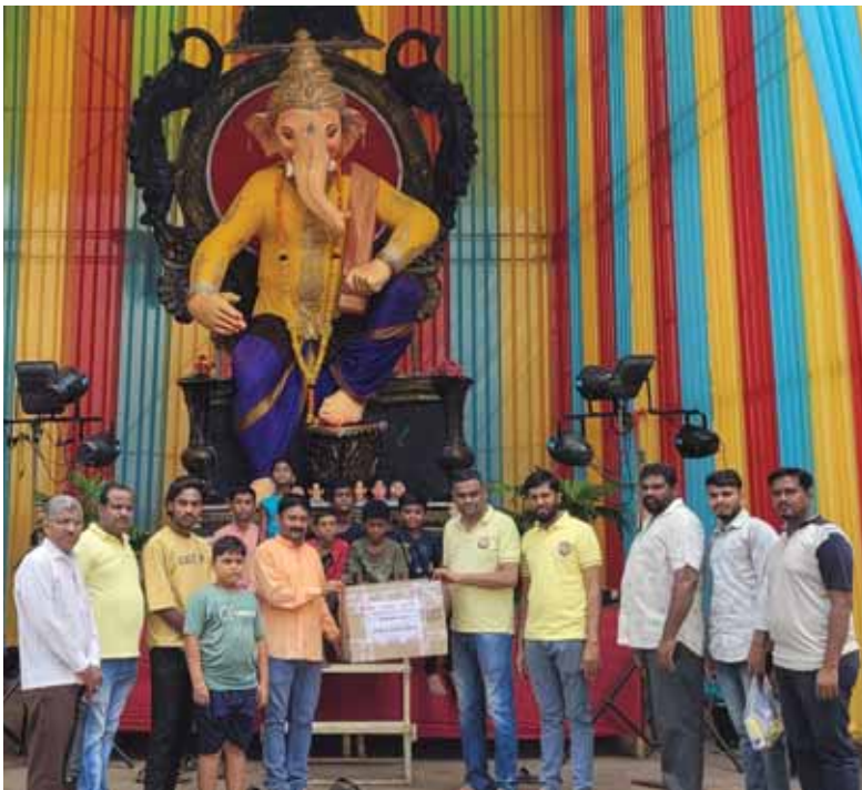
Club members collecting organic waste from a Ganesh pandal.

A seminar on financial management and investment options was hosted by the club for youngsters at the Social Works College in the city. Another seminar to educate people about cervical cancer and its prevention was organised at the college in partnership with the Inner Wheel Club of Chopda. Lectures and poster competition formed part of the event to drive home the message. ■