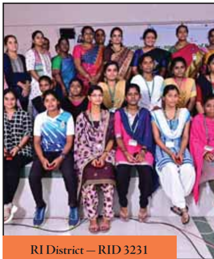
RI District – RID 3231

Over 500 students were screened at an eye check-up camp held at the Doon Heritage School under Project Sudrishti . Held in partnership with the Siliguri Lions Netralaya, the camp identified 117 students for urgent eyecare.