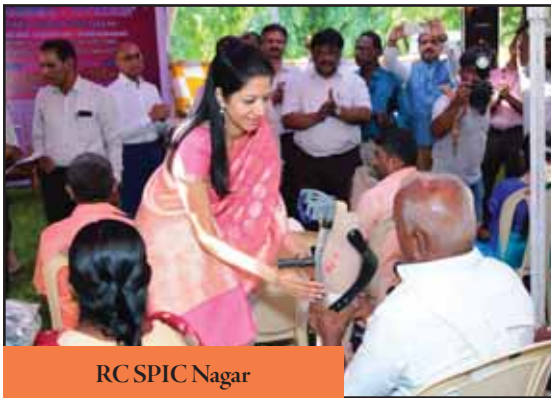
RC SPIC Nagar