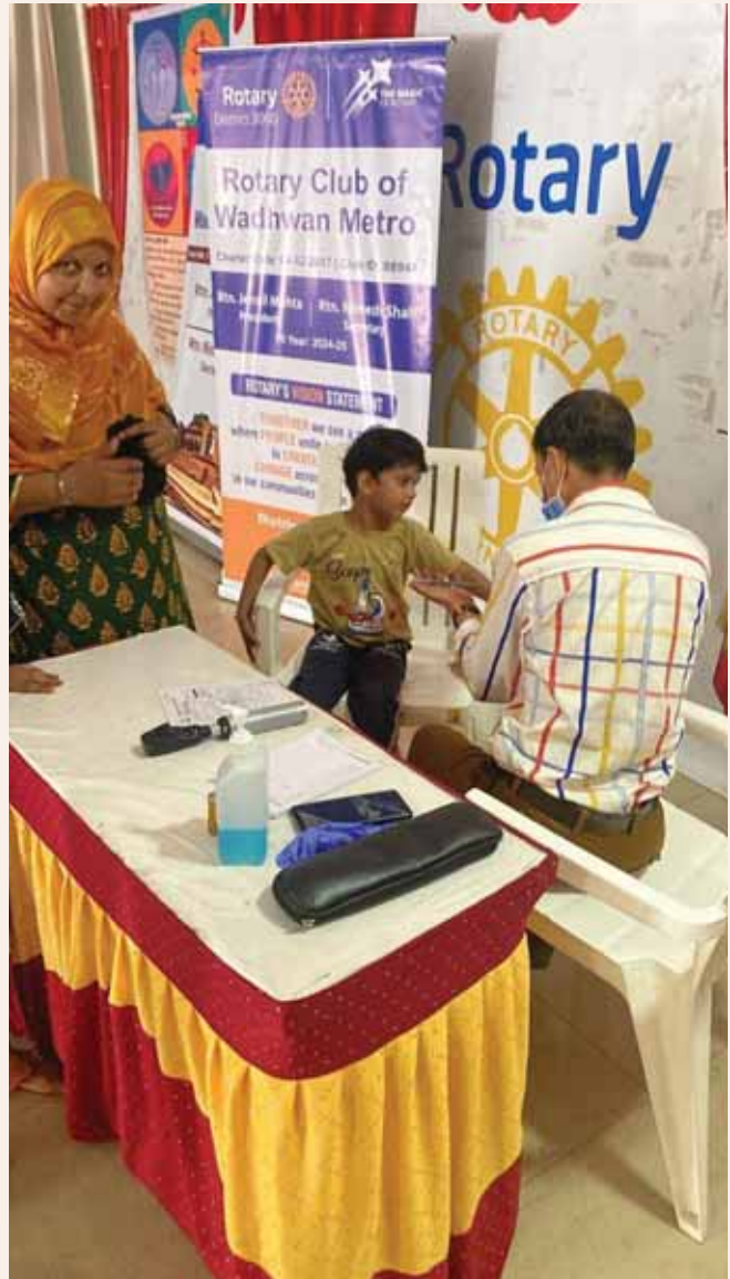
Right: An eye camp in progress.

selected for cataract surgery with the club paying for the treatment, accommodation and food at the hospital.