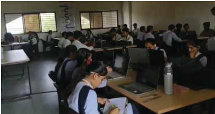
Students in the digital classroom set up by RC Bangalore Palmville.

Rotary Club of Bangalore Palmville, RID 3191, sponsored a digital classroom at the Sant Singaji Educational Society in Sandalpur district, Dewas, Madhya Pradesh. This project will benefit 1,100 students enrolled in the school. The project cost was