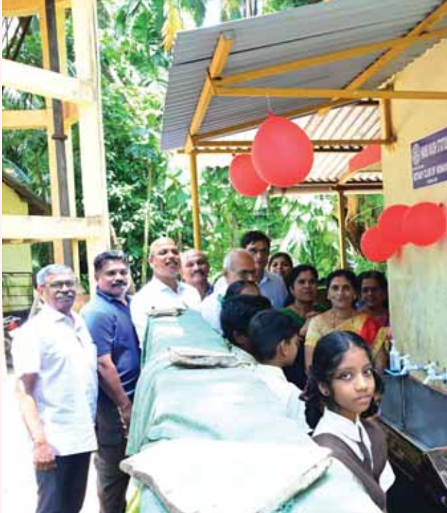
Club members at the inauguration of the handwash station at the Government Primary School in Honavar.