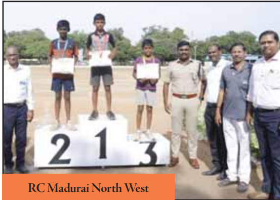
RC Madurai North West