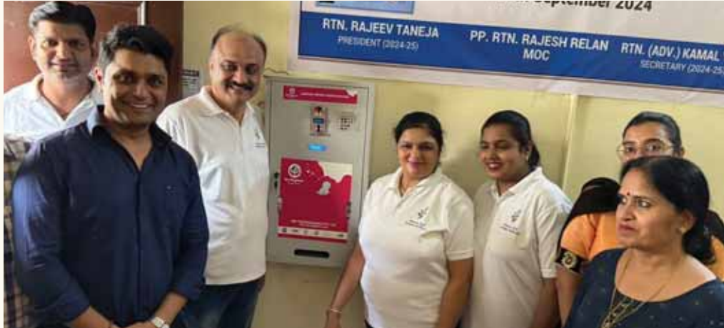
Club members after inaugurating the automatic sanitary vending machine at GVM IITM, Sonapat.

R C Sonapat Midtown, RID 3012, installed a sanitary vending machine at GVM IITM, Sonapat.