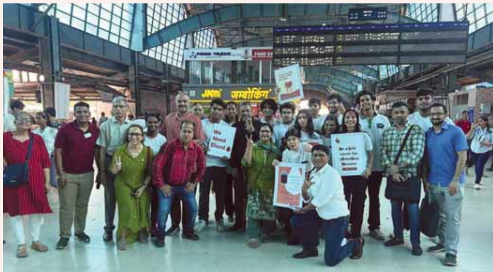
Club members promoting blood donation at a railway station in Mumbai.

A round 115 Rotary clubs of RID 3141 participated in the Vibrant Life Saving Express Blood Donation Drive and clocked in 3,719 units of blood through 47 blood donation camps conducted over 100 days across Mumbai.