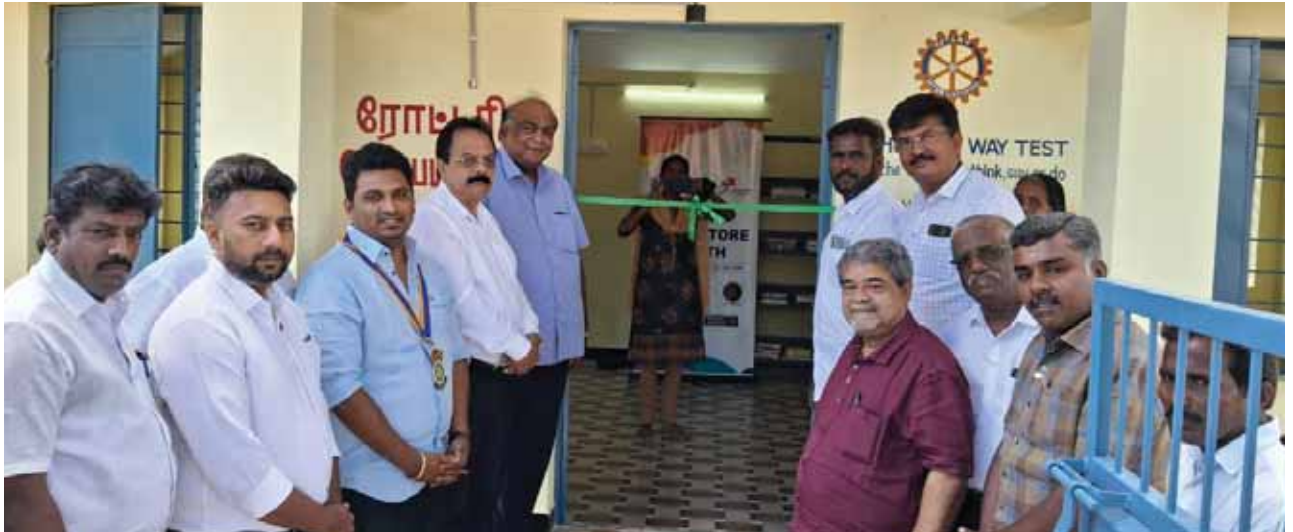
Members of RC Coimbatore Zenith ready to inaugurate the library at the Kanjapally village.

Over 4,500 people will benefit from a library facility established at the Kanjapally village, near Annur in Coimbatore, by RC Coimbatore Zenith, RID 3201. The library