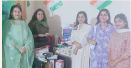
Rotarians at the Anmol Sahara NGO, Delhi, where the club has started the Beauty Culture course.