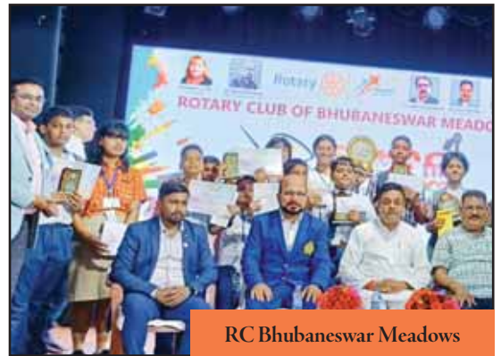
RC Bhubaneswar Meadows