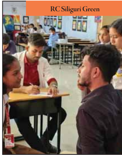
RC Siliguri Green