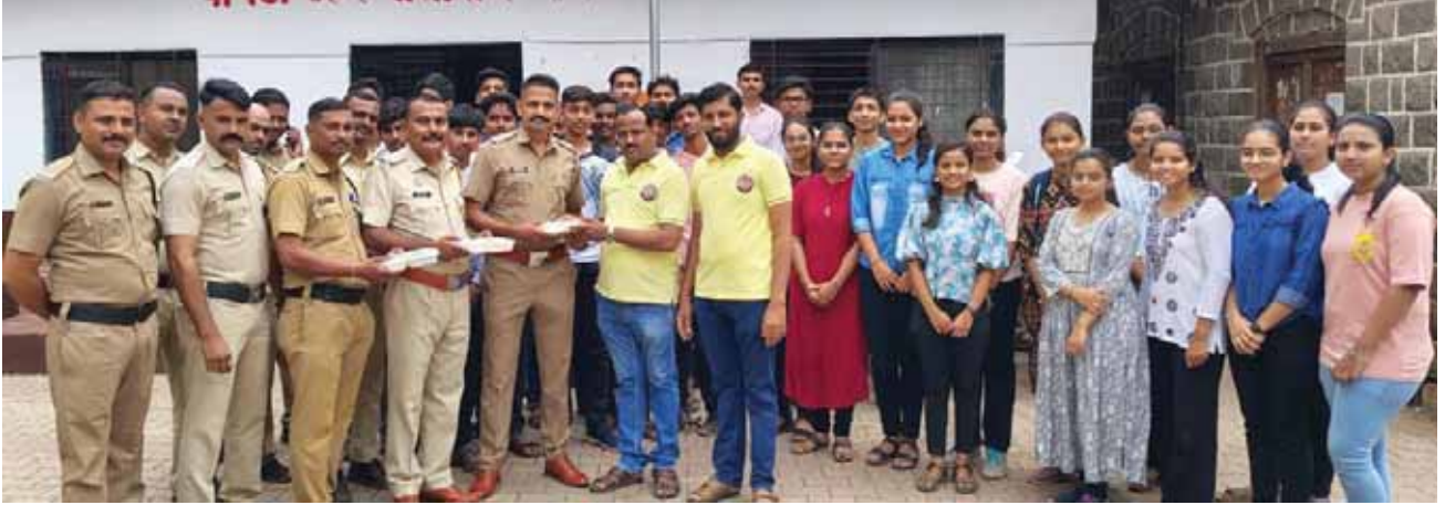
Members of RC Chopda and Rotaractors distributing poha and sheera to police personnel.

T he Rotary Club of Chopda, RID 3030, collected flowers and other organic offerings used for worship from various pandals during Ganesh Utsav. Carton boxes were kept at the pandals for disposing used floral offerings. “At the end