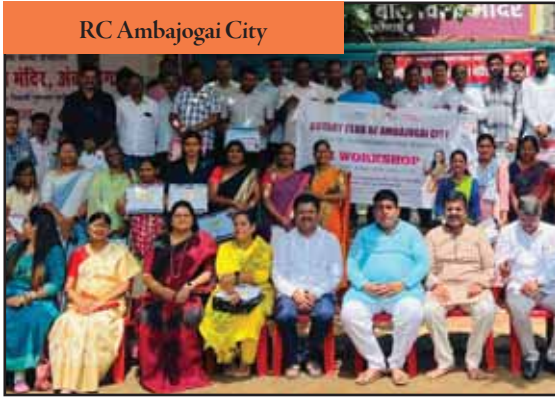
RC Ambajogai City