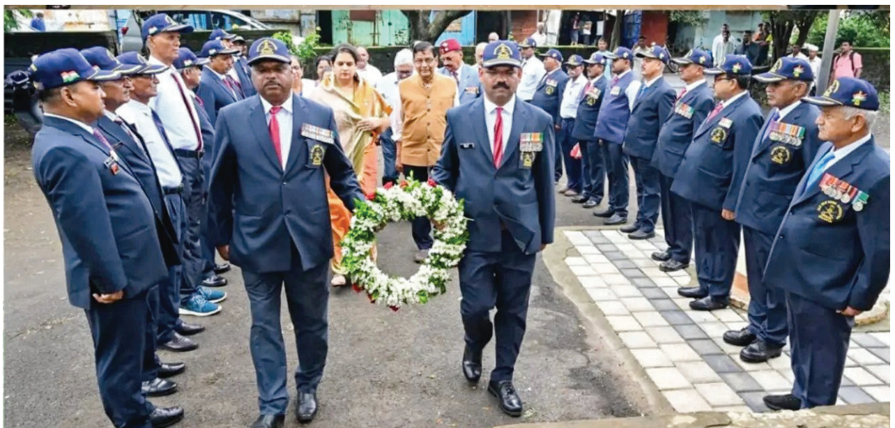
A wreath being laid to honour army men killed during the Kargil war.