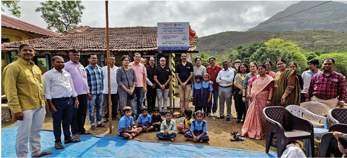
Rotarians with students at the renovated school in the tribal hamlet.