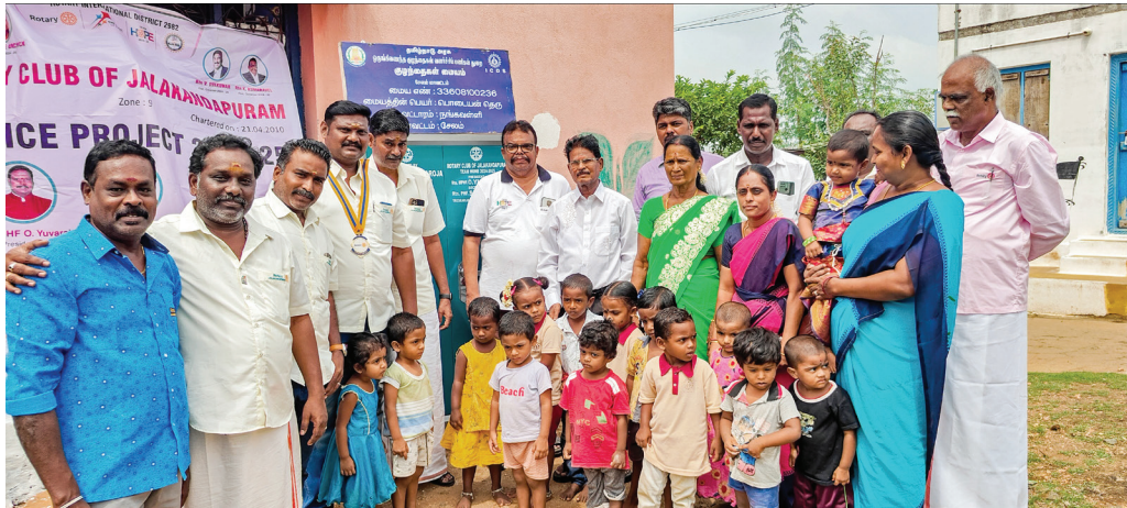
Rotarians with children and teachers at the anganwadi school.

A ceiling fan and bureau cabinets, both worth ₹17,000, were donated to an anganwadi school by RC Jalakandapuram, RID 2982, with