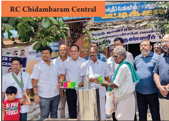
RC Chidambaram Central