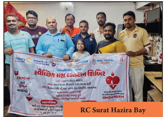
RC Surat Hazira Bay