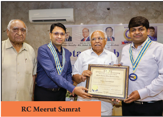
RC Meerut Samrat