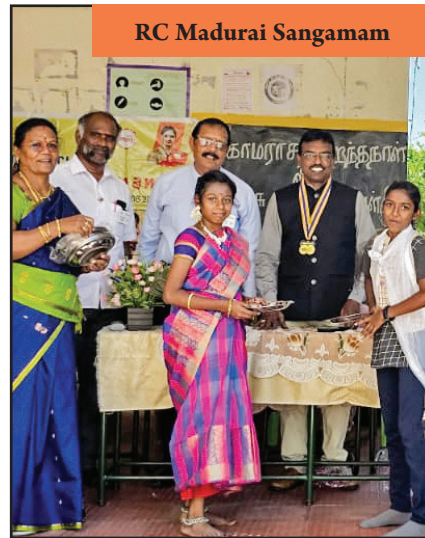
RC Madurai Sangamam