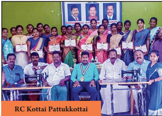
RC Kottai Pattukkottai