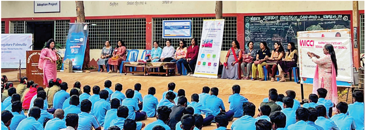
Students at an awareness session in a government school.

An awareness session on cybersecurity and prevention of sexual harassment was conducted for 350 children and 15 teachers at a government school in Doddanekundi by RC Bangalore Koramangala, RID 3191.