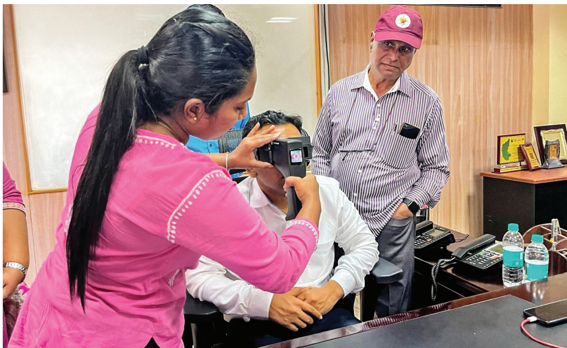
Paramedics being trained on handling the screening device by a technical team.