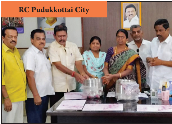
RC Pudukkottai City