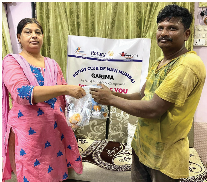
A club member handing over a food kit to a construction worker.

R C Navi Mumbai Garima, RID 3142, distributed food kits to 80 children at Bal Kalyan Nagri Mankhurd and 10 construction workers from Vashi, Mumbai. This project was done in association with the Chetana Foundation. Club members also celebrated Doctors' Day with the staff of PKC Hospital. ■