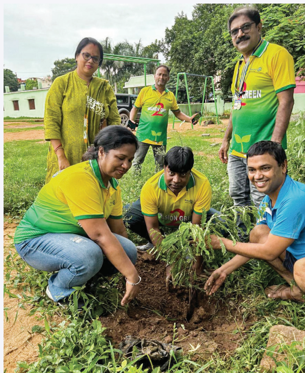
Club members planting a sapling.