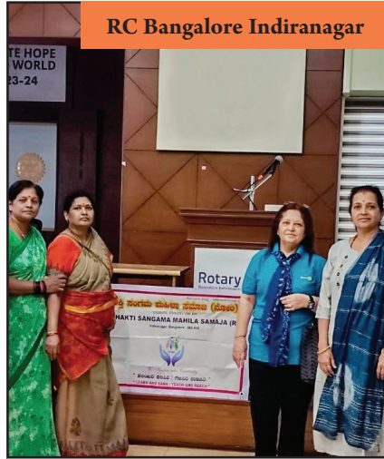
RC Bangalore Indiranagar