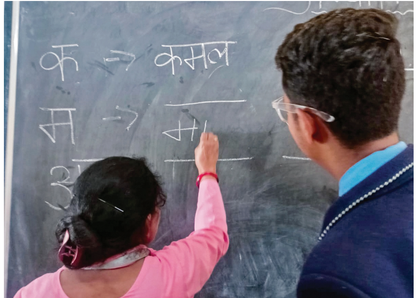
An Interactor teaches a woman to write.

The Interactors of St Joseph's College are actively participating in teaching adult illiterates and school dropout children. ■