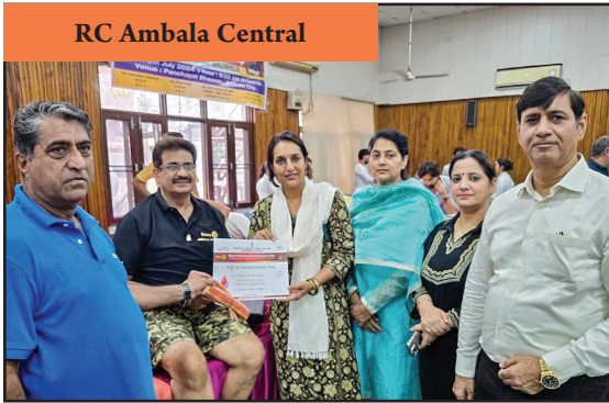
RC Ambala Central