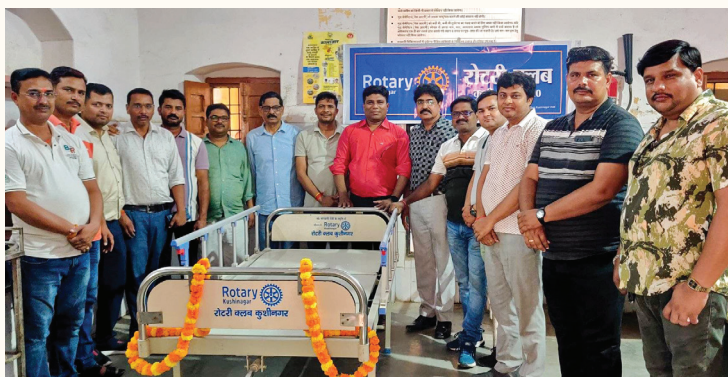
From top: Patients at the medical camp; Club members along with the medical team after the camp; Members of the club at the Community Health Centre in Kasia.