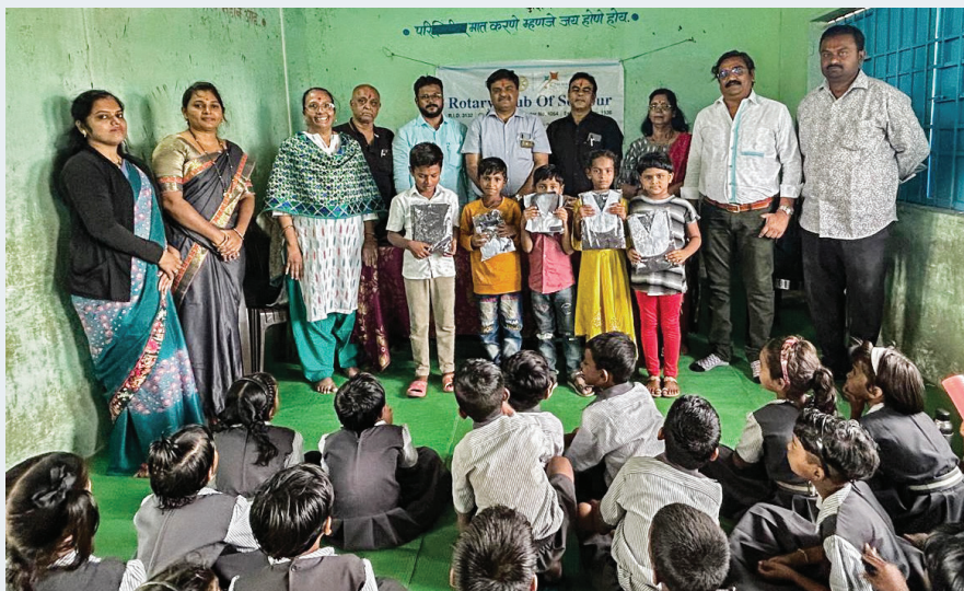
Schoolchildren hold new uniforms along with Rotarians.

S chool uniforms were distributed by RC Solapur, RID 3132, to 155 students at Gajanan Vidyalaya, a government primary school which has children from the low-income groups and nomadic families living in and around the town.