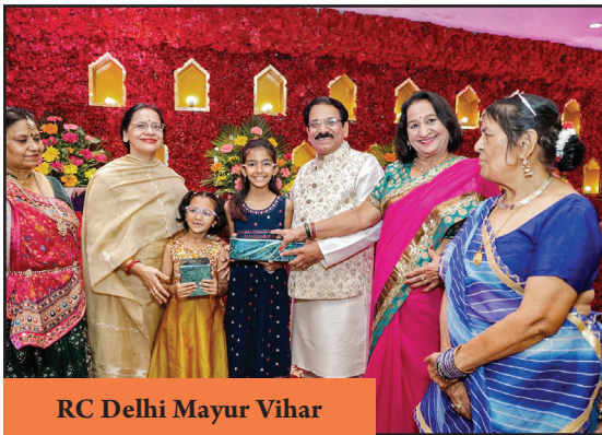
RC Delhi Mayur Vihar