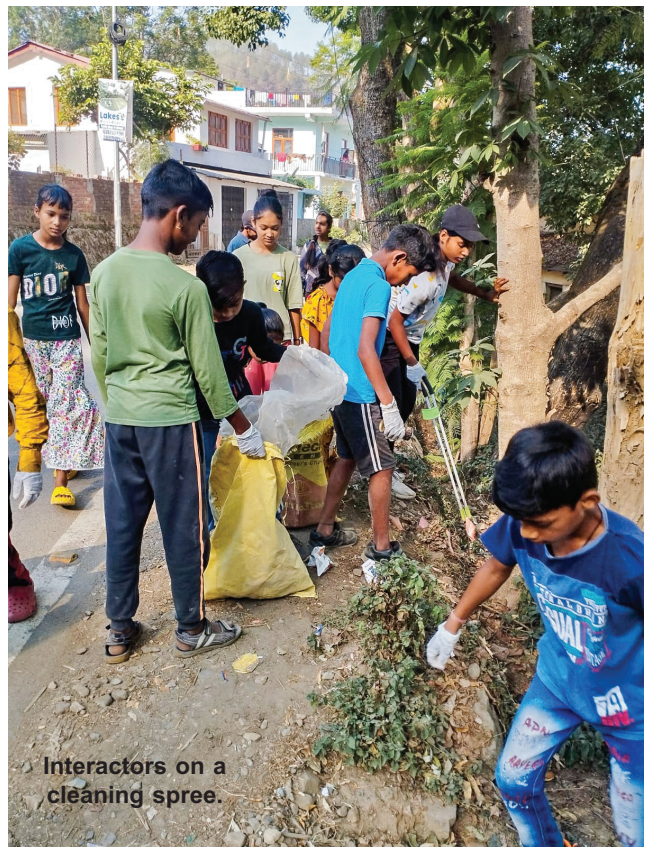
Interactors on a cleaning spree.