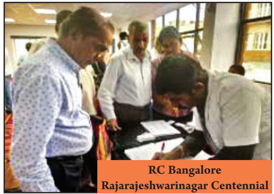
RC Bangalore Rajarajeshwarinagar Centennial