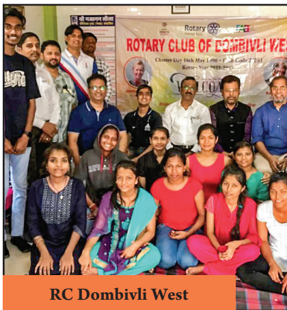
RC Dombivli West