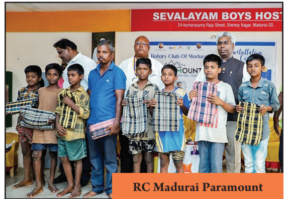
RC Madurai Paramount