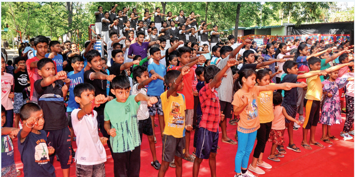
Children learning self-defence techniques at the workshop.