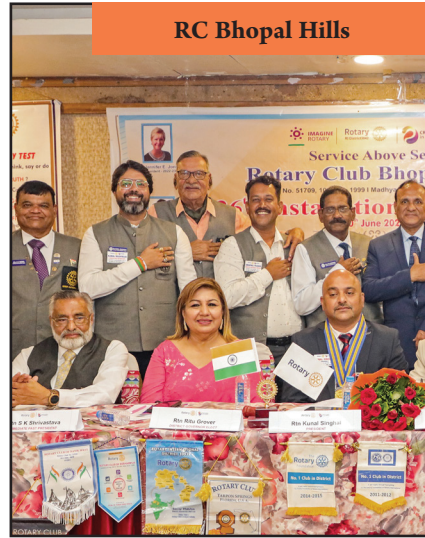
RC Bhopal Hills