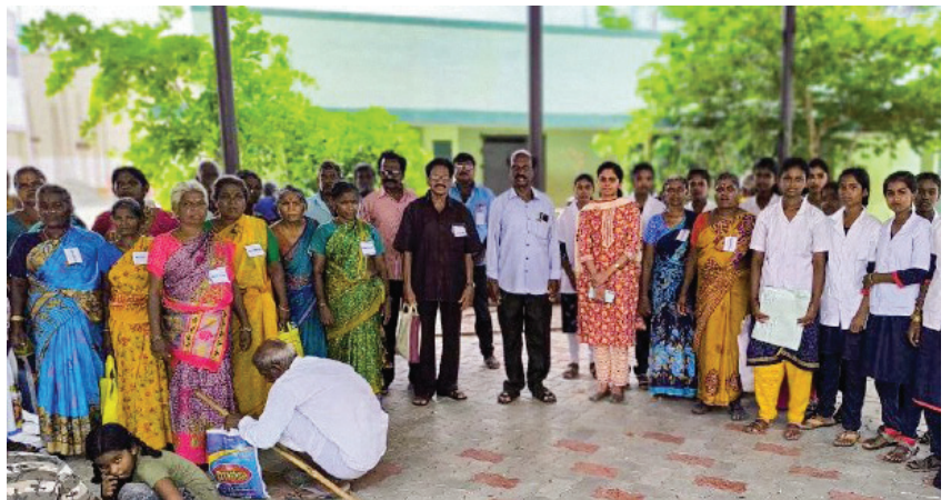
Rotarians with the registrants at the eye check-up camp.

Over 200 people attended the camp and 122 people were identified for cataract surgery. The club provides food for all individuals attending the camp. ■