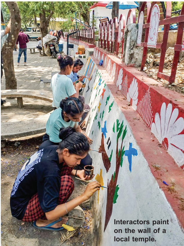
Interactors paint on the wall of a local temple.