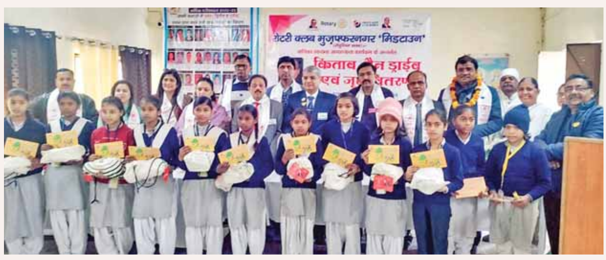
Rotarians, along with students, after distributing notebooks, shoes and stationery kits.

he classroom at the Swami Kalyan Dev SD Inter College, Shukratal, in Muzaffarnagar, was filled with joy as RC Muzaffarnagar Midtown, RID 3100, distributed notebooks, shoes and stationery kits to students, alongside a hygiene awareness programme