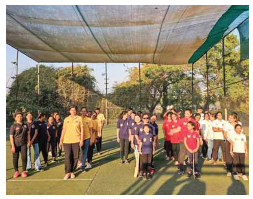
All the five Anns cricket teams of RC Panvel Central.