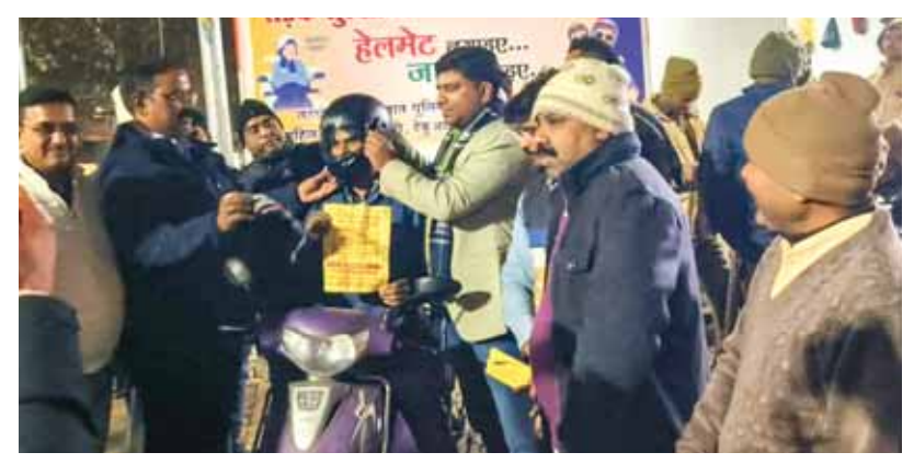
Rotarians help a two-wheeler rider wear a helmet as part of the club's road safety campaign.

As part of their environment care endeavour, the Rotarians distributed cloth bags with Rotary logo imprinted on them to roadside vendors and buyers. They encouraged the use of cloth bags and discard use of plastic bags in the interest of the environment.