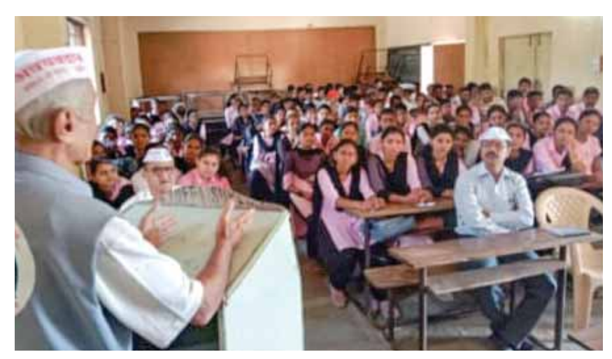
An awareness session in progress at a school.

Venugopal on Feb 4 and it passed through the other participating locations over 10 days. Avtar Singh Panfair was the project convenor. Seminars educating the public about organ/body donation was held in various locations.