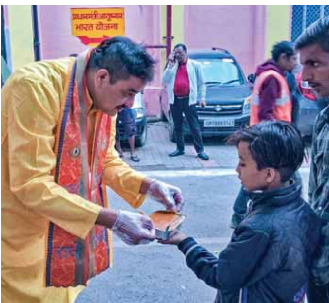
From top: Food being distributed as part of Project Annapoorna.