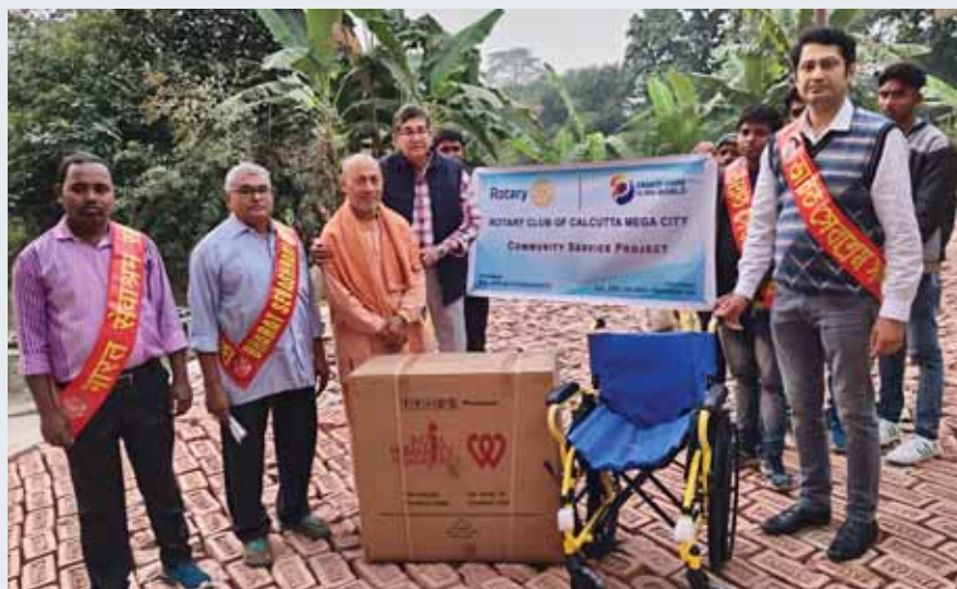
Wheelchairs being donated to Bharat Sevashram Sangha by club office-bearers.

In a noble gesture, RC Calcutta Megacity, RID 3291, has donated 20 wheelchairs to Bharat Sevashram Sangha at Ballygunge to help disabled people visiting the Gangasagar Mela.