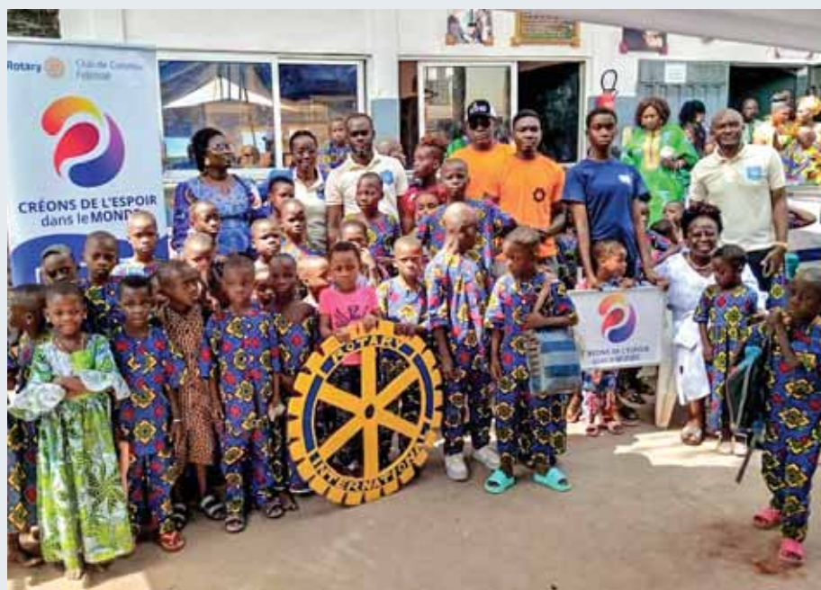
Beneficiary children with members of the African Rotary club.

R otary Club of Visakhapatnam, RID 3020, transferred 52,000 XOF (West African Franc, equivalent to ₹8,000) to RC de Cotonou Fidjorosse in the West African country Benin. The funds were utilised by the foreign club to provide groceries to an orphanage and Christmas gifts to around 50 children residing there.