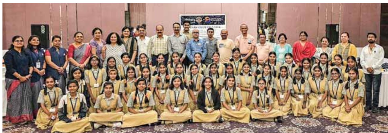
Rotarians along with the students of Janata Vidyalaya at the Hotel BLVD.

Eighty girl students of the Janata Vidyalaya, a high school in Nashik, enjoyed a fun-filled day on Feb 28 when the Rotary Club of Nasik, RID 3030, and Hotel BLVD hosted and entertained them with various programmes.