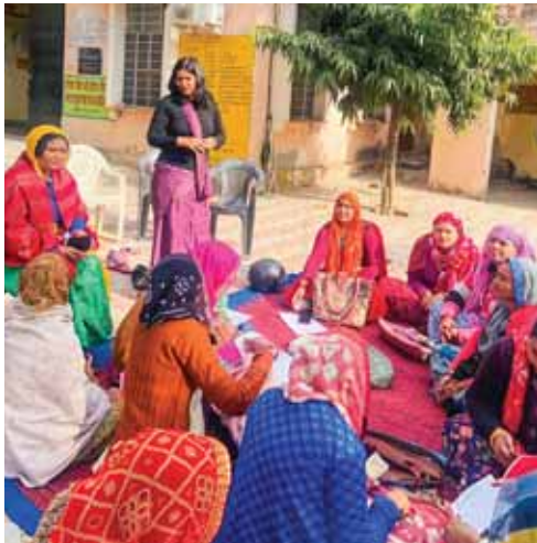
A meeting with the leaders of selfhelp groups in Nevta village.