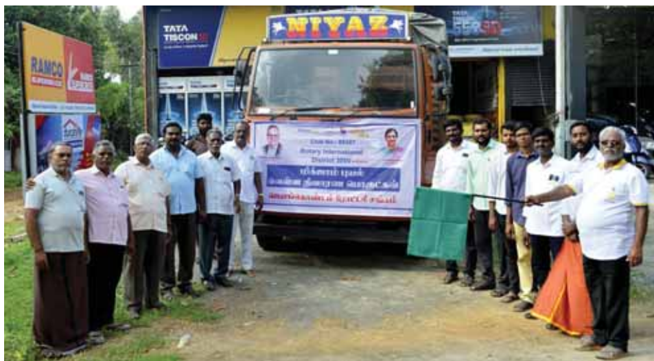
Truck with cyclone relief material being flagged off in the presence of club office-bearers.

A truckload of flood relief material including clothes, groceries, medicines, water bottles, toiletries and other daily essentials was despatched by RC Jayankondam, RID 3000, for the flood-hit people of Chennai and nearby districts of Kancheepuram, Chengalpattu and Thiruvallur. It may be noted that Cyclone Michaung had flooded many areas in Chennai and its extended aeras in December, affecting life and livelihood of thousands of people.