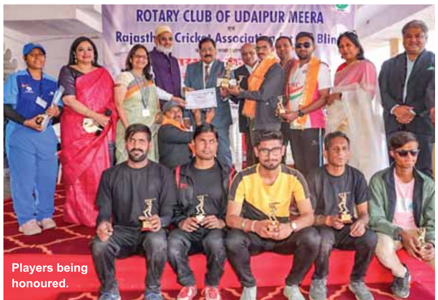
Players being honoured.