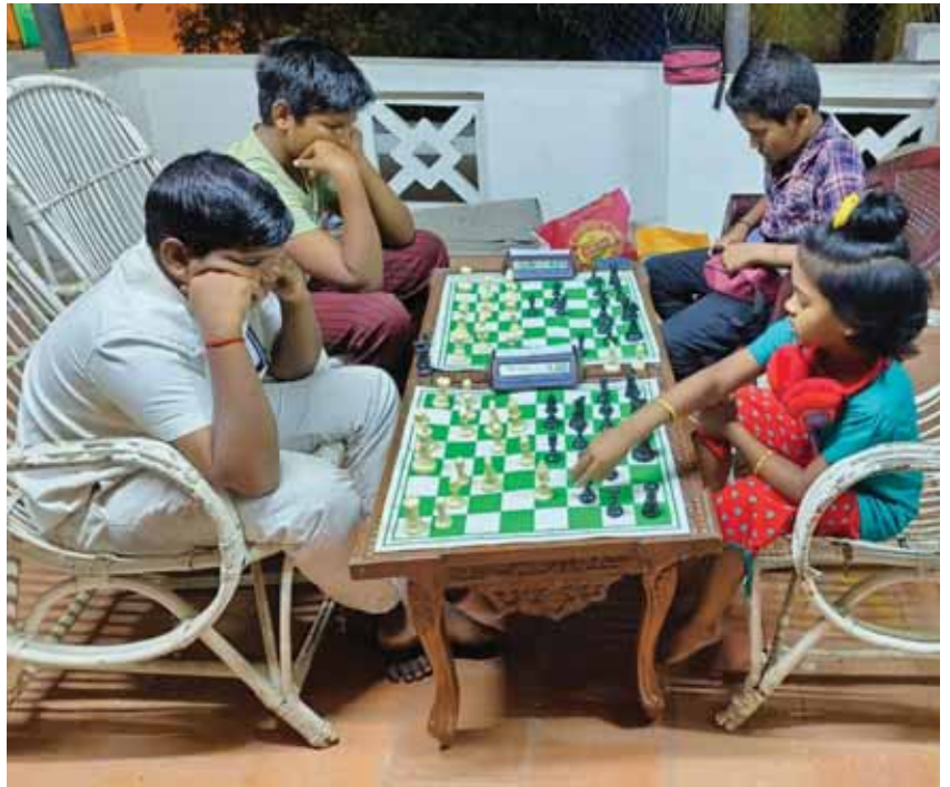
Children learn chess in one of the centres organised by RC Nagapattinam.