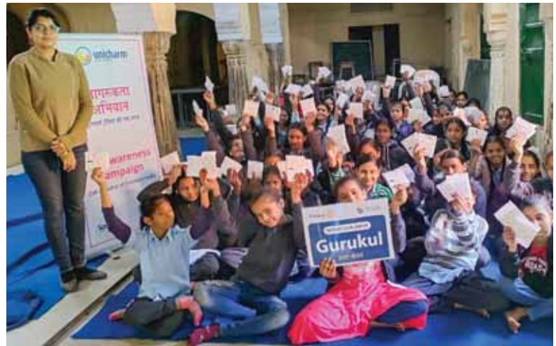
Girl students after a menstrual hygiene session at a school.

Left: Teachers and students with the educational tools given to the school by RC Jaipur Gurukul.