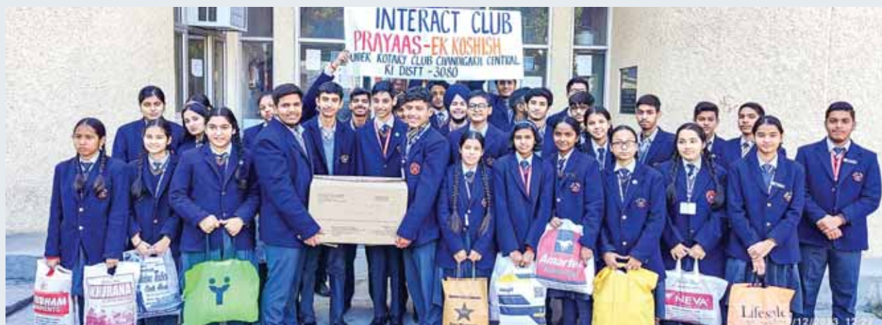
Interactors with gifts for senior citizens in front of an old age home.

T he members of Interact Club Prayaas-Ek Koshish, of the Blue Bird High School, Panchkula, visited an old age