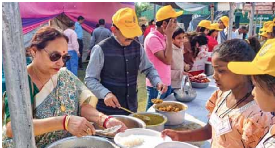
Rotarians, Anns and Interactors serve lunch to the children.