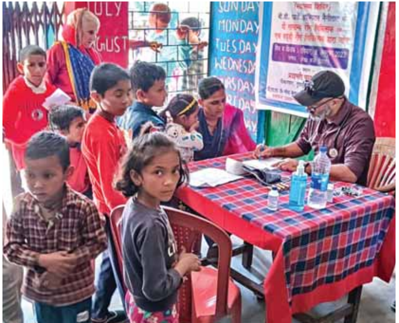
Above: A health check-up camp at a primary school.

Four amputees were taken by ambulance to a hospital in Ghaziabad for fitting them with prosthetic limbs. "The measurements for the patients were taken at the hospital and they will be fitted with artificial limbs free of cost," said Limba. During the cervical cancer vaccination drive, 10 girls were inoculated at the BD Pande