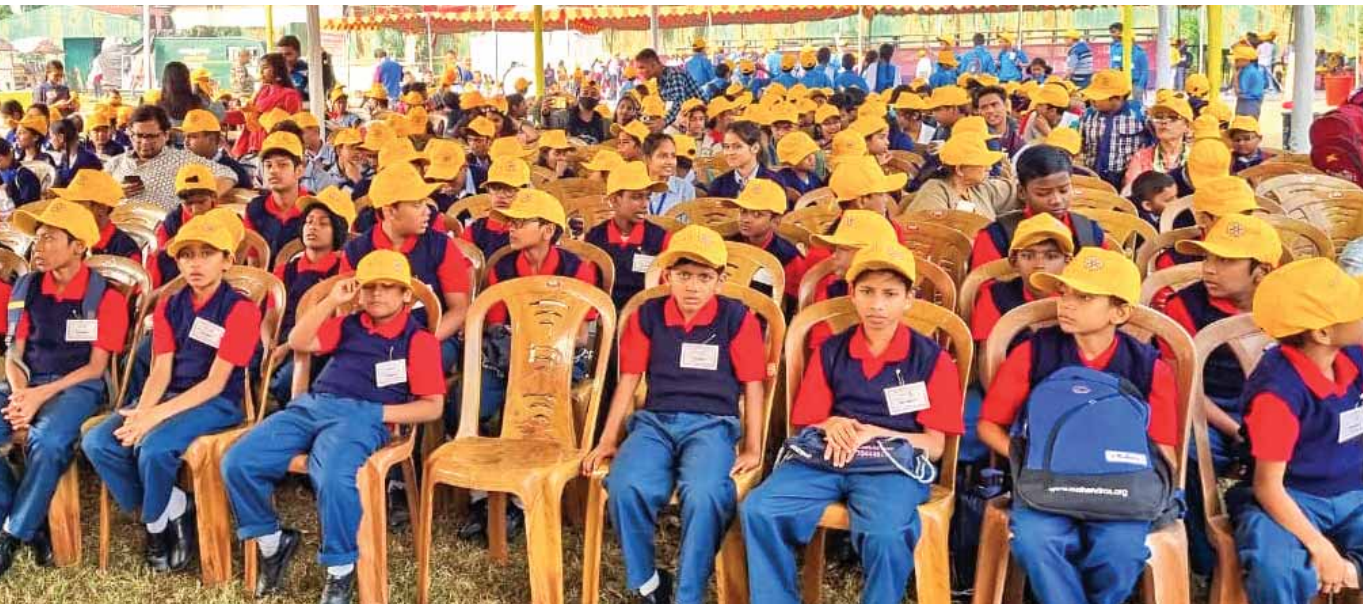
Children at the Annual Children's Treat.