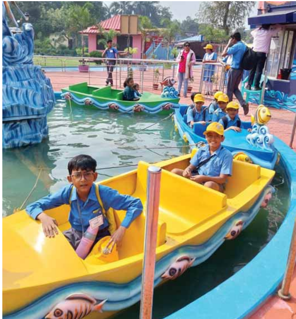
Children enjoy a joy ride at the Nicco Park.