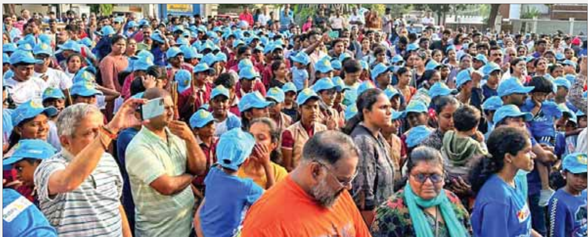
Participants at the Kidathon event.