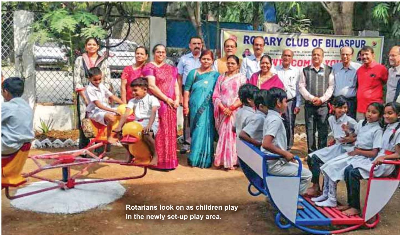
Rotarians look on as children play in the newly set-up play area.