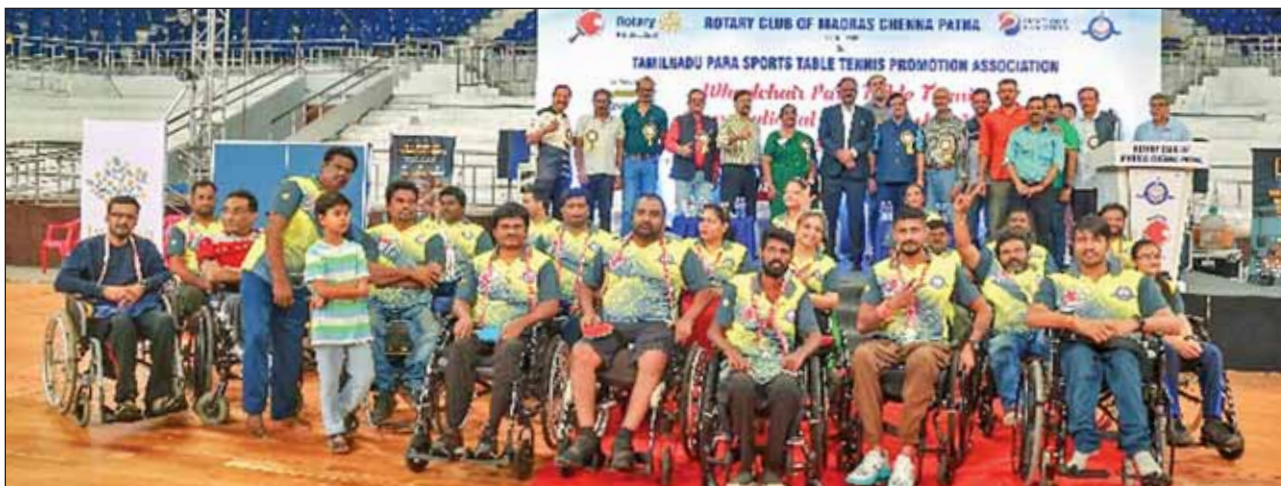
Participants, along with Rotarians, at the National Para Wheelchair Table Tennis Tournament in Chennai.