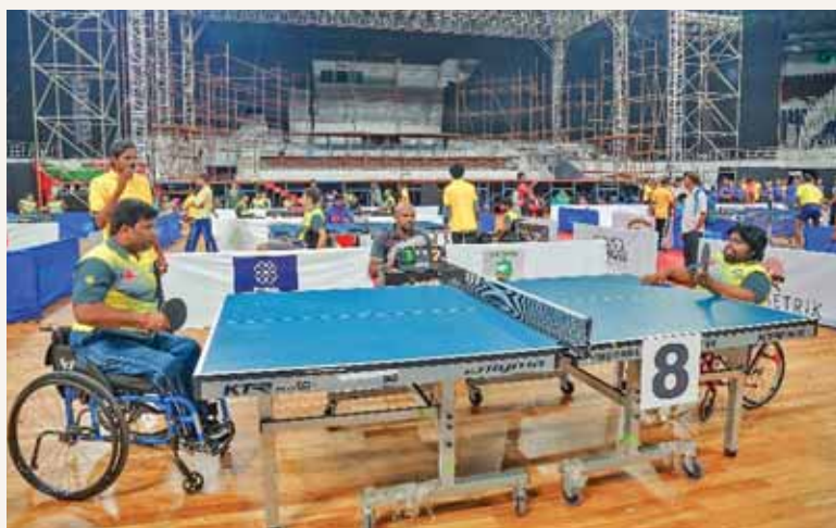
Two participants competing at the tournament.

O n World Disability Day, RC Madras Chenna Patna, RID 3232, organised the second edition of the Rotary National Para Wheelchair Table Tennis Tournament at the Jawaharlal Nehru Indoor Stadium in Chennai. In collaboration with the Tamil Nadu Wheelchair Table Tennis Association, the event welcomed close to 30 wheelchair-bound players nationwide.