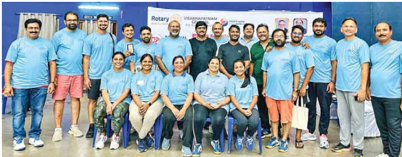
Participants of the tennis tournament.

F orty Rotarians from various Rotary clubs of Visakhapatnam participated under various categories in the Rotary Badminton League conducted by RC Visakhapatnam Central, RID 3020, in the city.