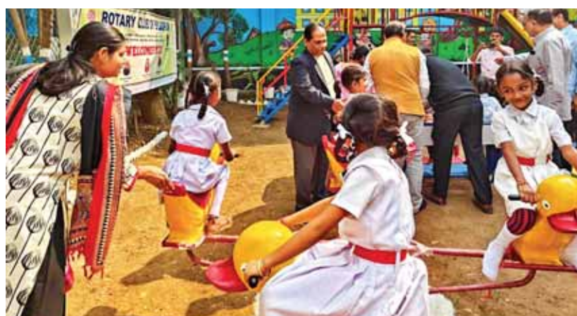
Children enjoying a ride.

in a child's development and aims to provide a safe and enjoyable space for learning and growth. The success of this heartwarming project is due to the collaborative efforts of the club and the generous support from individual donors. "This initiative not only beautifies the school ground but is also