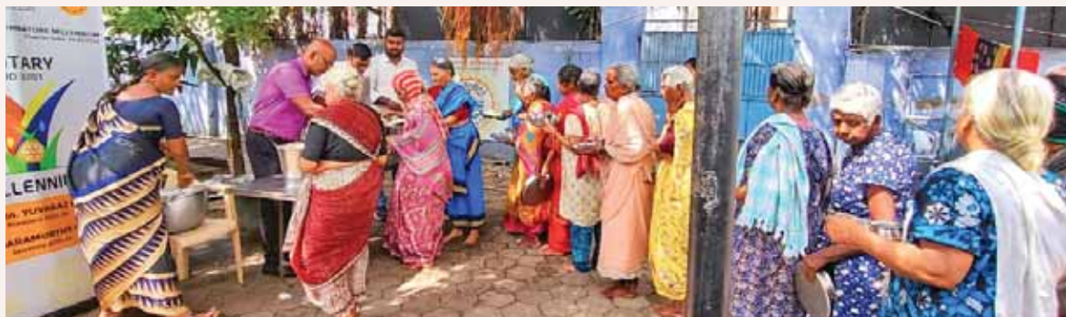
Cooked food being served to residents at an old age home.