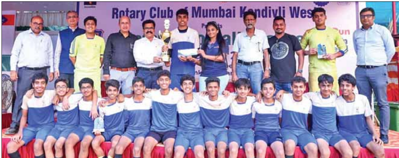
Students along with Rotarians at the prize distribution event of the Rotary Football League. Bottom: Rotarians at the blood donation camp.