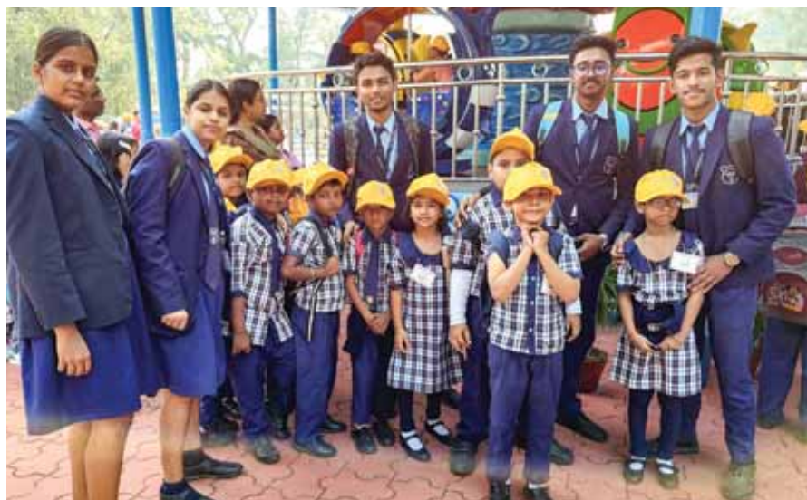
Interactors with a group of children.

This year Rotarians and Interactors gathered at the Rotary Sadan, where 30 buses were sent to various schools and institutions across Kolkata. The buses picked up around 1,500 children, many of whom were orphans and special children, to transport them to Nicco Park for a day filled with fun.