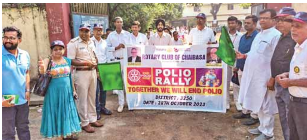
An End Polio rally being flagged off in Jamshedpur.

An online seminar on End Polio Now hosted by RC Jamshedpur Mid Town, RID 3250, to mark World Polio Day saw the participation of 500 Rotarians from across the four zones in India.