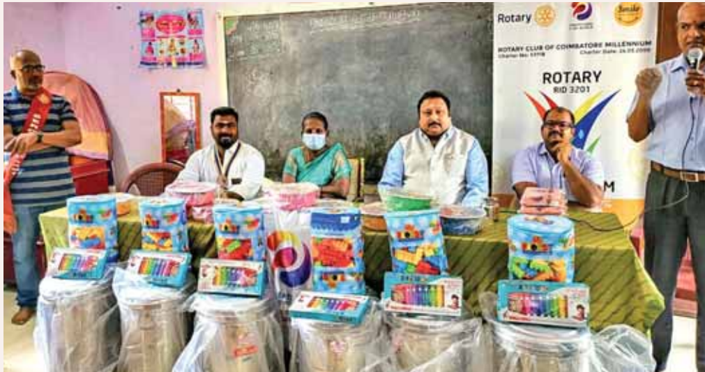
Club members at an anganwadi after donating utensils and toys.