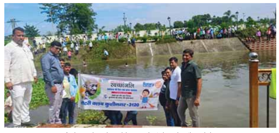
A river cleaning drive undertaken by the club.

observed as National Unity Day, the club organised a blood donation camp where over 65 people participated, and the collected blood was given to the Kushinagar Charitable Blood Bank.