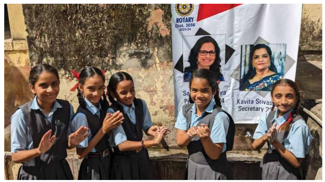
A group of students practise handwash as demonstrated by the club.