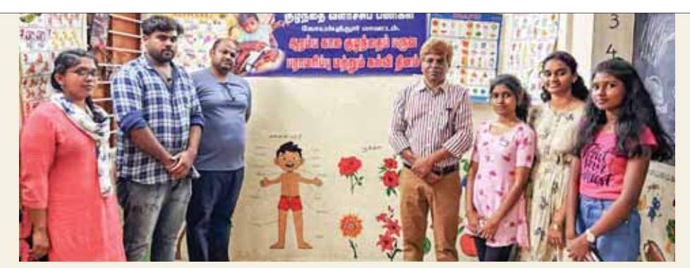
Rotarians and Rotaractors at the anganwadi.