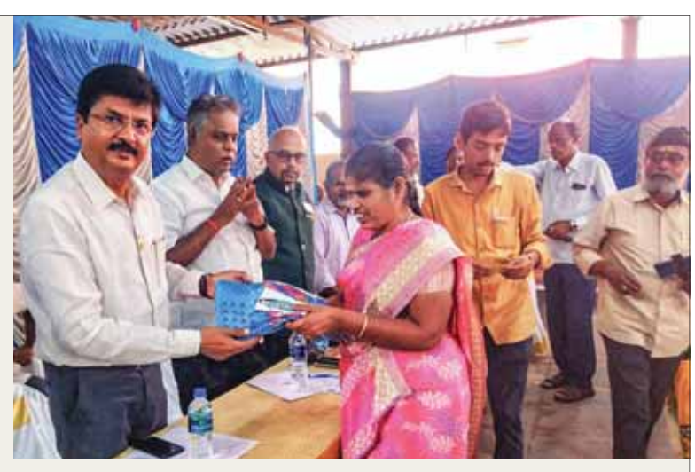
Diwali dresses being donated to a beneficiary.

round 300 students from 18 rural schools took part in a cricket tournament hosted by RC Coimbatore East, RID 3201, with the support of District Sports and Games Welfare Association at the TKS Matric HS School, Chinavedampatti.