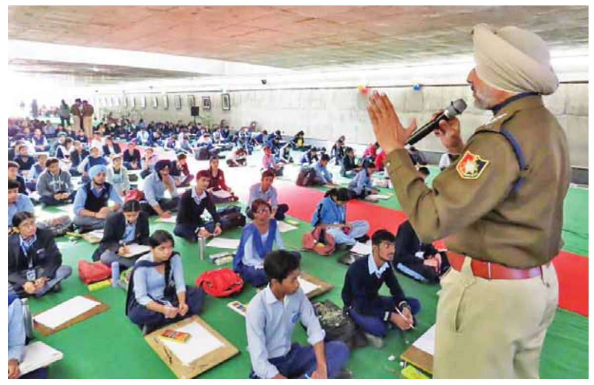
A police official addressing students at the painting contest.

ore than 200 students from 21 elite schools displayed their creative skills on canvas at the painting competition on road safety conducted by RC Chandigarh Midtown, RID 3080, at the Rose Garden as part of Police Week Celebrations.