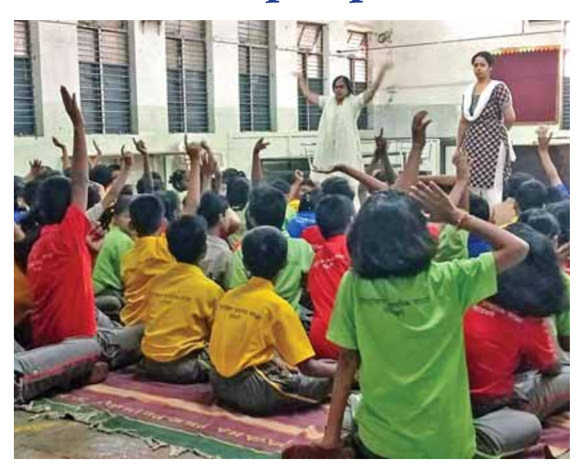
Students follow the instructions at one of the sessions.

To create awareness among students on mobile phone addiction, RC Pune Kothrud, RID 3131, with the support of Reflection Foundation organised a one-day workshop on 'Mobile addiction prevention' for students in the age group of 12–18 years from Chandrakant Darode and Shishuvihar Schools.