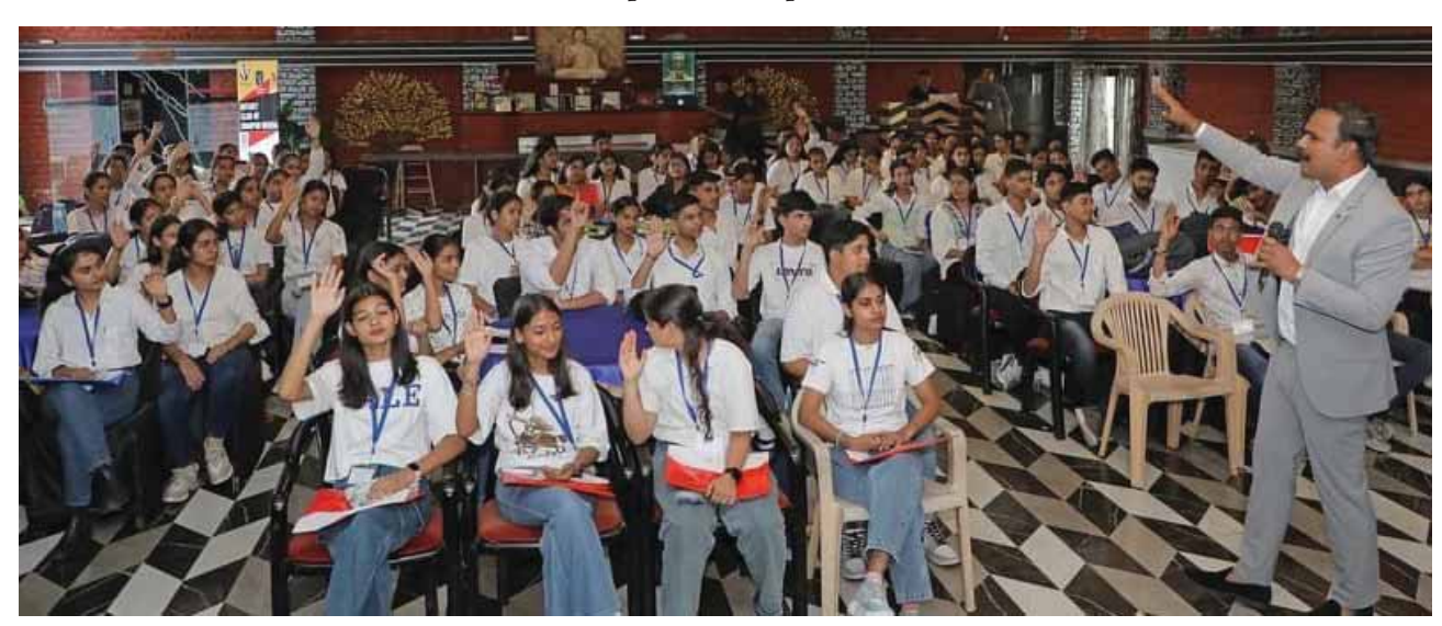
A session at the RYLA.

In another initiative, the club organised a RYLA for 90 participants from various educational institutions. The two-day residential programme taught the students various leadership and time management aspects, and all about teamwork and delegation. Zumba and meditation sessions were also part of the programme. The students took out a rally campaigning for a clean environment at the end of the RYLA.