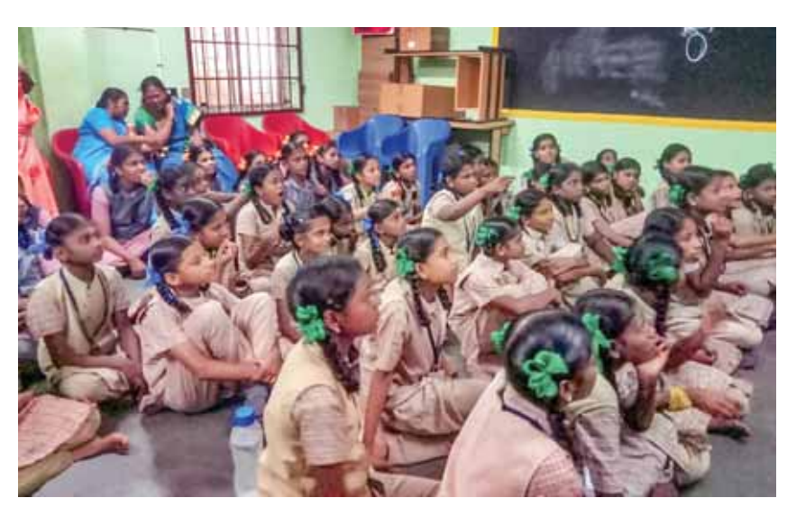
Students of the Government High School in Virakanoor village attending a RYLA workshop organised by the club.