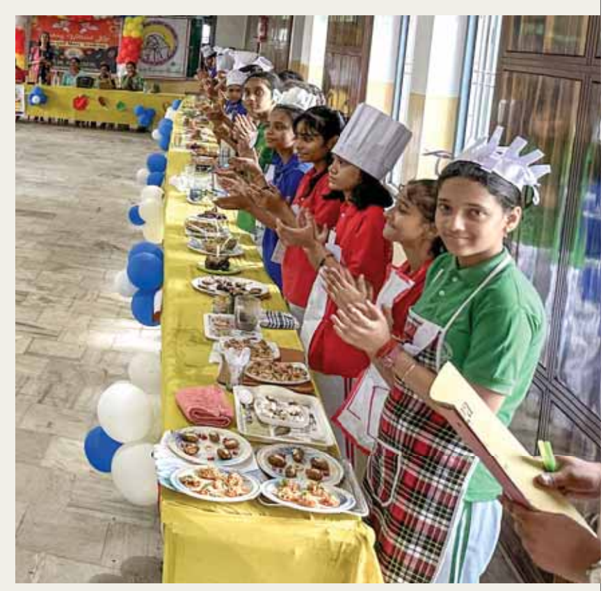
Young contestants dishing up healthy recipes.

During the event, three club members conducted training sessions on various topics to help the students receive valuable insight into making healthier dietary choices. Close to 80 students competed in the final round of the fireless cooking competition and prepared dishes that were nutritious.