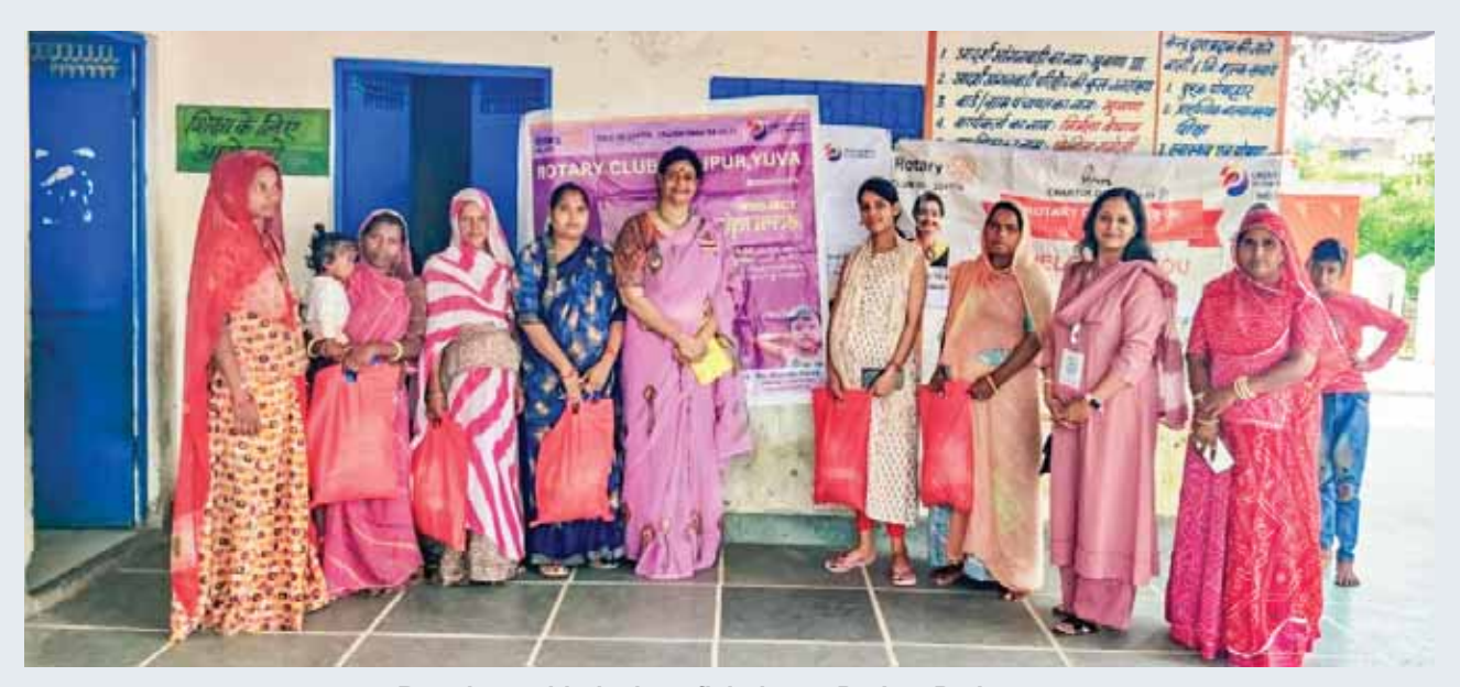
Rotarians with the beneficiaries at Project Paripurna.

The the aim to ensure the well-being of mothers and their infants, RC Yuva Udaipur, RID 3056, has distributed curated nutrition packages rich