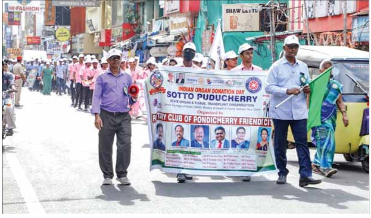
Club members leading the rally on organ donation awareness in Puducherry.

n a collaborative effort between SOTTO (State Organ and Tissue Transplantation Organisation)-Puducherry,