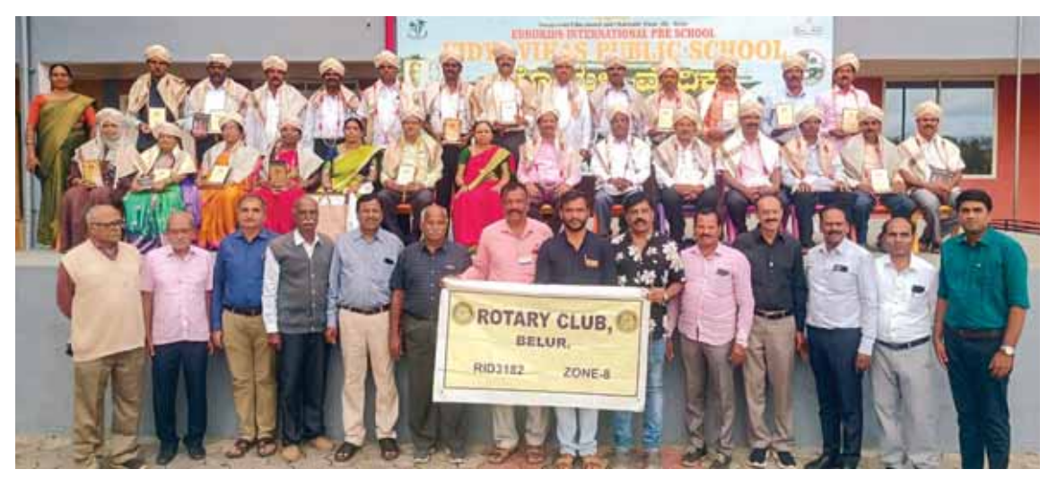
Club members, along with the retired teachers, after the felicitation ceremony.

RC Belur, RID 3182, has been honouring retired government school teachers in the region annually. Keeping up with