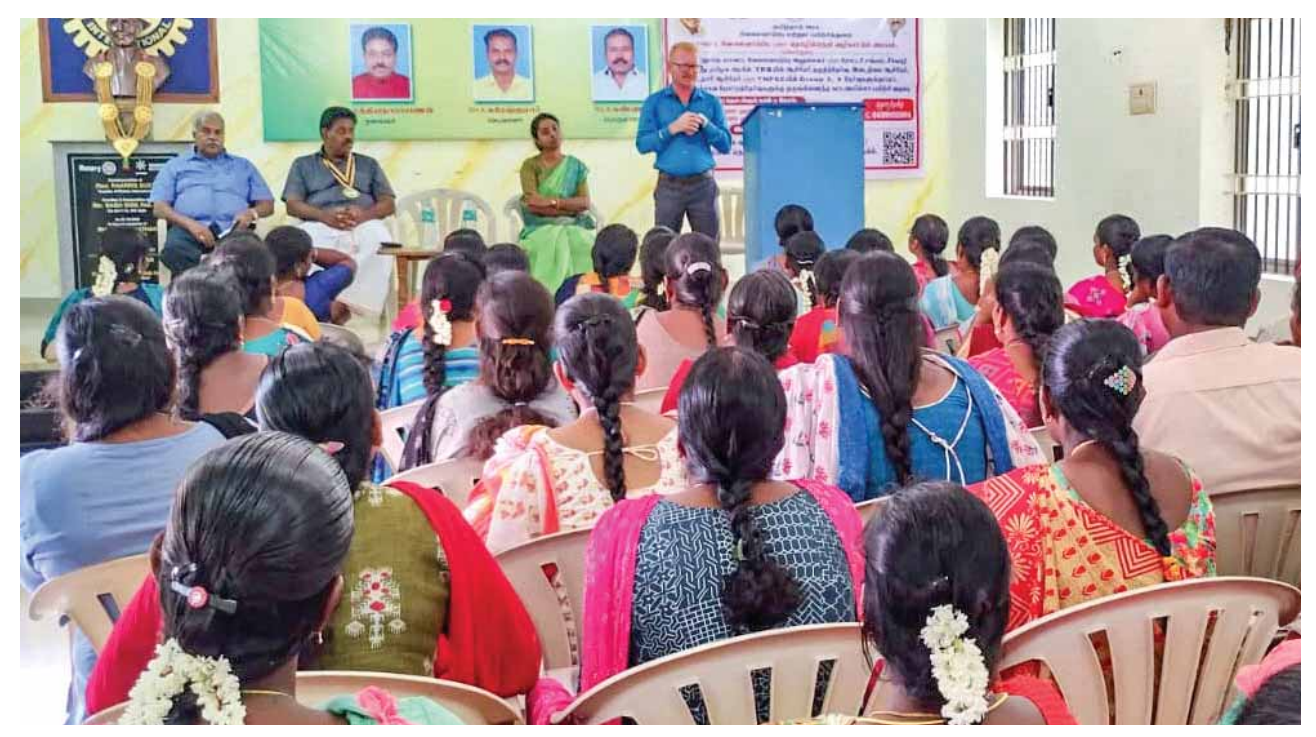
A career counselling session in progress.

classrooms. Saplings were planted on the school premises and the school building was given a fresh coat of paint.