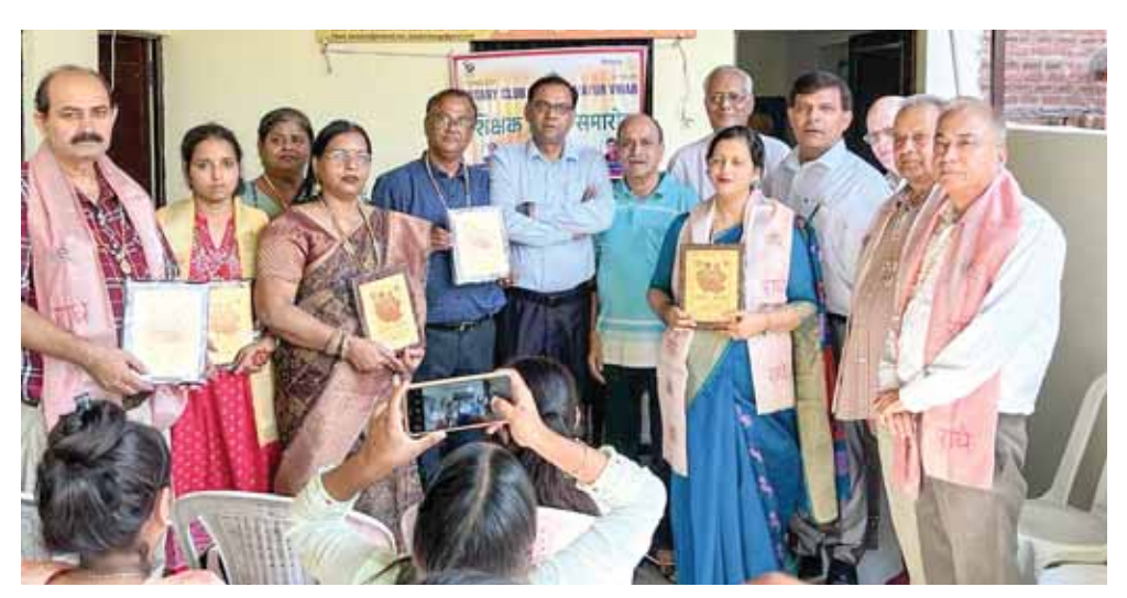
Coaching centre staff with the mementoes they were honoured with by RC Delhi Mayur Vihar.

n Teacher's Day, Rotary Club of Delhi Mayur Vihar, RID 3012, honoured the staff at the coaching centre housed at the NGO Dastak in Mayur Vihar. Twenty-five students of Class 10 are being given extra classes at this centre. The club