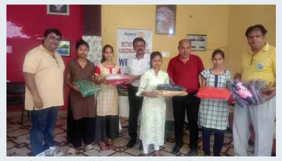
Orphaned girls with Rotarians at the Aanchal Trust, Jagjeetpur.

o enhance the skills of orphaned girls, RC Haridwar Central, RID 3080, distributed kurtis (a close fit tunic for women), paints, dupattas and 50 metres of cloth for inmates to practise sewing embroidery at the Aanchal Trust, Jagjeetpur village near Kankhal in Haridwar district of Uttarakhand.