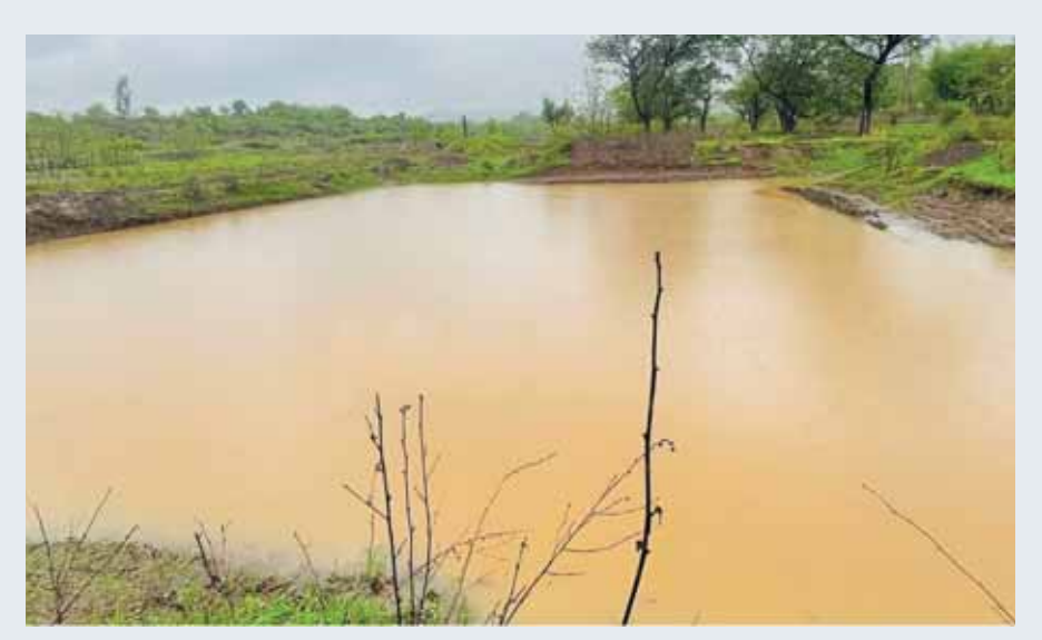
A barren land was converted into a pond.

barren land of 1,000-sq metre was excavated up to a depth of two metres for collecting rainwater in a successful rainwater harvesting project by RC Patalganga, RID 3131.