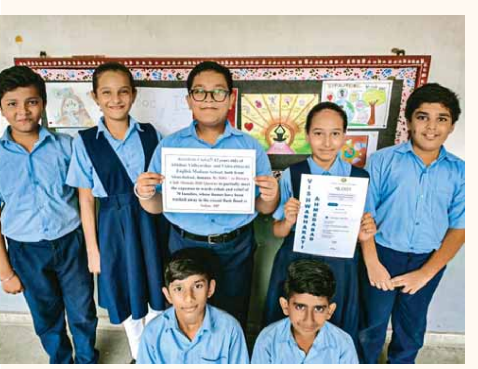
Rotakids hold the info sheets on their flood-relief work.

virtual reality technology will also be conducted for students this year.