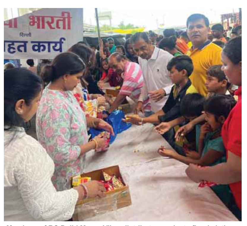
Members of RC Delhi Mayur Vihar distribute snacks to flood victims.

In another initiative, the club members visited the District Jail and distributed dresses and sarees to the women prisoners lodged there. Sanitary pads and stationery items were distributed to students at Dastak, an NGO in Trilokpuri, East Delhi.