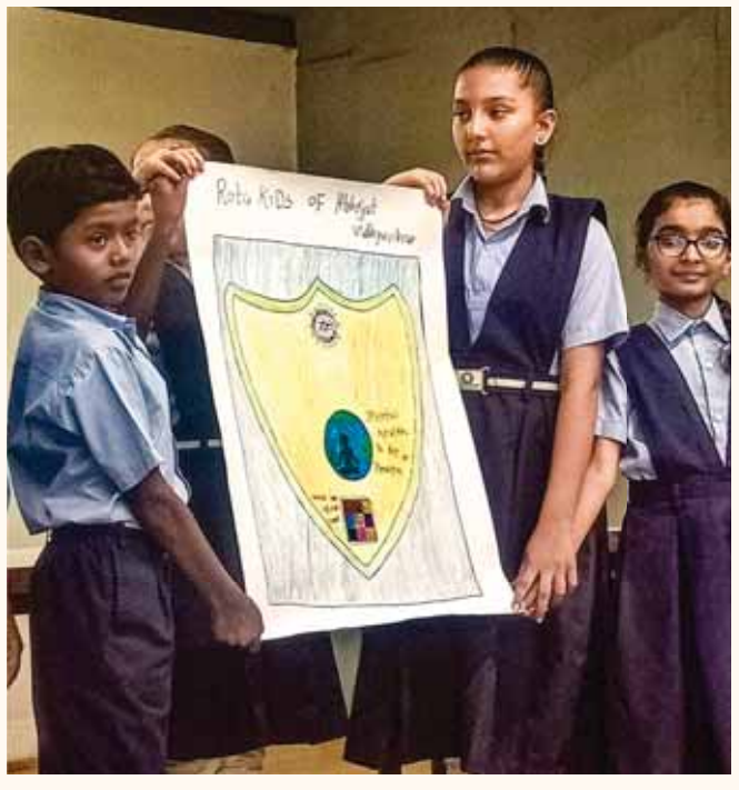
Above and left: Rotakids display their Coat of Arms designed by them.