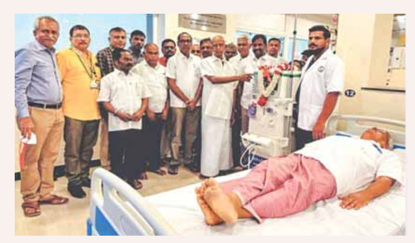
A new dialysis machine being inaugurated.