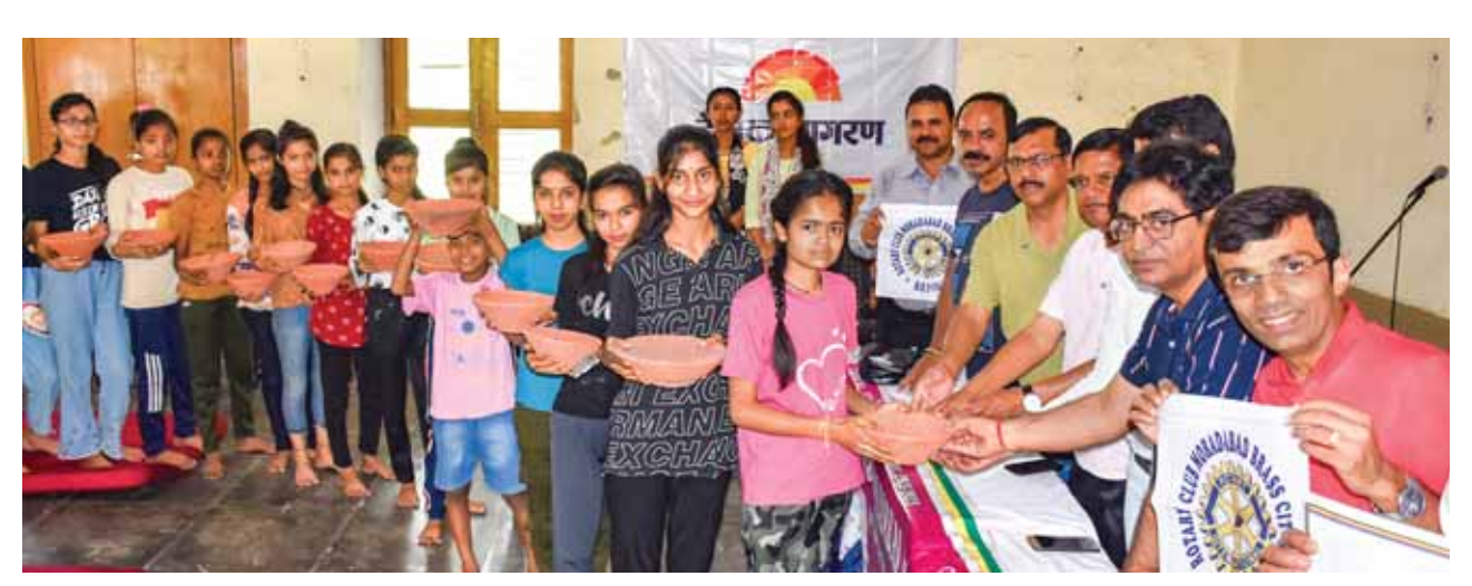
Rotarians distribute earthenware bowls to school students.

Members of the club participated in the campaign. \blacksquare