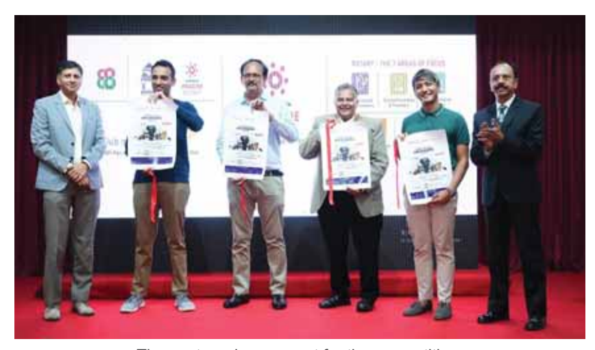
The poster release event for the competition.

C Bangalore, RID 3192, has launched an online competition called 'Voices of the Endangered (VOTE),' from June 5-18 to raise awareness about wildlife conservation in India.