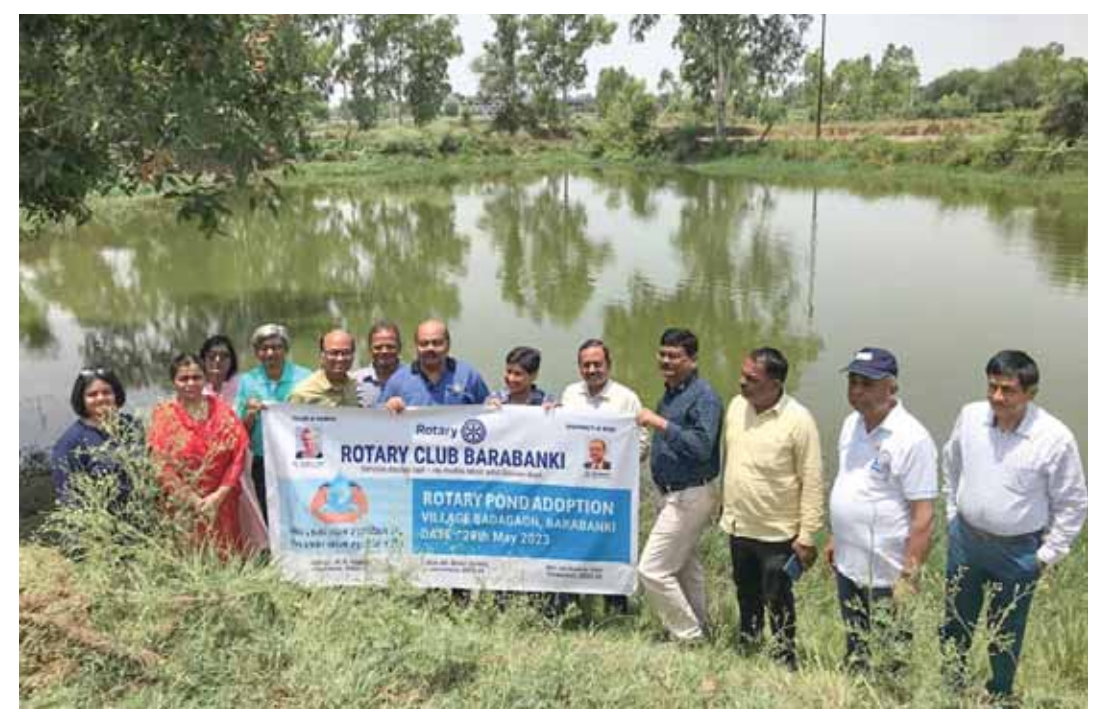
Members of RC Barabanki after cleaning the Piperi Talab pond.

Rotary Club of Barabanki, RID 3120, has adopted a pond named Piperi Talab in the town and the club members are directing their efforts to maintain it as an ongoing