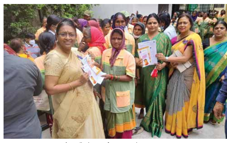
A medical camp for women in progress.

Last year 30 medical camps were conducted at the PHCs, the Karnataka State Reserve Police and at eight units of Texport Industries, a garment factory. Primary scanning,