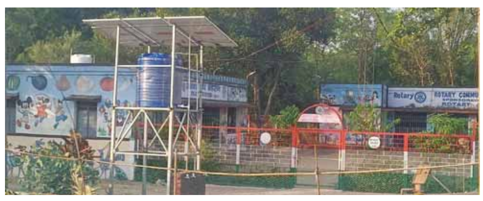
A solar water tower installed at Ulgora village near Bokaro.

Classes 7 to 12. These students have actively participated in various state and national-level competitions. A homeopathy clinic has been established in the village, providing free services twice a week by club member Dr PC Mahto.