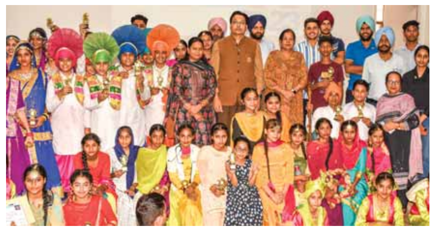
Rotarians along with the RYLA participants.

"RYLA serves as a platform for youth to develop essential leadership skills, enhance their personal growth, and cultivate a strong sense of community service. Through engaging activities and workshops, RYLA empowers young individuals to become confident leaders who can make a positive impact in their communities," explains Singla.