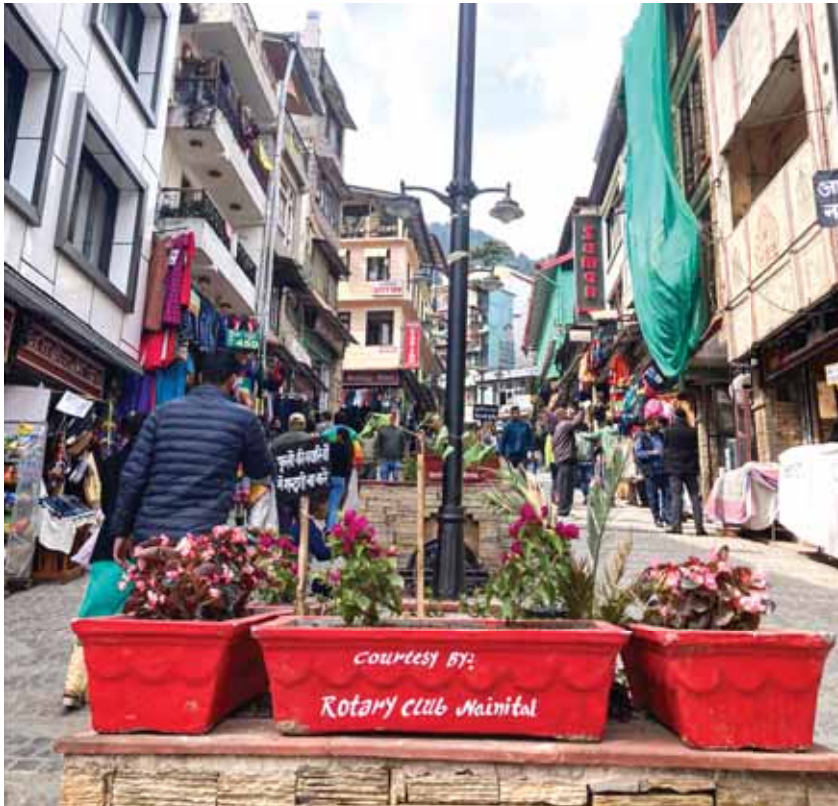
Ornamental planters sporting the club's name installed at a public space in Nainital.

Rotary Club of Nainital has been actively supporting the community with various service projects including a health check-up camp, cleanliness drive, and bicycles and wheelchairs distribution.