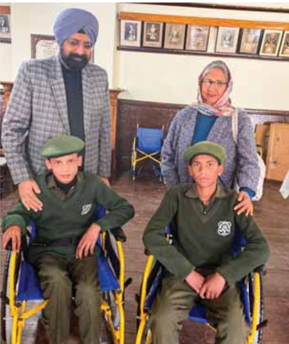
Beneficiaries on the wheelchairs donated by the club.

of the club-sponsored Interact Club of Nainital Naukuchiatal. These students come to school from far-off villages which do not have connectivity to their school.