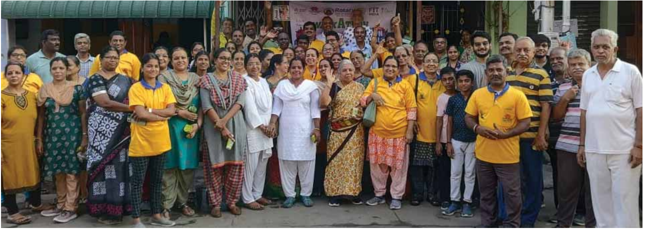
Participants of the walkathon in Srirangam.

R otary Club of Srirangam, RID 3000, observed World Hypertension Day (May 17) by organising a walkathon in the town. An awareness talk on managing hypertension and diabetes, and following