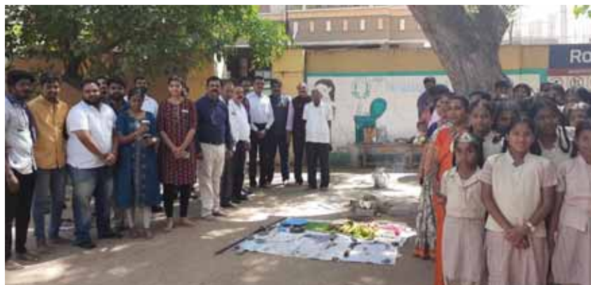
Members of RC Coimbatore Vadavalli and students after the bhoomi puja on the school campus.

The club plans to construct a dining hall and a covered bicycle