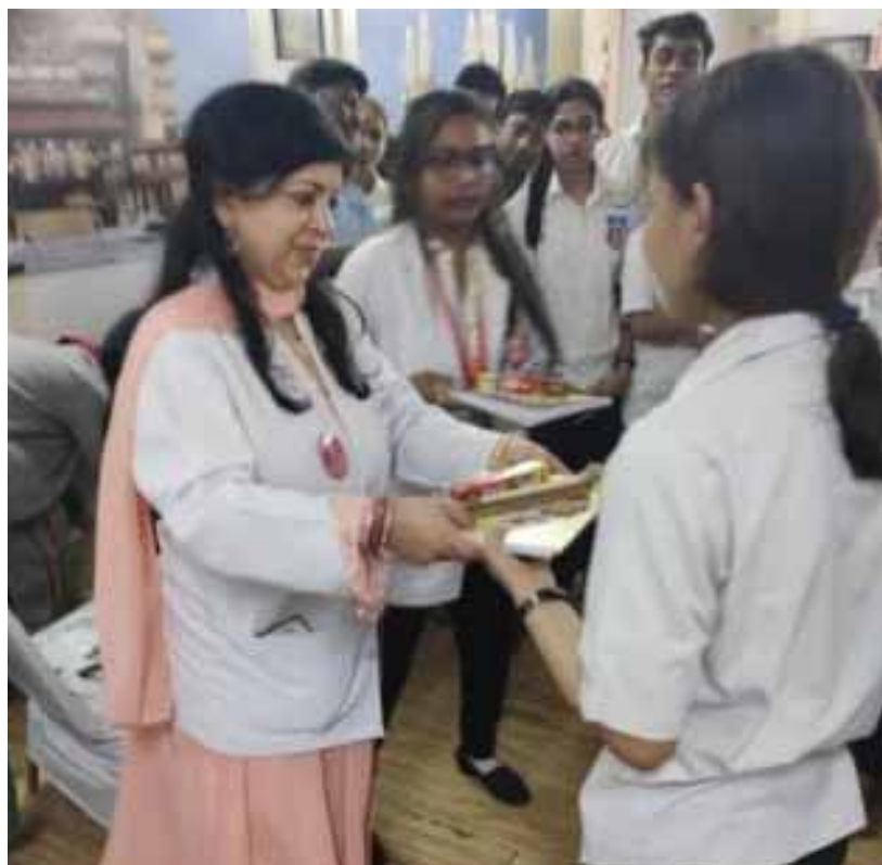
A hearing camp in progress at the Rukminidevi Dwarkadhish temple in Dwarka.

A round 40 patients were diagnosed with hearing loss and 16 with speech, voice difficulties among the 117 people who had registered at the free hearing and ear-screening camp at the Sri Rukminidevi Dwarkadhish temple, Dwarka, hosted by RC Delhi Govinda, RID 3011, in partnership with Ramco Clinic, SGT University and ISKCON, Dwarka.