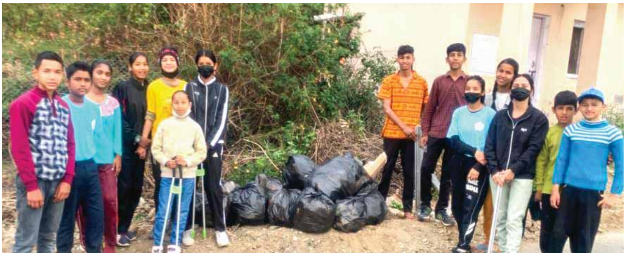
Interactors with bags of garbage collected from a cleaning activity.