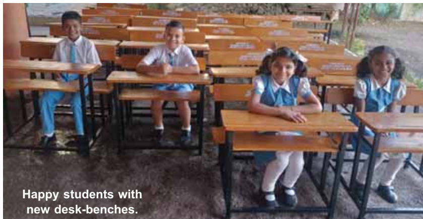
Happy students with new desk-benches.

The club has adopted 60 girls studying in Classes 8–10 and is paying their school fees. As there was no cement flooring, the students sat on the ground and they suffered various health issues like backache, illness due to sitting on the cotton mats during rainy season and difficult posture etc. Now, the club has donated 210 desk-benches for the primary section which will benefit 420 students each year.