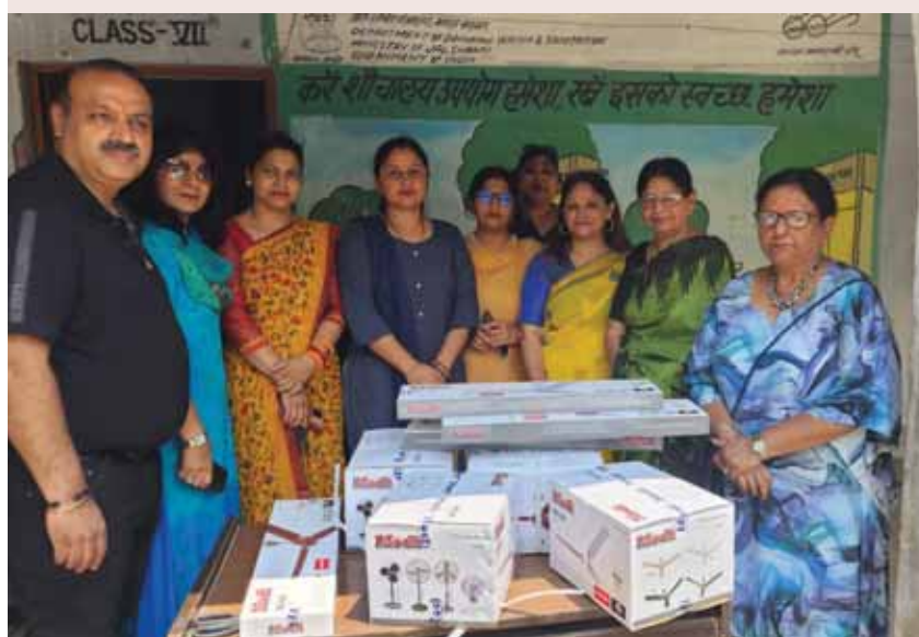
RC Kundli members with ceiling fans gifted by them to a government school.

R otary Club of Kundli, RID 3012, distributed uniforms to 384 students studying at the Government Girls’ Higher Secondary School in Nangal Kalan in Mansa district in Punjab. The club arranged for training in self-defence for the girls to give them courage and confidence to tackle stalking and eve-teasers. The club will soon be delivering 25 tablets to the school for facilitating e-learning for the students.