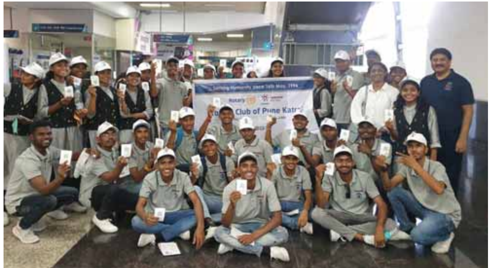
Tribal students from Gadchiroli district at the Garware College metro station.

On another occasion, 72 blind students from the Patashibai Ratanchand Manav Kalyan Trust in Bhosari, accompanied by eight teachers, were taken on a metro train from Phugewadi station to Pimpri Chinchwad Municipal Corporation station with four stops in between, and back. The children loved the