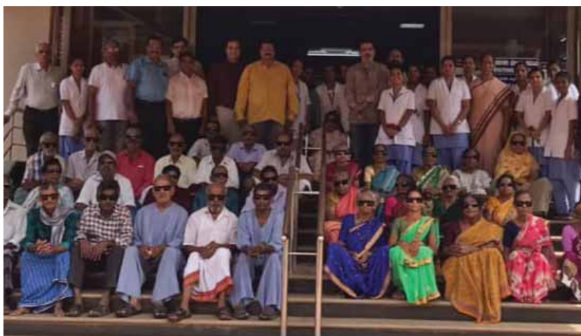
Beneficiaries after cataract surgery.

Twenty computers were installed at the Government First Grade Degree College in a joint project with Cognizant Technology Solutions and Deshpande Skilling