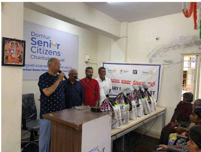
Rotarians at an MHM workshop for rural girls.

A menstrual health and hygiene management programme was organised by RC Bangalore East, RID 3190, at the Domlur Government High School for girls. Reusable sanitary napkins were distributed to 80 adolescent girls.