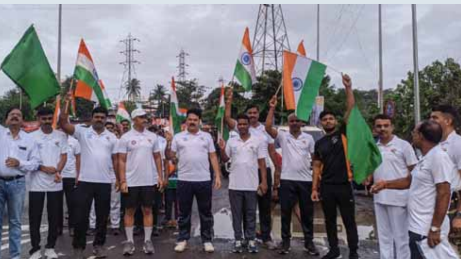
Rotarians celebrate Independence Day with police.

R otarians of RC Dombivli West, RID 3142, celebrated Independence Day by organising a variety of events. A 5-km marathon had the participation of 125 people, and a 15-day run was held for the police personnel. T-shirts were distributed for the participants.