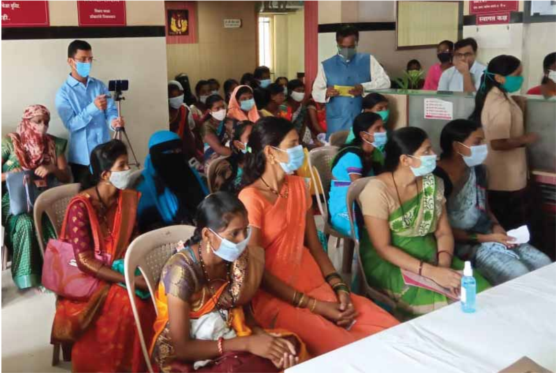
Pregnant women at the health check-up camp in Pusad.

From July to May in the last Rotary year (2021–22), 10 health check-up camps were organised by RC Pusad, RID 3030, benefitting around 500 pregnant women. The medical camps were held with the support of local administration and NGOs in Pusad.