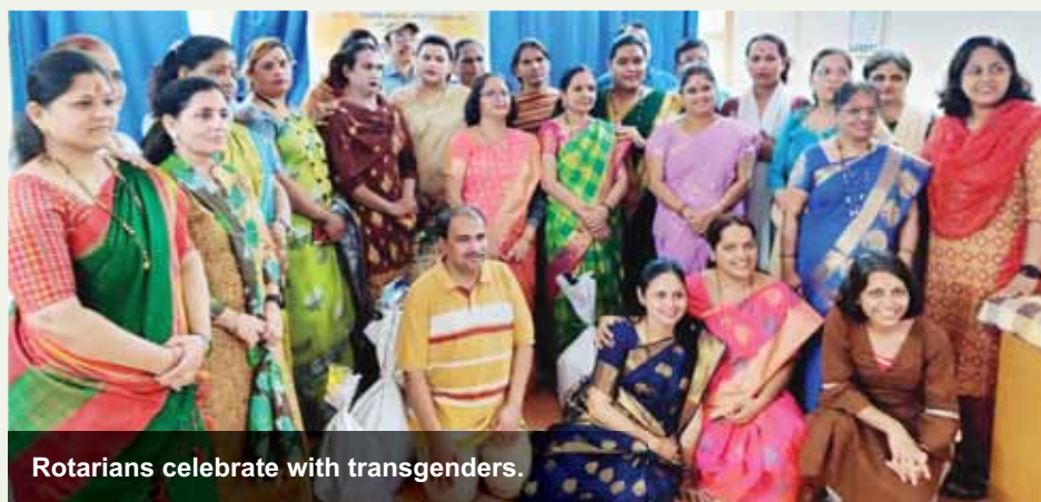
Rotarians celebrate with transgenders.

R otary Club of Dombivli Midtown, RID 3142, celebrated the Shravan Haldi Kumkum