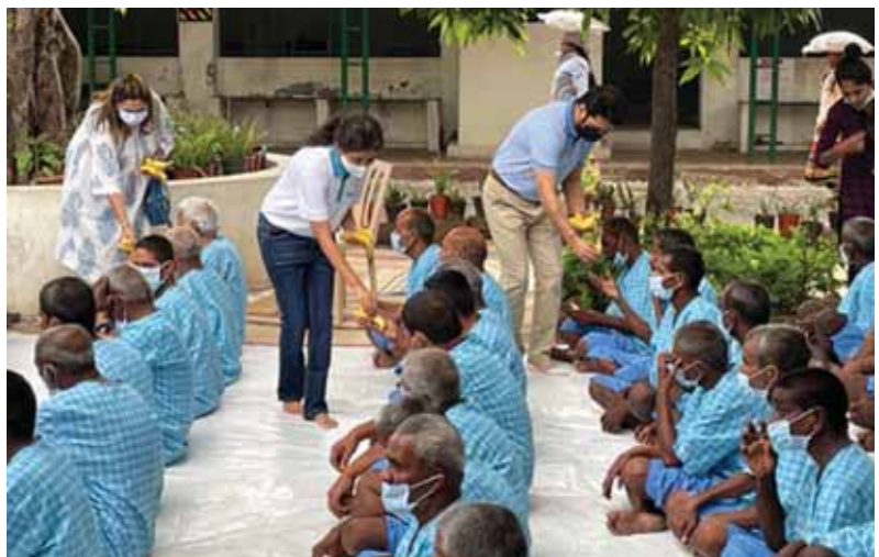
Club members distribute snacks to the inmates of the old age home.

Rotary Club of Madras Magnum (RCMM), RID 3232, organised a musical programme followed by dinner for the inmates of Daya Sadan, an old age home in Ayanavaram, Chennai, that houses 110 elderly people who have been abandoned by their family. Two professional singers entertained them as they clapped and danced to popular Tamil, Telugu and Hindi songs. Club members distributed snacks and served dinner to the inmates.■