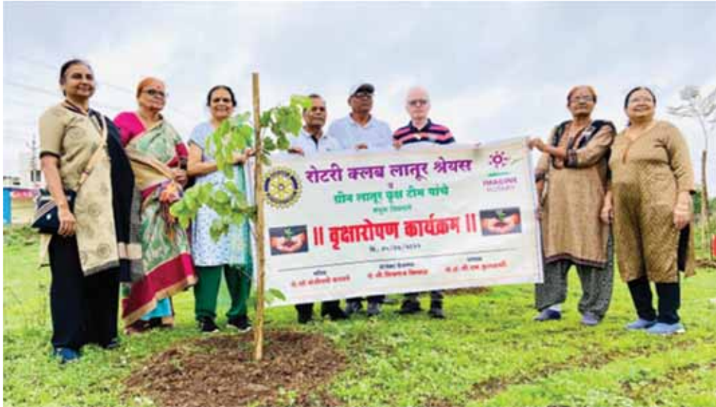
Members of RC Latur Shreyas at a plantation drive.