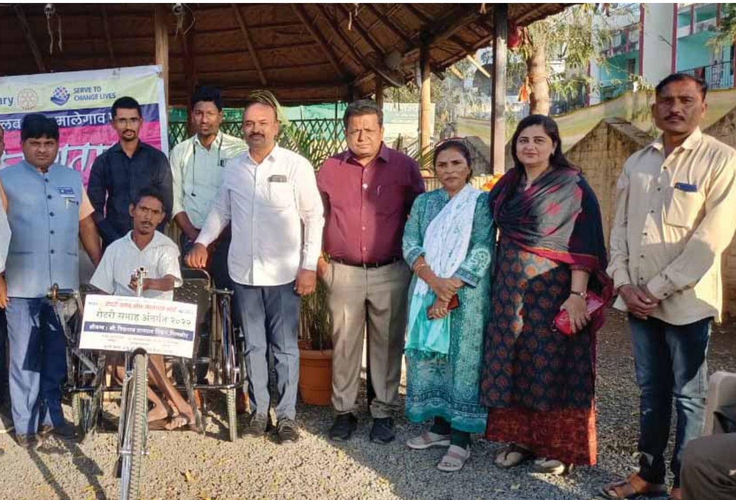
Club members with a beneficiary chosen for a plastic surgery.