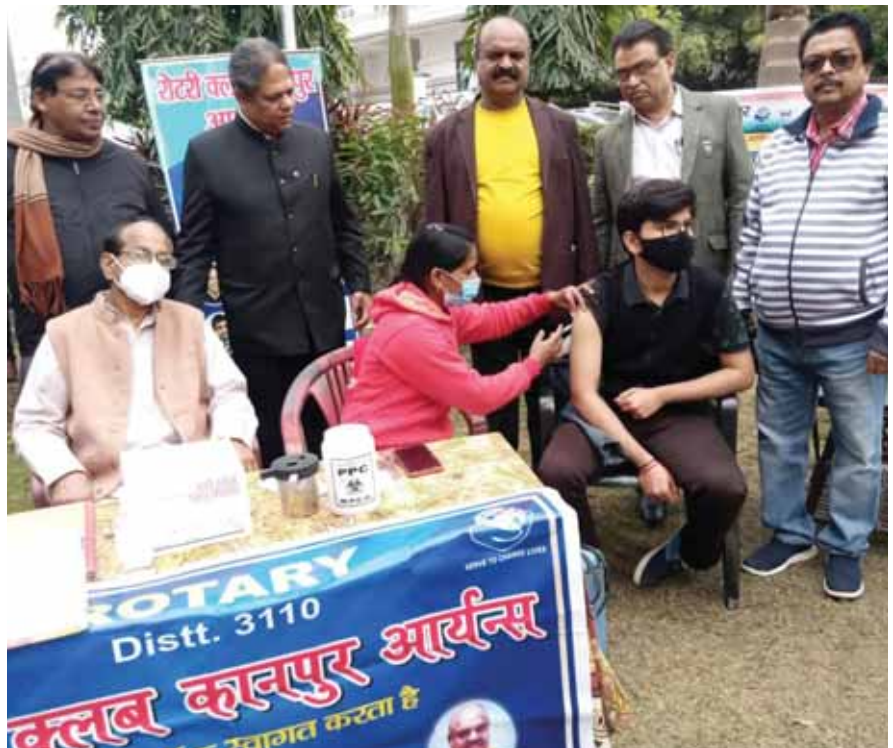
A Covid vaccination drive at the Sudarshan Housing Society.

The club also conducted a dental check-up camp at Vill-Barhat, a village near Kanpur. In association with Rama Dental College, Kanpur, the camp tested and treated over 55 people. Rotarians spread awareness on the ill-effects of chewing tobacco to those at the camp.■