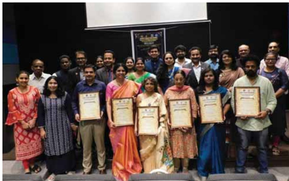
Rotarians with the awardees at the Vocational Excellence Awards programme.