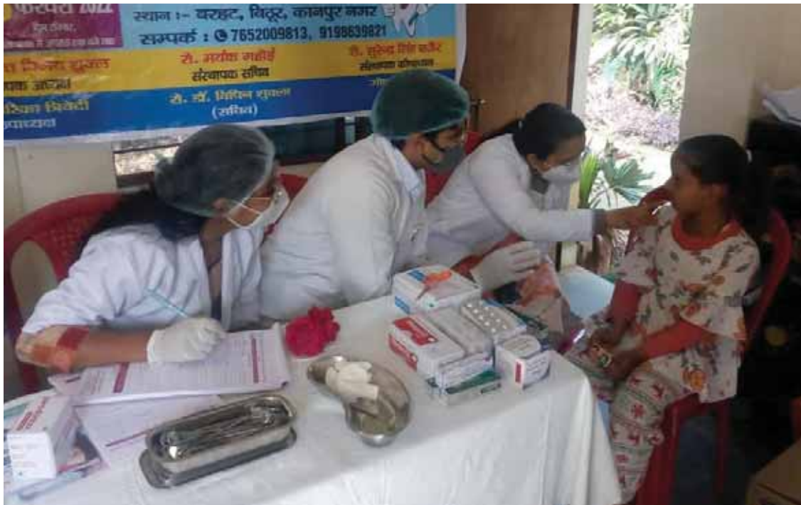
A dental camp in progress.

RC Kanpur Aryans, RID 3110, organised a Covid vaccination drive at the Sudarshan Housing Society. Over 100 people were vaccinated at the camp. “Rotary clubs have been relentlessly implementing the necessary response measures since the start of Covid-19. Vaccination is a powerful weapon against this pandemic,” says club member KK Anand who took the jab at the camp.