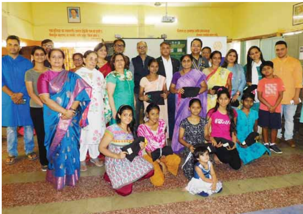
Members of RC E-club of Pune Diamond at a sanitary napkin distribution drive.