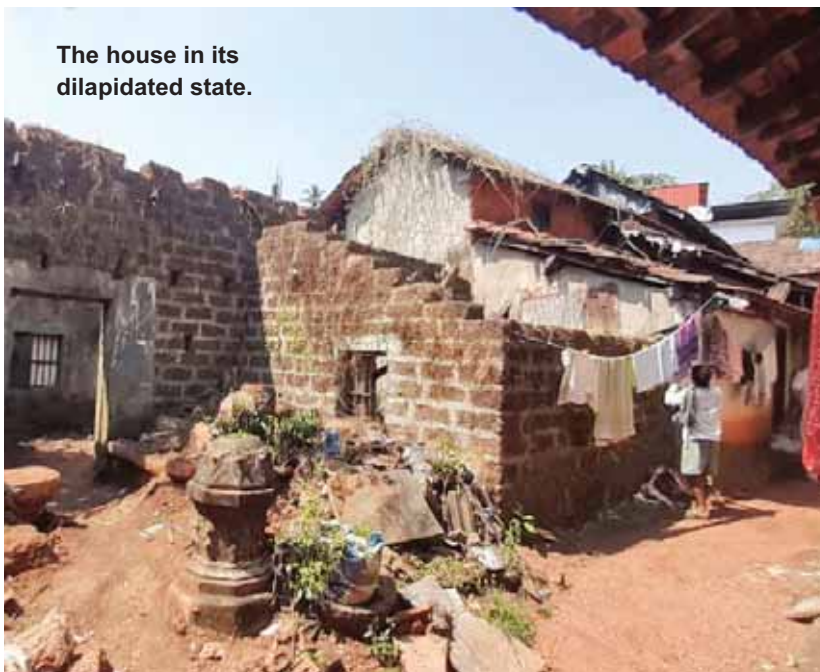
The house in its dilapidated state.

Mense instantly assured them of help from Rotary though "knowing less of the road ahead". He took it