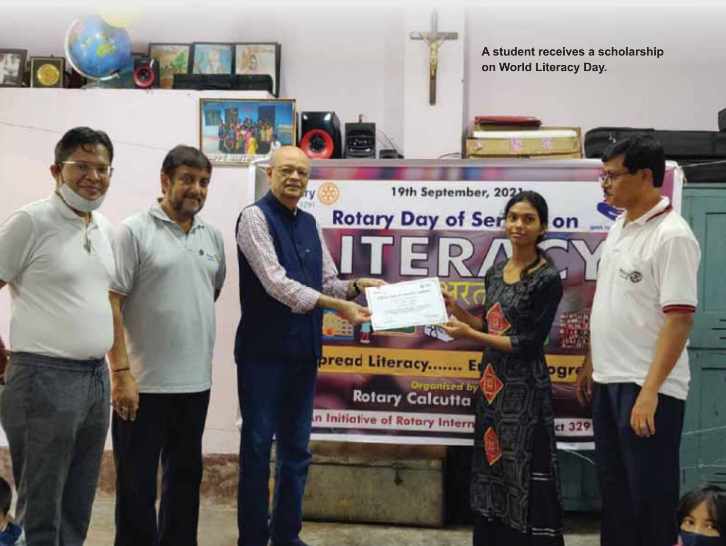
A student receives a scholarship on World Literacy Day.

The clubs from the district in collaboration with Rotaract District