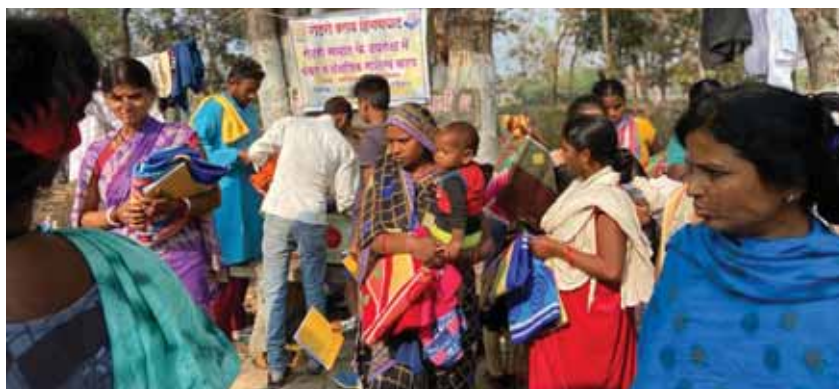
Blankets being distributed as part of Rotary Week celebrations.