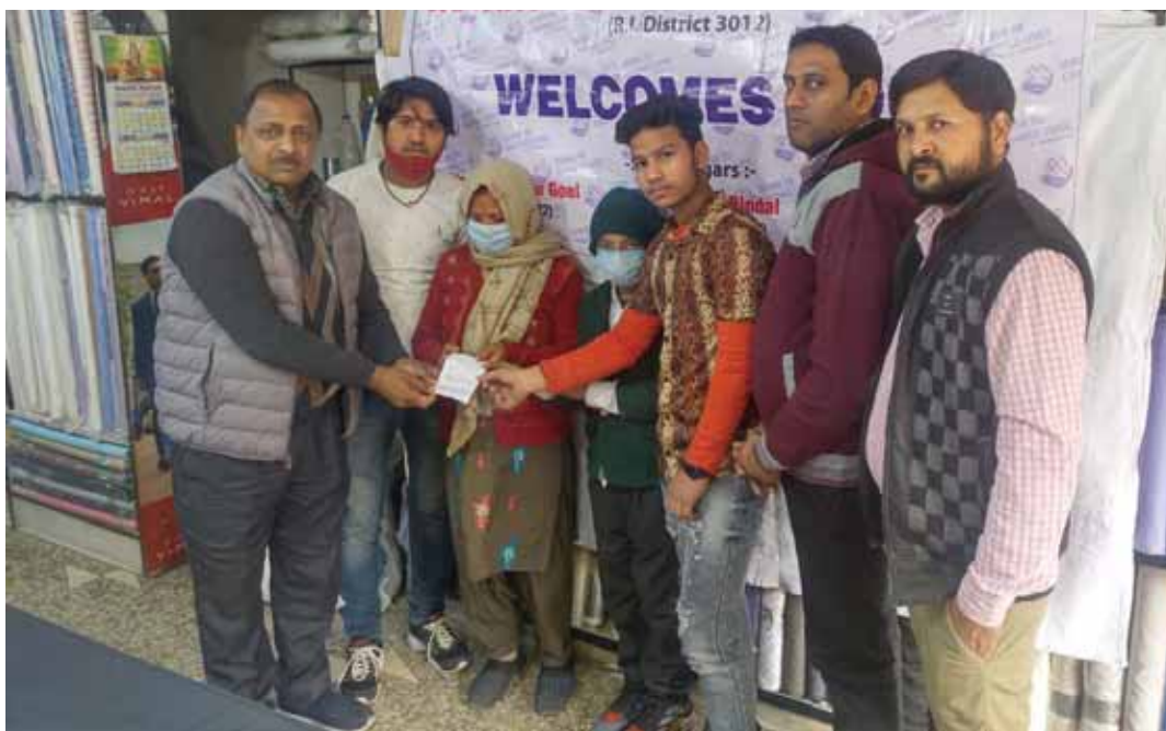
Rotarians give financial assistance to two girls for their education.