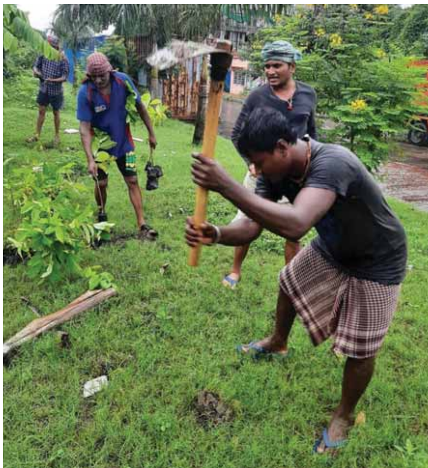
Locals participating in the tree plantation drive.

3291 joined hands and organised a mega tree plantation drive to sensitise the citizens about the need to protect the environment. Over 100,000 saplings were planted on the suburbs of Kolkata.