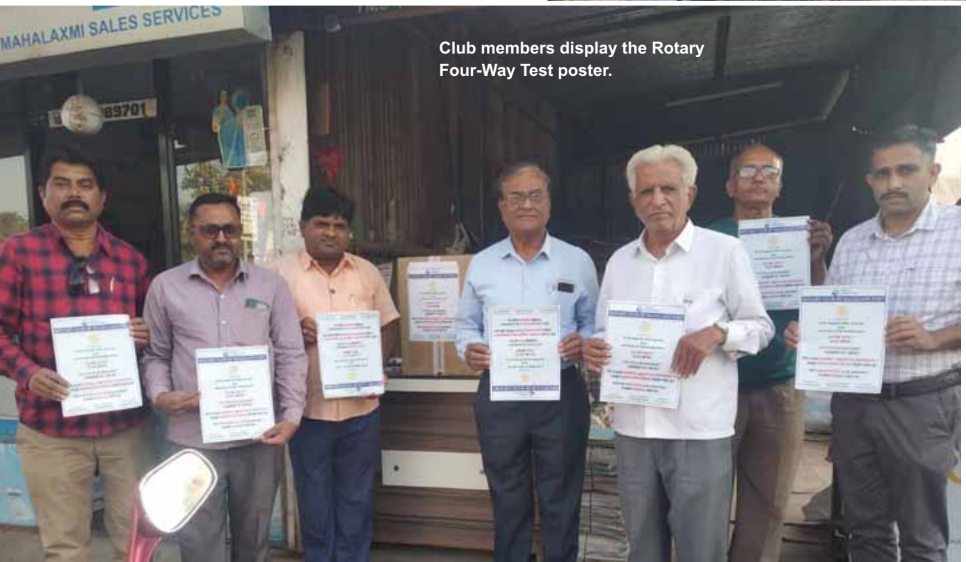
Club members display the Rotary Four-Way Test poster.