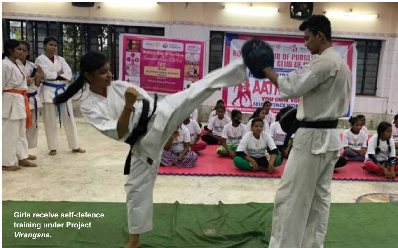
Girls receive self-defence training under Project Virangana.