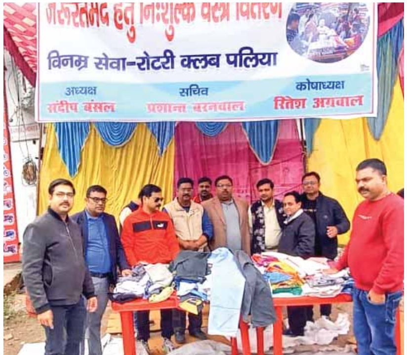
Sparingly-used clothes and woollen garments are being distributed to underprivileged families.