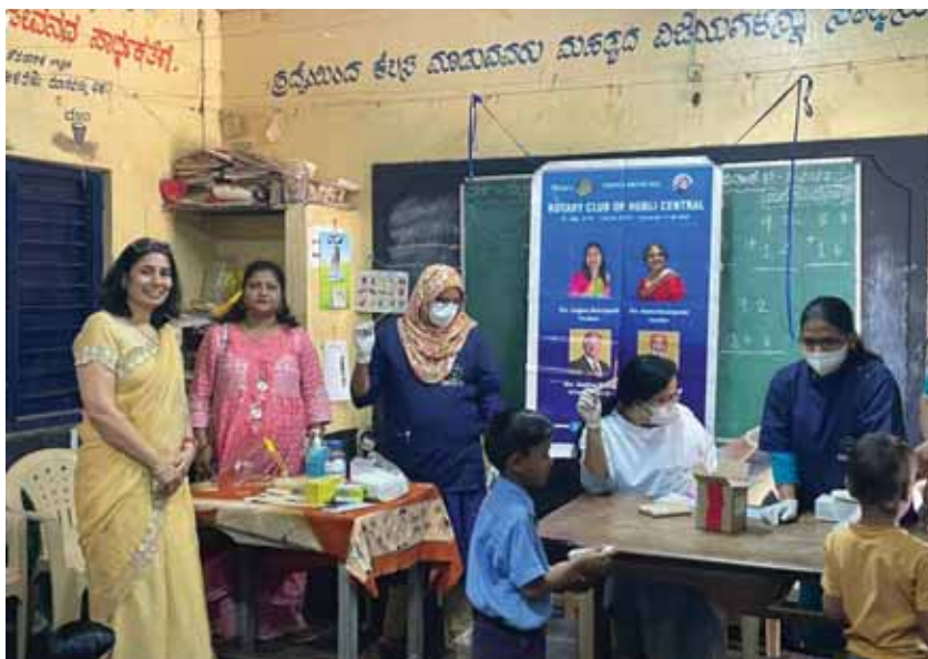
A dental check-up camp in progress.