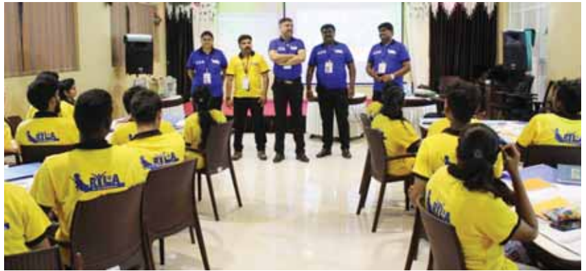
A RYLA training session in progress.