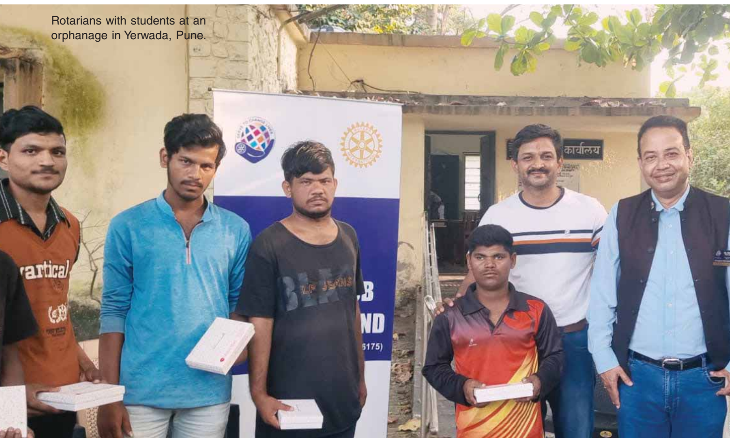
Rotarians with students at an orphanage in Yerwada, Pune.

In association with Sinsan Pharmaceuticals, Pune, the club conducted a diabetes camp where in 80 people were tested for blood sugar.■