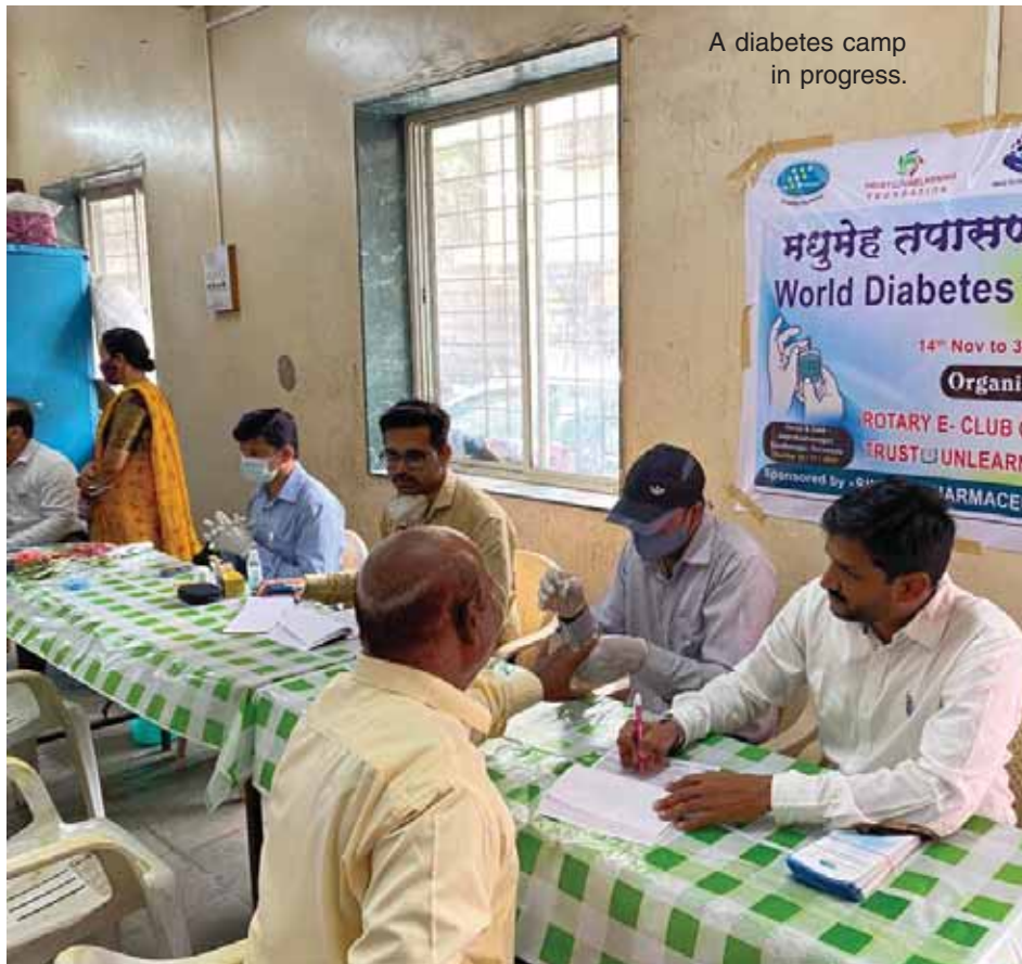
A diabetes camp in progress.