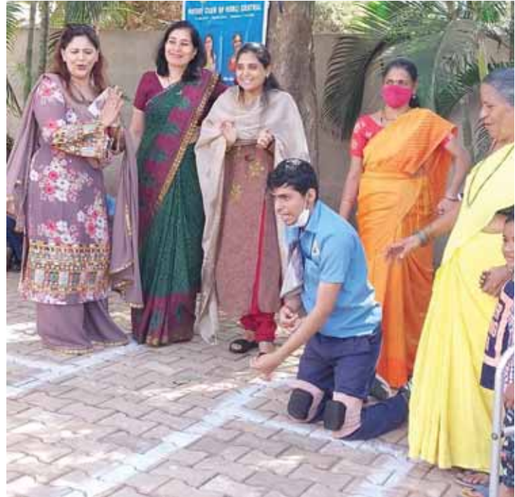
Rotarians cheer a differently-abled participant at a sports event organised by the club at the RN Shetty Rotary School, Hubli.