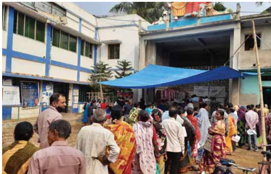
A long queue before the registration counter at one of the health camps.