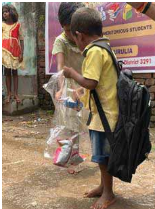
A boy carrying the school bag and other goodies given by the club.

The club celebrated its Rotary Day of Service by distributing school kits to 30 children in Kotloi village near Purulia. The kit comprised a school bag, water bottle, a stationery pouch, colouring kit, painting books, five notebooks, two packets of noodles and other snacks and