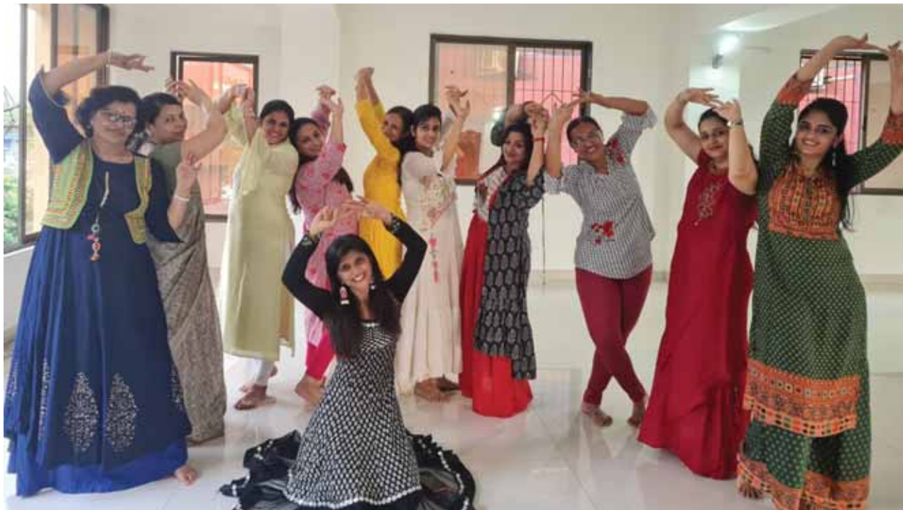
Rotary Anns at the Garba workshop.

consistent efforts to the help the elderly. We will continue to provide all necessary help to this home," the club president said.