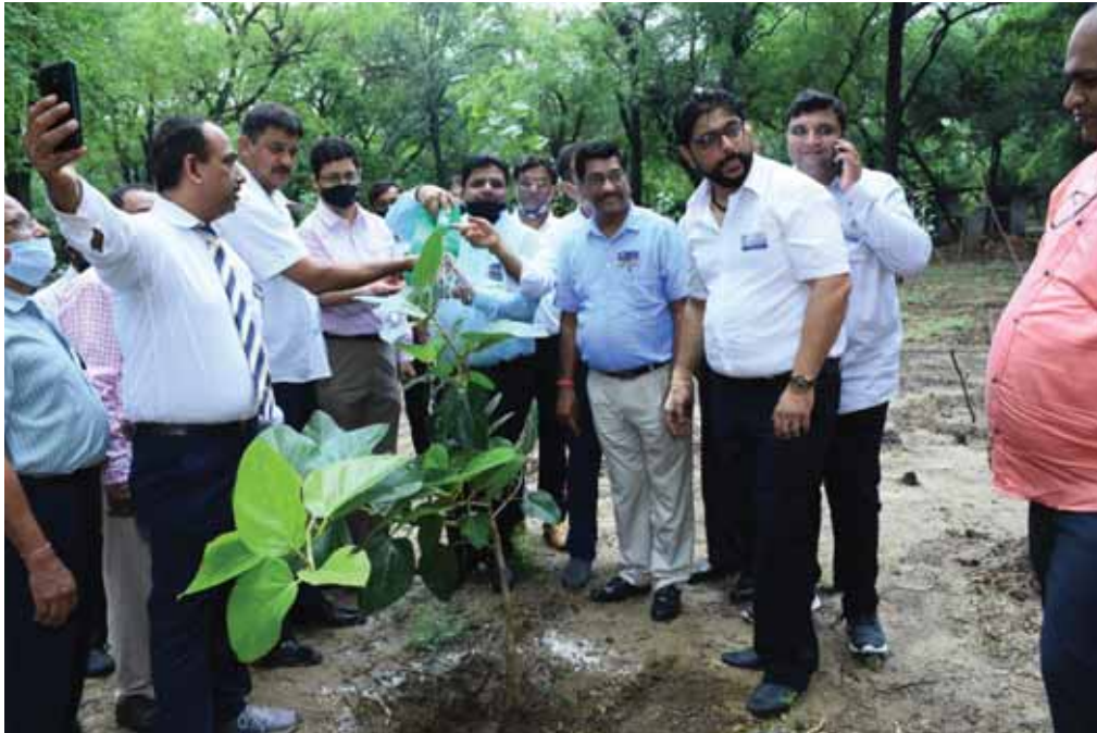
Rotarians at the plantation drive at the Kanpur Zoological Park.

RC Kanpur North, RID 3110, under its 'Rotary for Environment' initiative conducted a tree plantation drive at the Kanpur Zoological Park to mark the club's silver jubilee year.