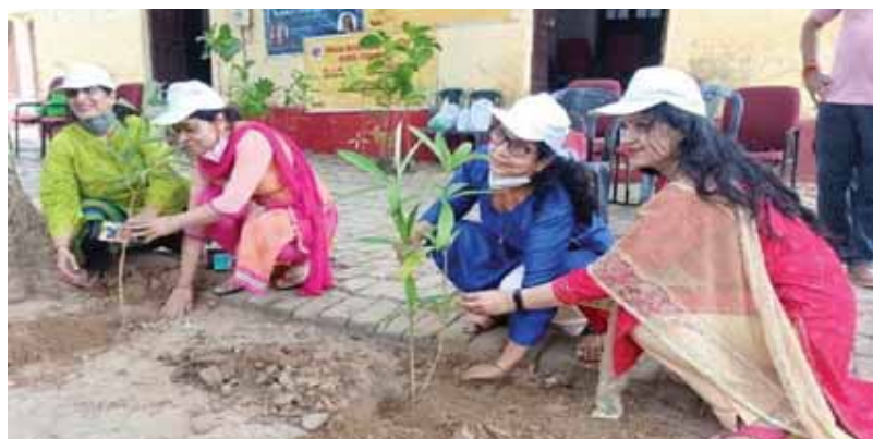
Women Rotarians plant trees on Krishna Janmashtami.