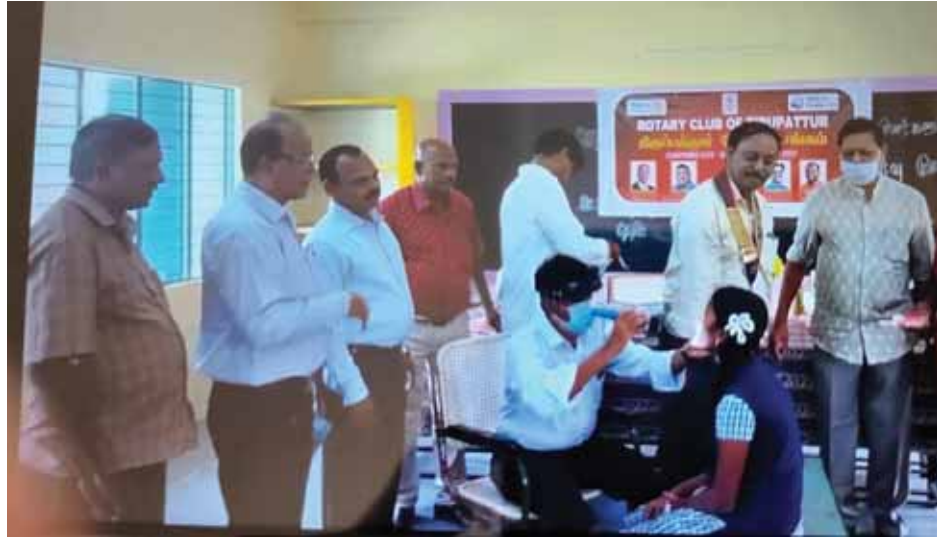
A dental camp in progress.

The club conducted two blood donation camps for college students at the Podhigai Engineering College and the Sacred Heart College in the town. A total of 125 units of blood was collected from donors of both the colleges. ■