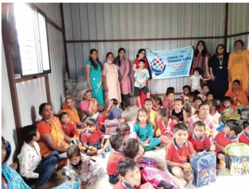
Rotarians with students of a tribal school.