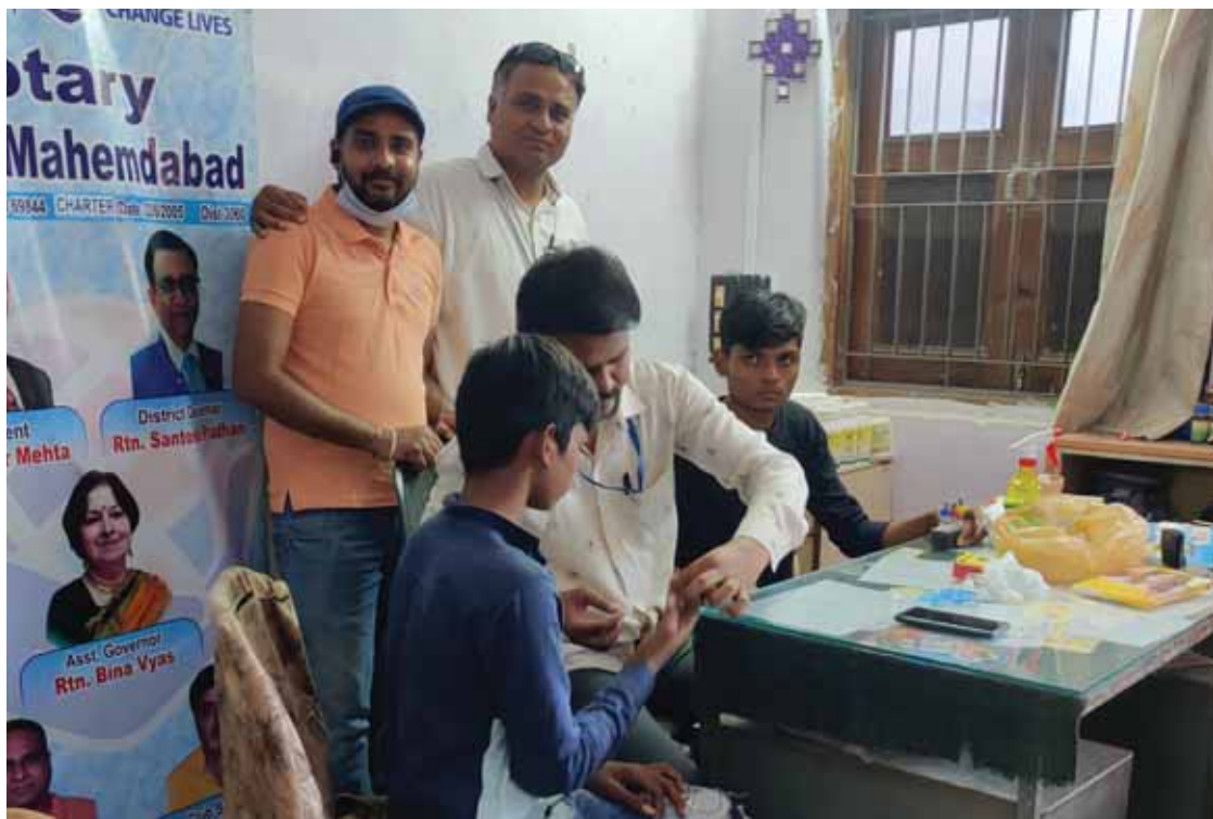
A blood group detection camp at the Gyan Jyot High School.