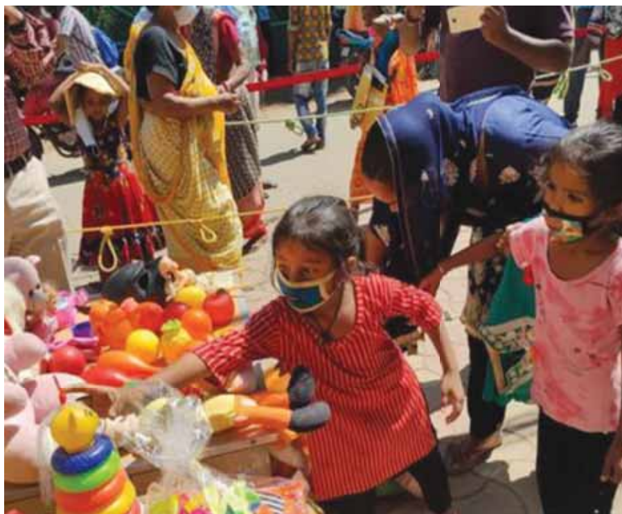
Children take toys from the Wall of Kindness.

chocolates. The club sponsored the education of five meritorious students for a year.