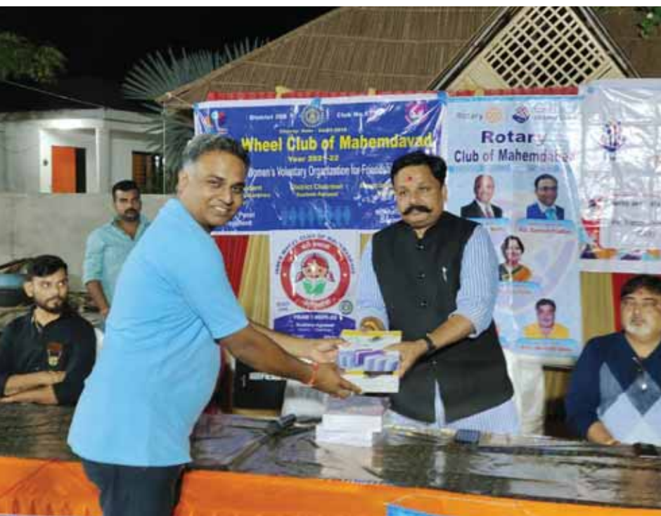
Club member being honoured by UP minister Arjun Singh Chauhan.

In collaboration with the Yash Pathology Laboratory, RC Mahemdabad, RID 3060, conducted a blood group detection camp at the Gyan Jyot High School and Saraswati Vidya Mandir, Mahemdabad.