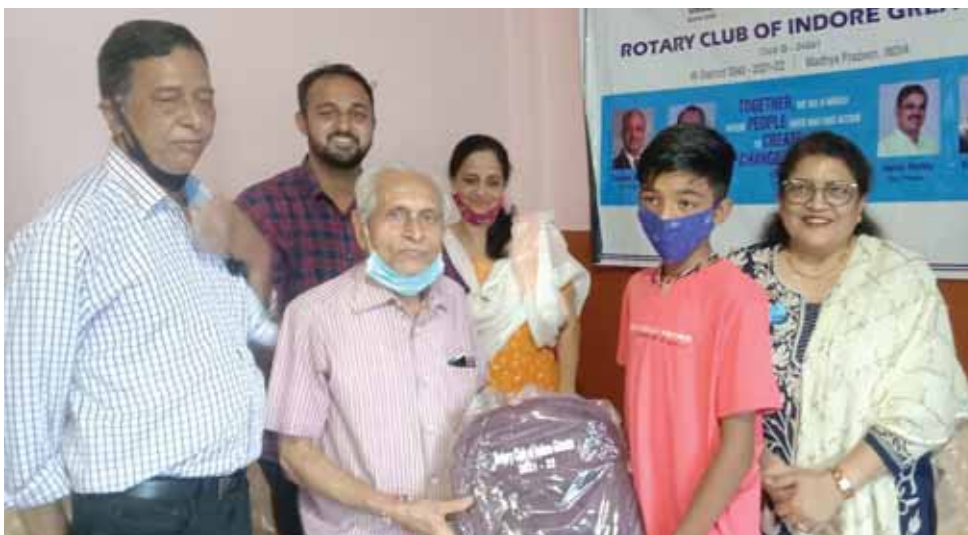
A student receiving the school bag.

RC Indore Greater, RID 3040, in association with AIM for SEVA, an NGO involved in education and career development of those from underprivileged families and