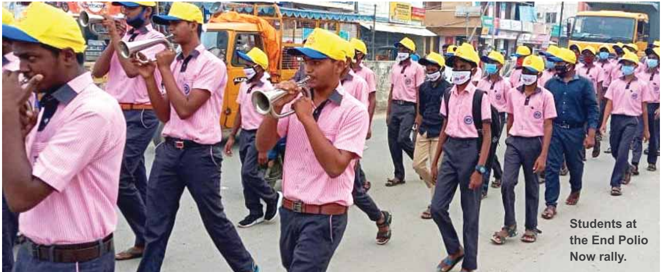
Students at the End Polio Now rally.