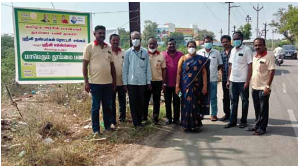
Rotarians near the desilted canal.

RC Srivilliputtur Friends, RID 3212, organised the desilting