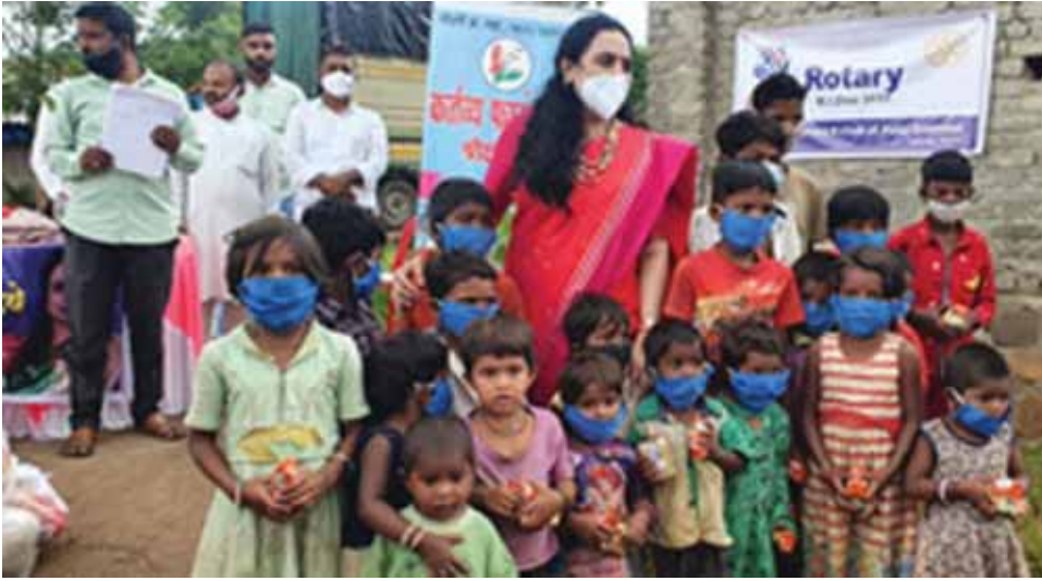
Children with gifts from Rotarians.

Rotary E-club of Pune Diamond, along with RC Pune University, RID 3131, organised a career guidance seminar for children of police personnel studying in Classes 11 and 12.