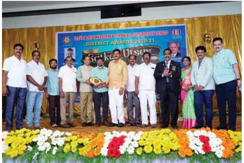
RC Gudur honoured with 5-Star Champion Club Award.