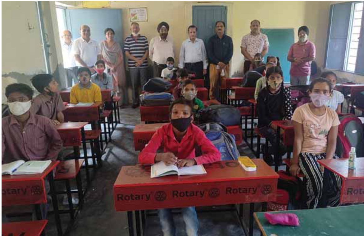
Students using the new desks and benches donated by the club.

RC Ambala Midtown, RID 3080, provided 40 benches for the seating of school children at the Government Senior Secondary School, Sultanpur, Ambala city in Haryana.