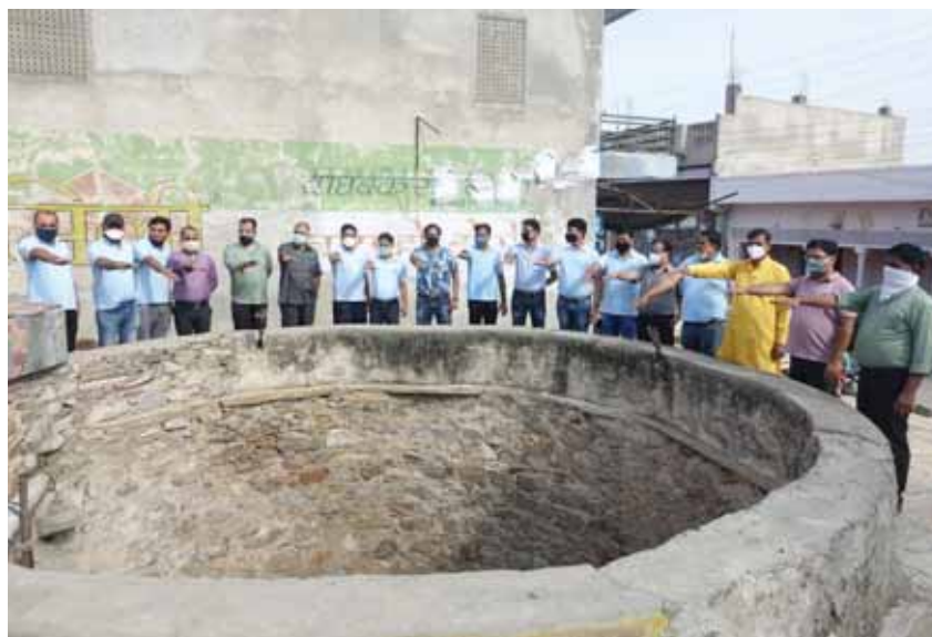
Club members pledge to save groundwater.

RC Dausa, RID 3054, in association with the Dausa district administration undertook and completed the recharging of 70 wells in and around Dausa, Rajasthan.