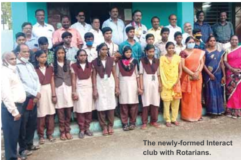
The newly-formed Interact club with Rotarians.

Sixty-five people were screened for eye ailments at a special camp held at the Boomi Thai Niruvanam, a local NGO, at Tirupattur. The club honoured 13 government staff and officials who had served the community in various capacities. The awardees thanked Rotary for the recognition. ■