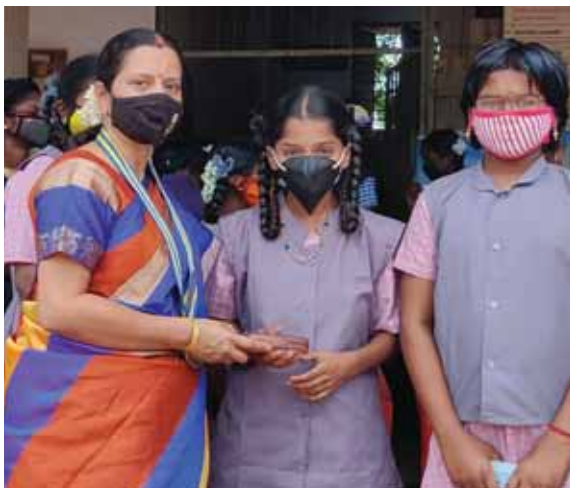
Spectacles being given to students.