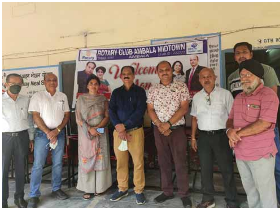
Club members at the Government Senior Secondary School, Sultanpur.