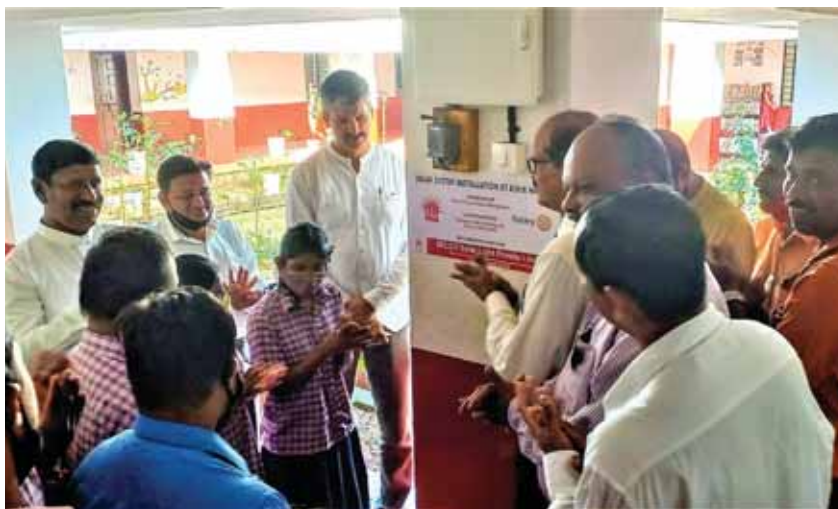
Rotarians launch the solar lighting facility at the rehabilitation centre.