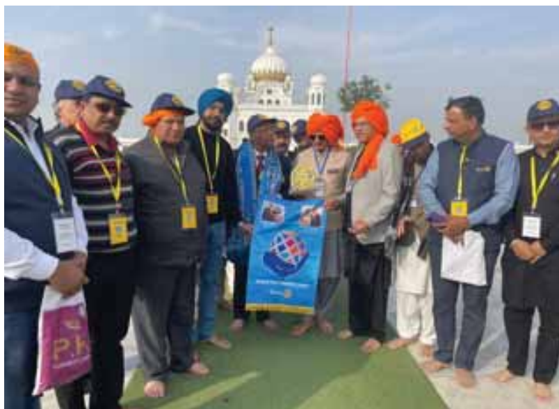
Rotarians at the Kartarpur Sahib.

T en Rotarians from RC Mansa Royal, RID 3090, visited the holy shrine of Kartarpur Sahib in Pakistan, along with their spouses. The delegation of Rotarians