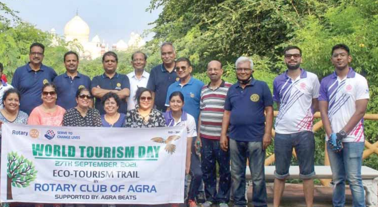
RC Agra members with spouses and Rotaractors at the Eco Trail to mark World Tourism Day.