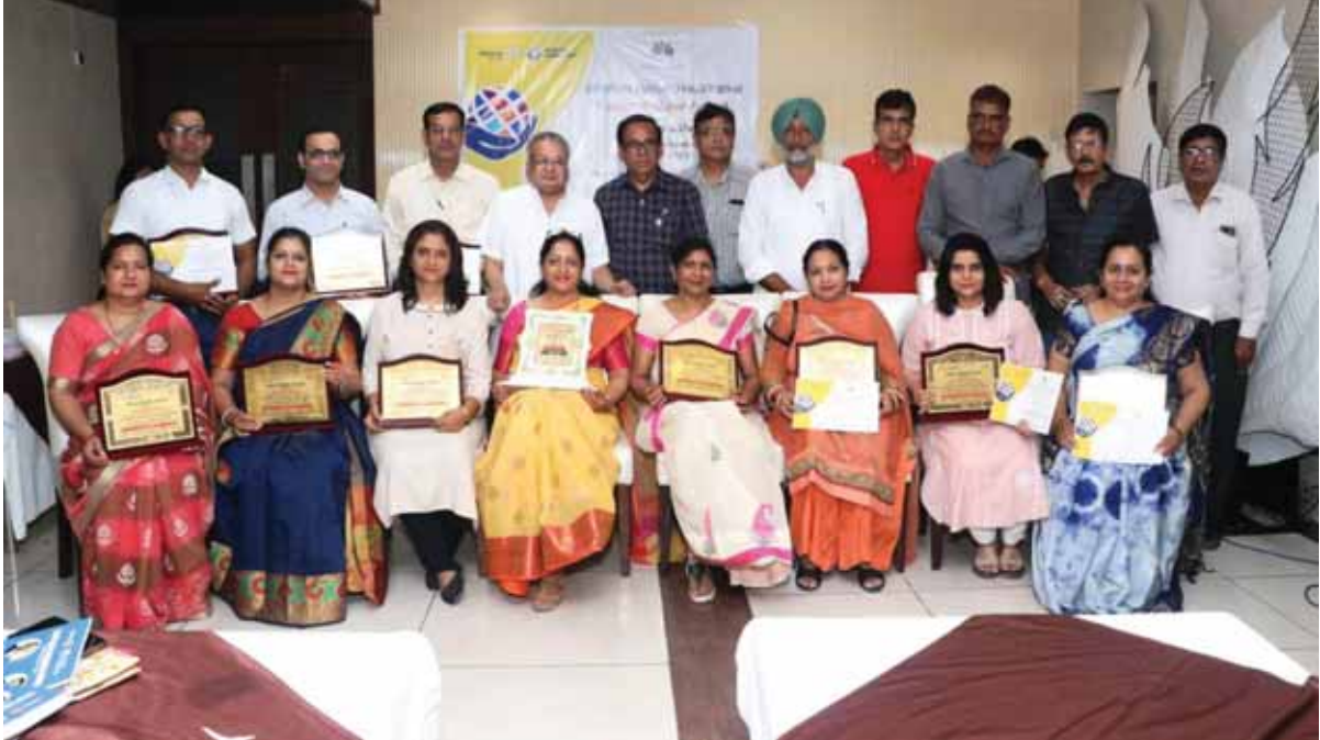
Club members along with teachers who received the Nation Builder Awards.