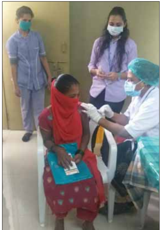
A vaccination camp in progress at Nashik.

The Indian Valve Company is sponsoring the purchase of the required number of vaccines as part of its CSR initiative.■