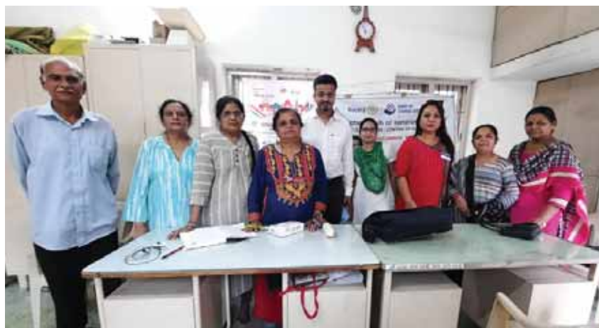
Rotarians at the diabetes check-up camp.

D iabetes screening camp, along with a health talk, was organised by RC Senoras Jamnagar, RID 3060, at the Narmadeshwar Mahadev temple in the Panchavati area that benefited sixty people in