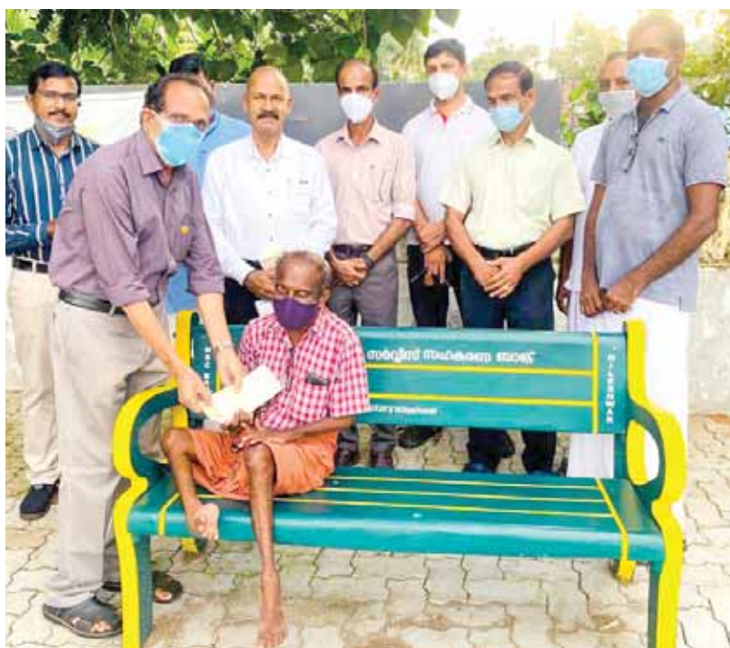
Left: Motorcycle rally at Budaun.

EPN handbills were distributed at public health centres and Government Hospital, Tirupur. “We explained to the pregnant and lactating