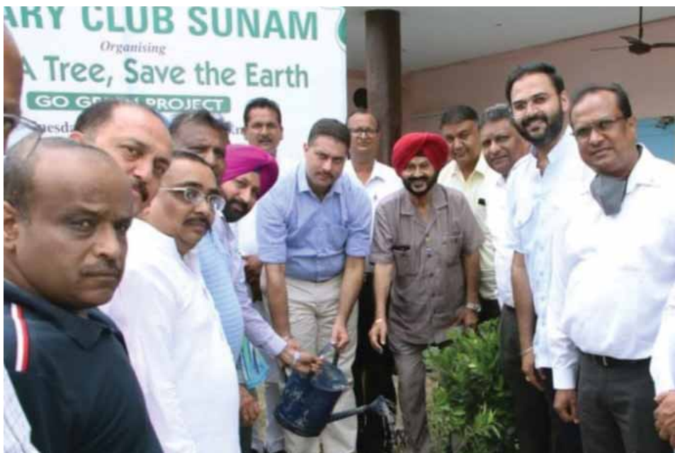
A greening mission in Sunam.