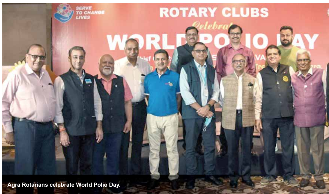
Agra Rotarians celebrate World Polio Day.

A motor cycle rally was taken out by RC Budaun Central, RID 3110,