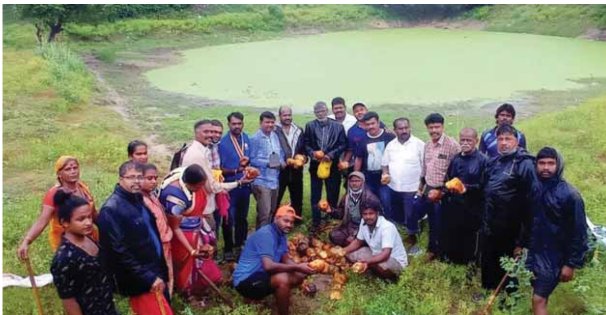
Members of RC Pondicherry White Town participate in planting palmyra seeds on the banks of a pond.

Rotary Club of Pondicherry White Town, RID 2981, helped to clean a canal in the Poornakuppam village near Puducherry. The canal