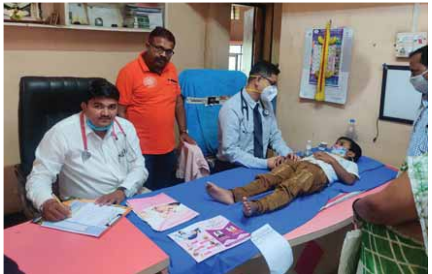
A health check-up camp for children.

The club also conducted a health checkup camp for children below the age of 14 years. The camp was co-hosted by Matoshri Children's Clinic and close to 110 children from Shirol benefitted from it. ■