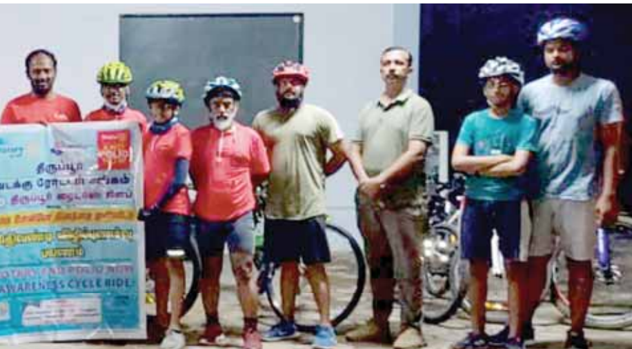
Left: Members of RC Tirupur North take out a cycle rally.

vaccination. ‘Rotary and Polio’ was the topic at the panel talk hosted by RC Jamshedpur. “We covered all aspects of PolioPlus projects, right from its conception, history and its growth; success, obstacles and efforts leading to 100 per cent eradication of polio,” she said. Rotarians donated generously to the PolioPlus Fund. A giant hoarding was erected by RC Jamshedpur Steel City at a busy junction.