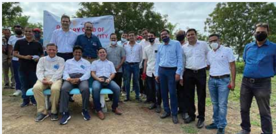
RC Jalgaon Gold City members at the inauguration of new benches.