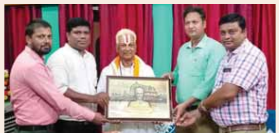
A retired professor being honoured by members of RC Kushinagar.

To observe the martyrdom of havildar Abdul Hameed, who was awarded Param Vir Chakra posthumously for his heroic actions in the Indo-Pak war 1965, the club hosted a blood donation camp at the Madrasa Umar Farooq at Kasia in Kushinagar. Over 30 youth who turned up to donate blood on the occasion were given citations by the club.