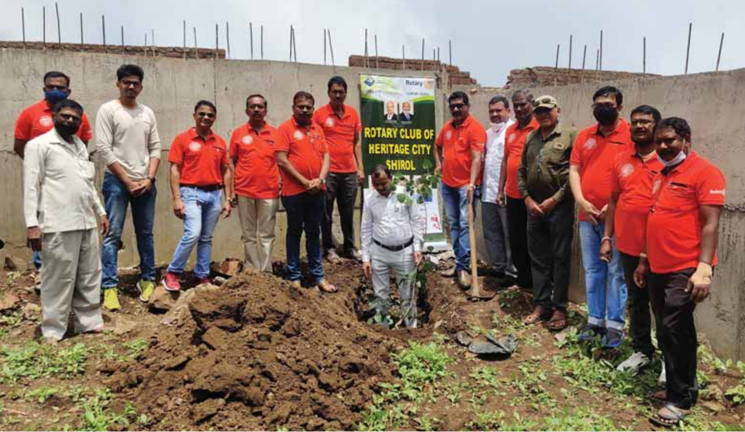
Rotarians plant trees at the Kalleshwar temple.