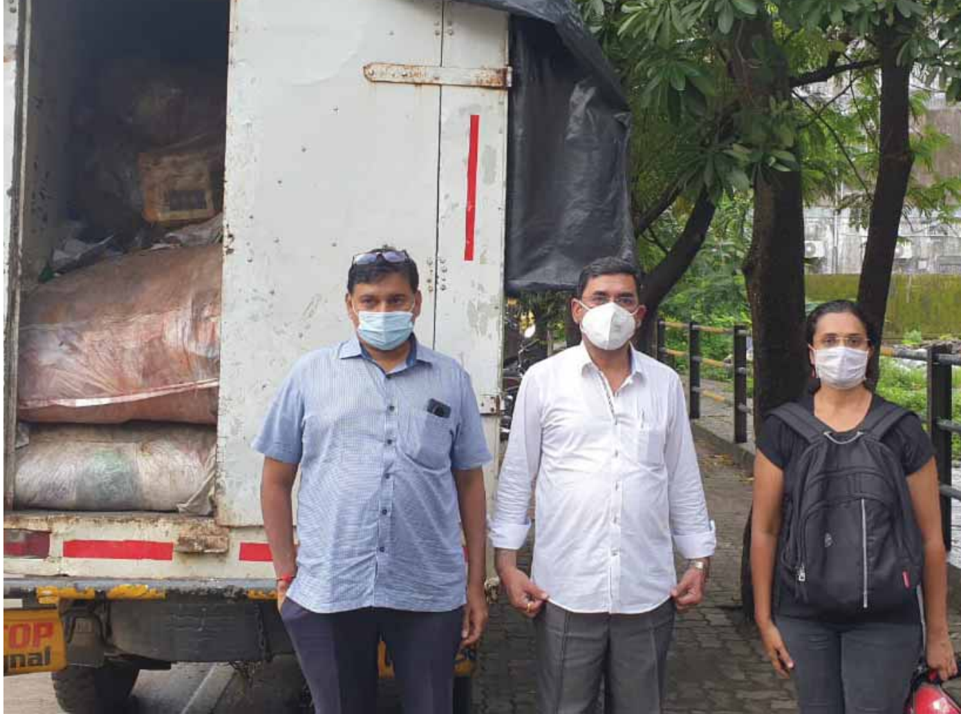
Waste bundles being transported to Thane.