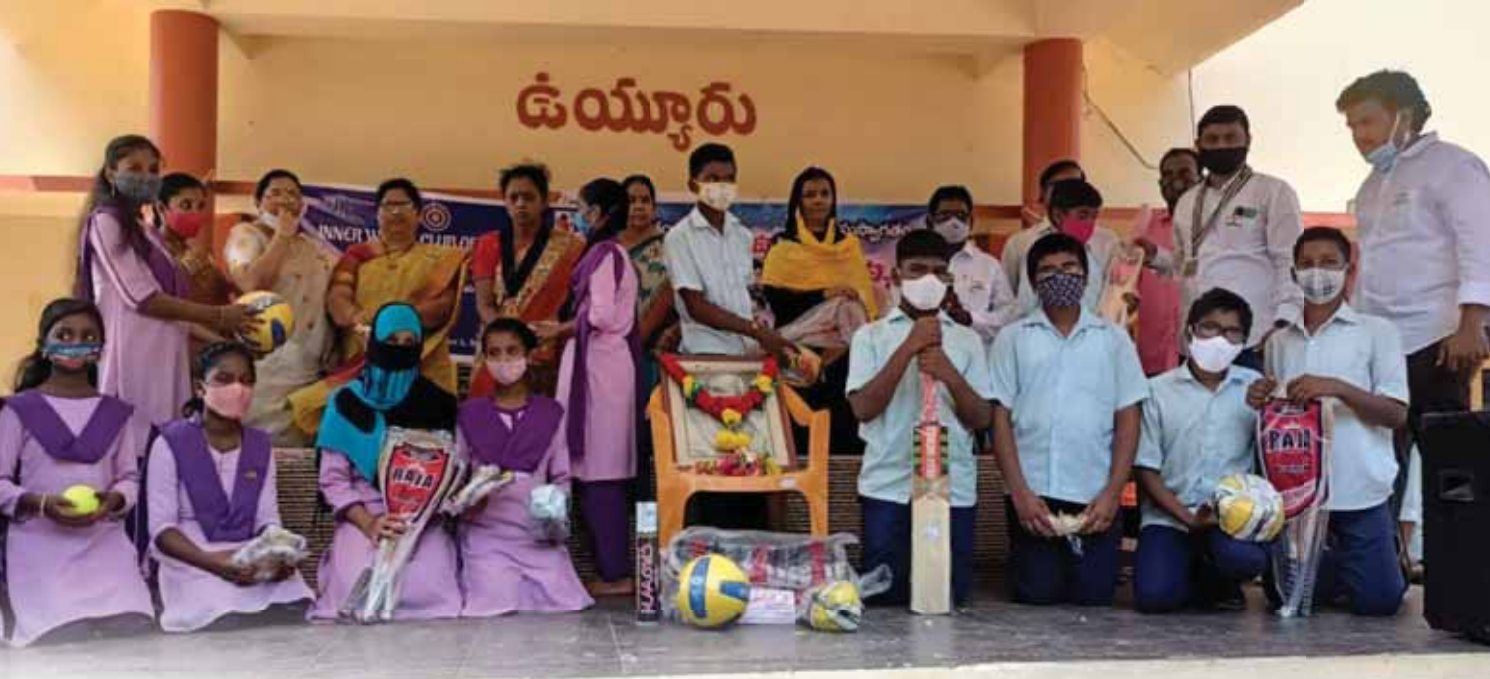
Students with sports kits at the Zilla Parishad High School, Vuyyuru.