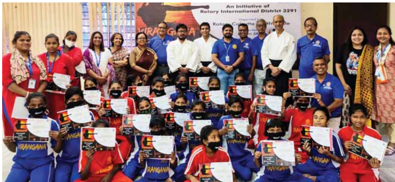
Rotarians of RC Calcutta South Circle with the trainers and participants after the Virangana workshop.