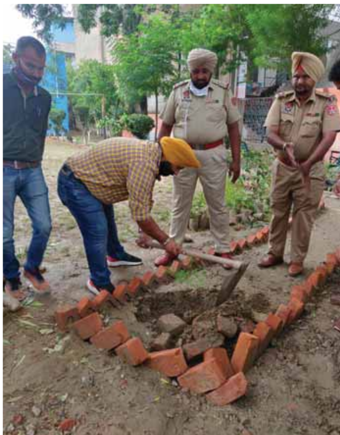
Rotarians plant saplings with policemen.