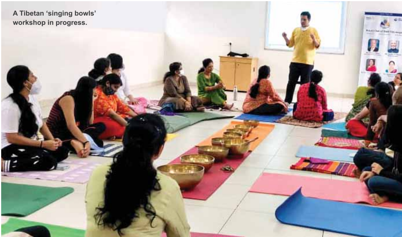
A Tibetan 'singing bowls' workshop in progress.