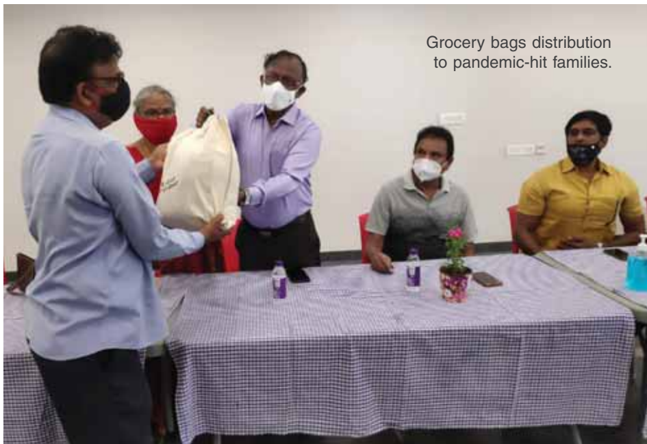
Grocery bags distribution to pandemic-hit families.