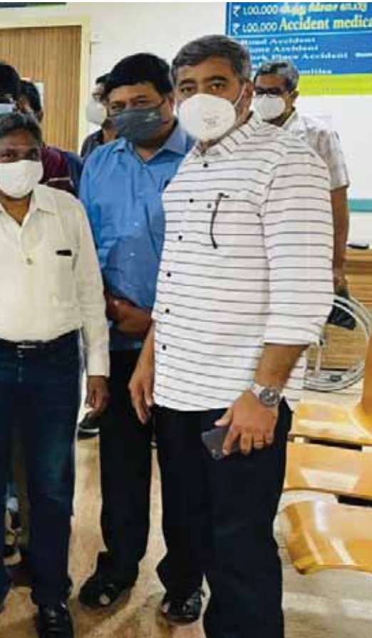
Left: Members of RC Coimbatore Meridian after helping a physically-challenged man and his family.