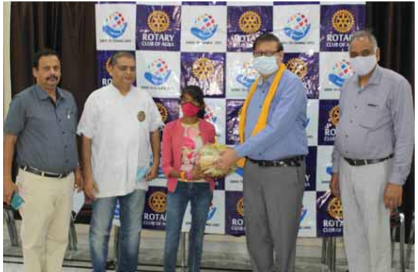
Food packets being given to a girl.