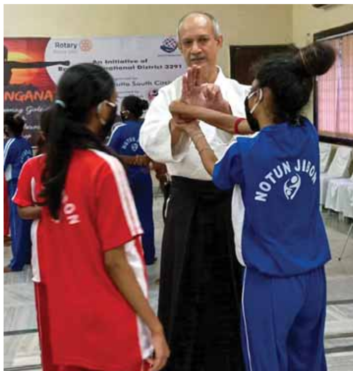
Girls being taught martial arts.

R otary Club of Calcutta South Circle, RID 3291, trained self-defence skills to 23 girls and three women residing at the Kalighat red light area through their Project Virangana. The beneficiaries were identified with the help of Notun Jibon, an NGO working for the welfare of these girls and women.