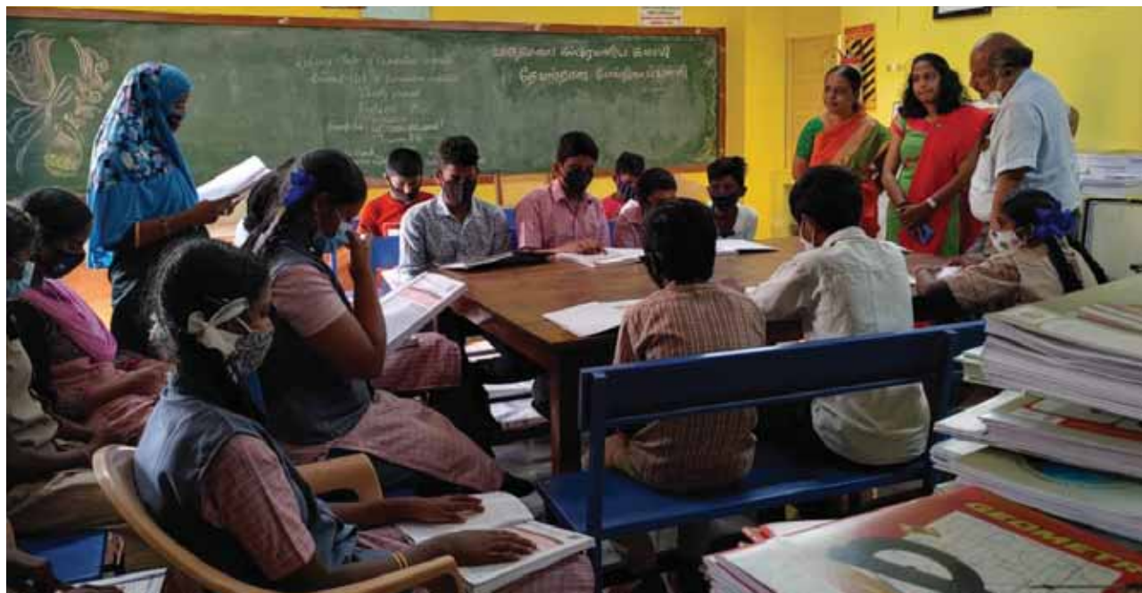
An English speaking class in progress.