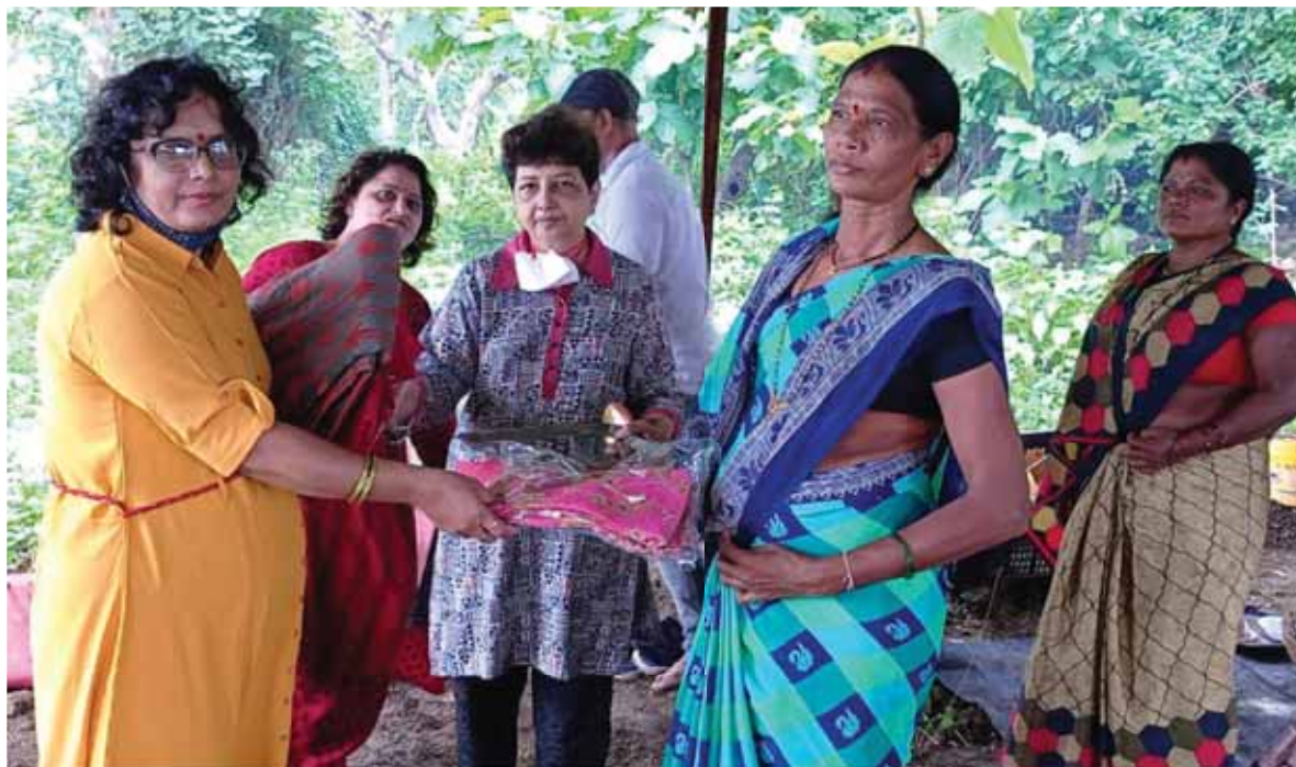
A saree being gifted to a tribal woman.