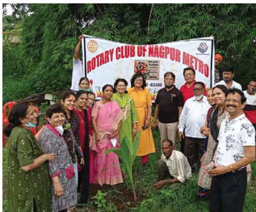
Rotarians with spouses at the organic farm.

RC Nagpur Metro, RID 3030, donated 50 saplings of regional trees like amla, neem, kavat ( wood apple ), tamarind and mango to G-Naturals Farms, an organic and natural products startup in Nagpur. Club members enjoyed an all-organic meal at the farm and thereafter were treated to an exhibition-cum-sale of all organic fruits, dishwasher, kitchen grease remover, natural oils, ghee being made at the farm.