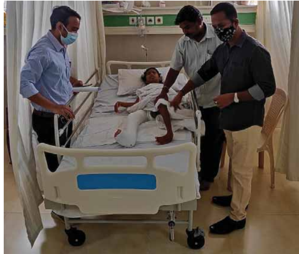
A child being treated with corrective surgery as part of the club's Project First Step.

two physically-challenged people at the camp.