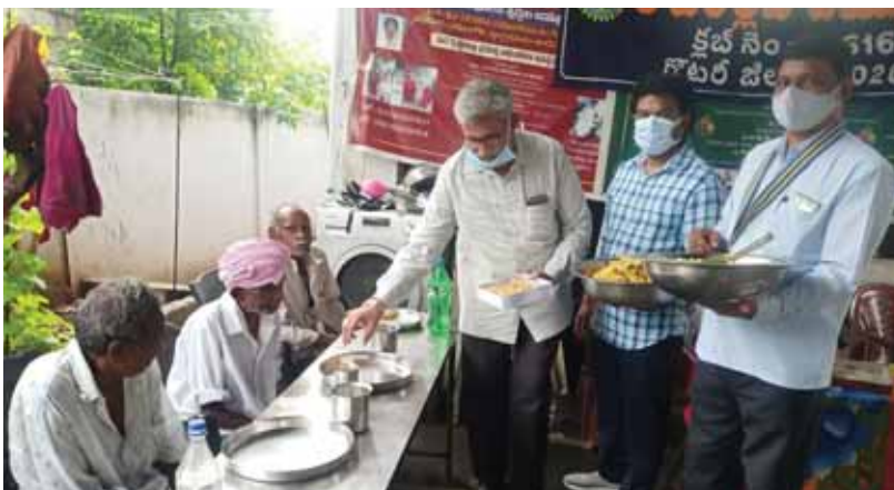
Rotarians serving food to inmates at the Adarana old age home.