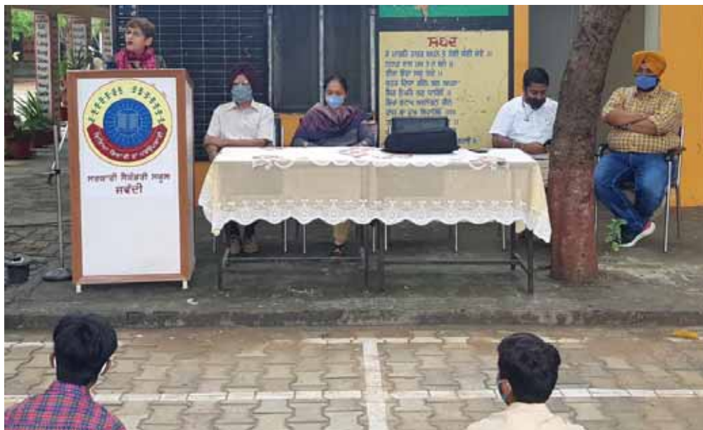
A seminar at a government school.