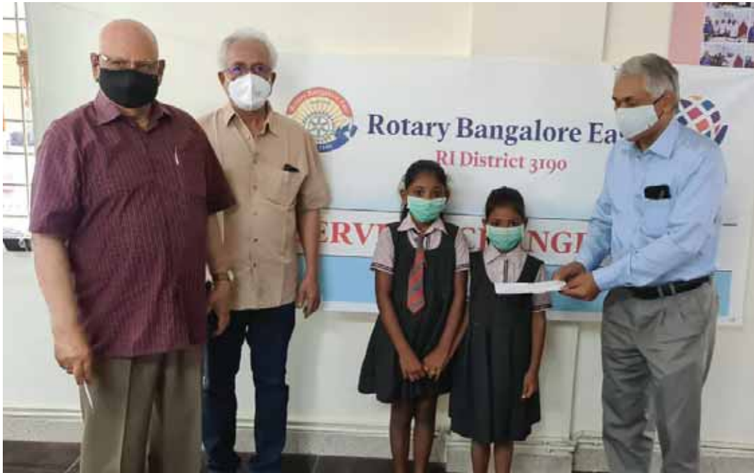
Two girls receive cheque for their school fee.