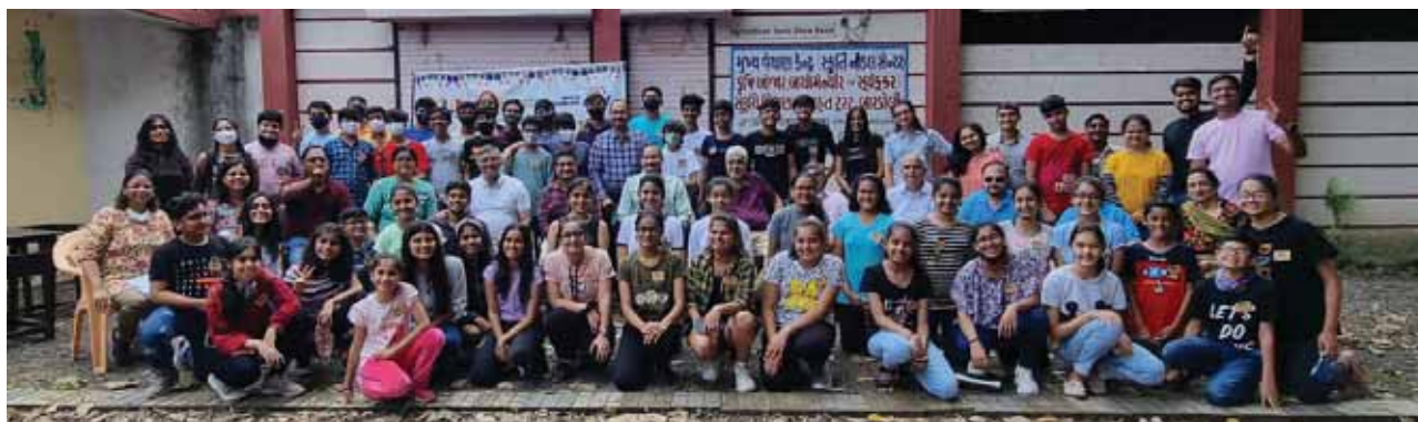
A photo-op at the RYLA.

More than 120 students took part in a three-day RYLA hosted by RC Surat Tapi, RID 3060, through both physical and digital platforms. The event was held at Bardoli with Rotarians engaging the youth on diverse topics such as financial planning, leadership