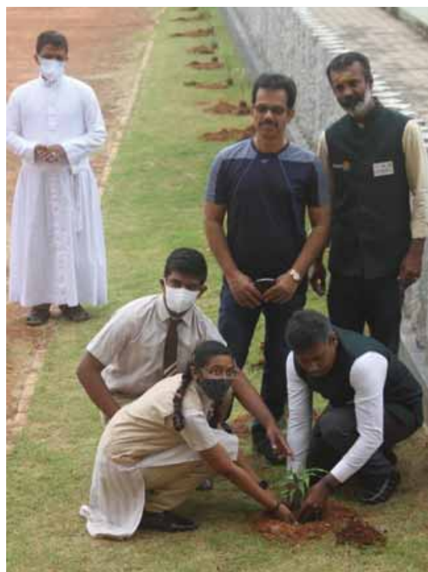
Rotarians help students plant a sapling at the Chavara Matriculation School.