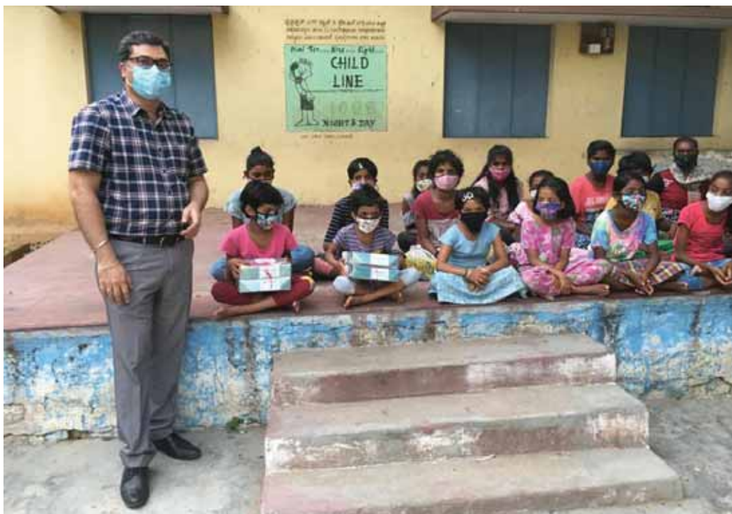
Children at the Rainbow Home with a set of new garments.