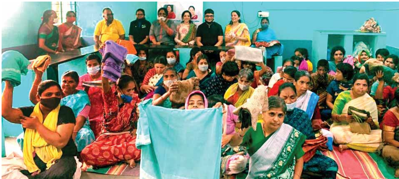
Sarees were distributed to elderly women at the Government State Home for Women, Hubli.