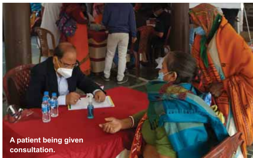
A patient being given consultation.

A round 250 patients were screened for chronic ailments like diabetes, high blood pressure and obesity at the Know your numbers camp hosted by RC Salt Lake Metropolitan Kolkata, RID 3291, in partnership with RC Hooghly at the Shri Kashi Vishwanath Seba Samity at Hamiragachi near Malia village.