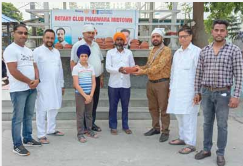
Earthen bowls being donated to residents.

The members of RC Phagwara Midtown, RID 3070, distributed earthen bowls in households to provide water for birds and animals. They instructed the residents to fill water in the bowl and place it at vantage points to help animals and birds quench their thirst.