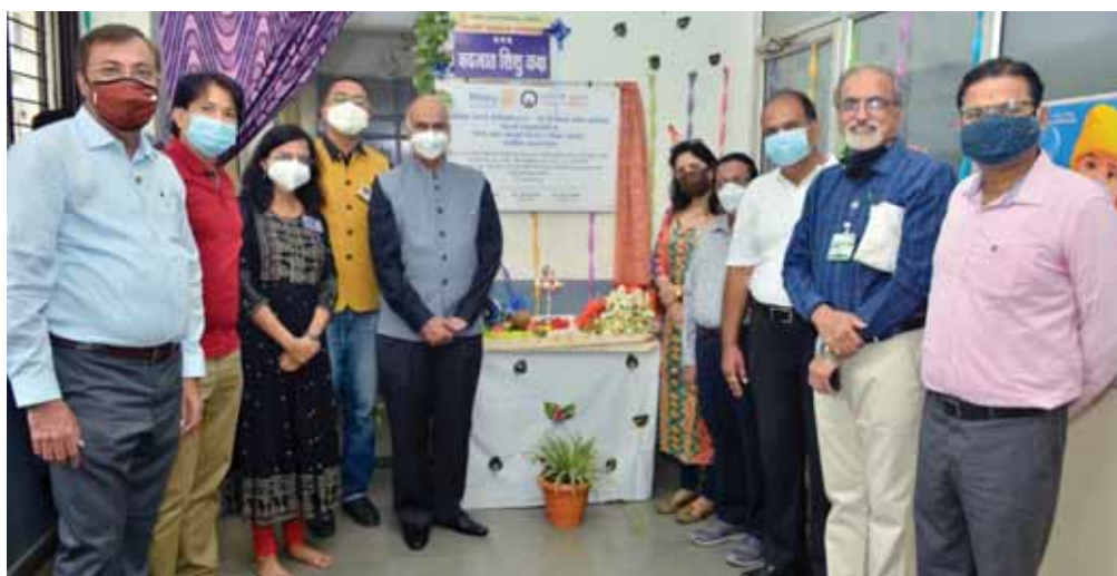
Rotarians at the inauguration of new machines.

R otary Club of Nasik, RID 3030, in association with Ring Plus Aqua, an automobile components manufacturer, equipped the Bytco Civil Hospitals in Nashik with six C-Pap machines. The equipment will be used to treat children with respiratory distress syndrome. Each of these machines cost around ₹1.5 lakh. ■