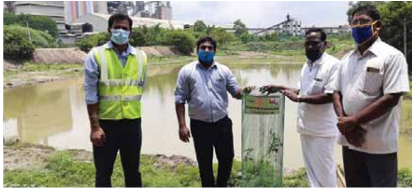
Rotarians at the desilted lake with a newly-planted sapling.

An RWH facility was set up at the Government Middle School in Melarasoor village with a display