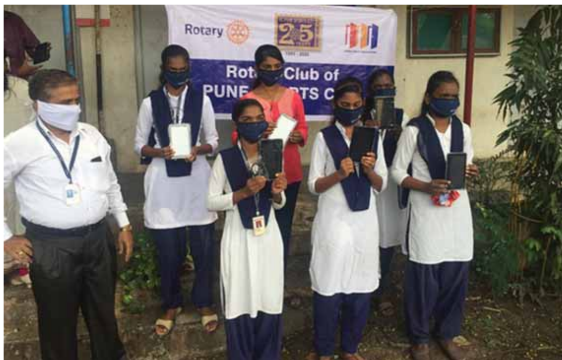
Students at Dr Dada Gujar Madhyamik Vidyalaya in Pune with their smart tablets.

A s many under-privileged students could