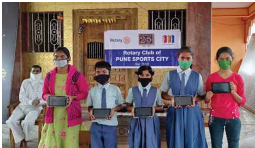
Students at Dhamane village with smart tablets.

In all, 110 smart tablets worth ₹8.8 lakh were provided to government schools through member contributions and donations from well-wishers and families of Rotarians. The smart devices benefited anywhere between 100 and 400 students this year, depending on their mode of sharing the tablets. As the four schools would retain the custody of smart tablets, hundreds of students will benefit over the next 3-4 years. "Once the schools reopen, the tablets will be used as e-learning devices as they have the preloaded course work based on the syllabus," added Savant. ■