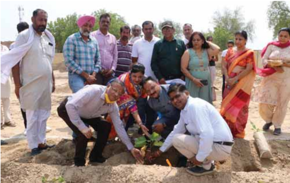
Rotarians plant saplings.

RC Sri Ganganagar Marwar, RID 3090, planted 250 saplings at a village crematorium near Ganganagar in the Marwar region of Rajasthan. Project Mini Forest