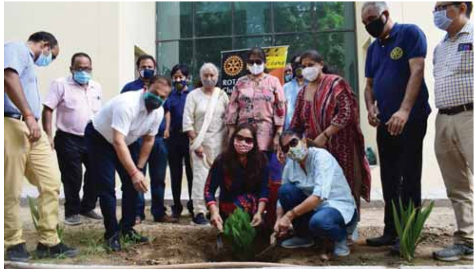
RC Agra members at a tree plantation drive.