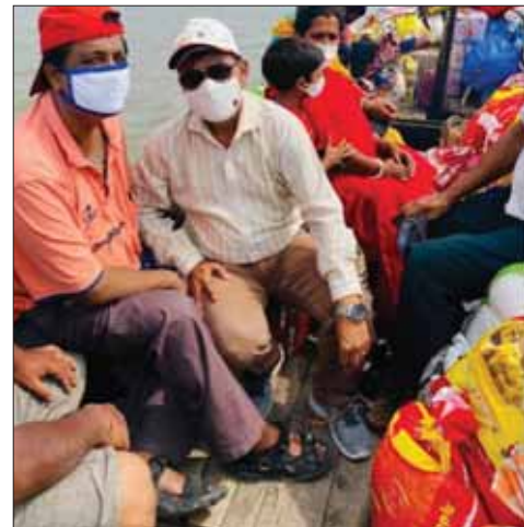
Food and relief material being distributed at Mousuni village affected by Cyclone Yaas.