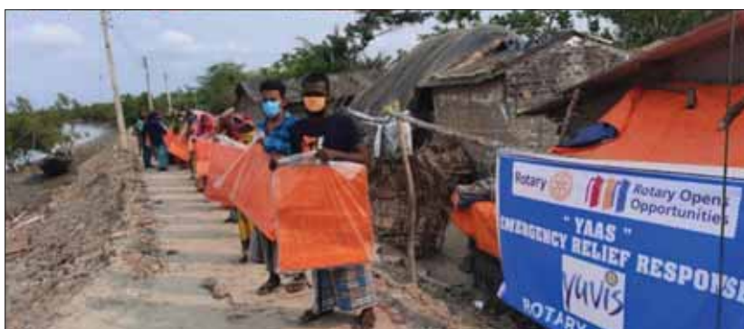
Tarpaulins being distributed to cyclone-hit villagers at the Sundarbans.

RC Calcutta Acropolis and Mother Teresa Jan Kalyan Mission, the club provide relief material worth ₹700 each to over 200 families at Deulbari, Debipur and Kultali