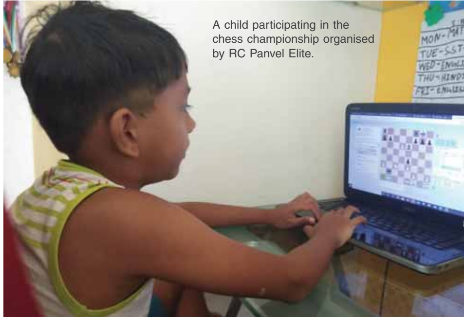
A child participating in the chess championship organised by RC Panvel Elite.