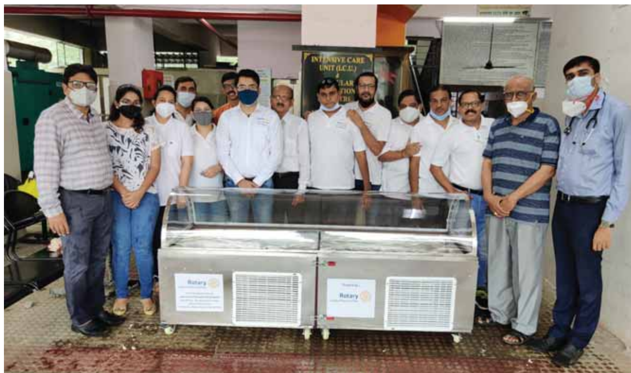
Freezer box being donated to the RSS Jankalyan Samiti, Panvel.