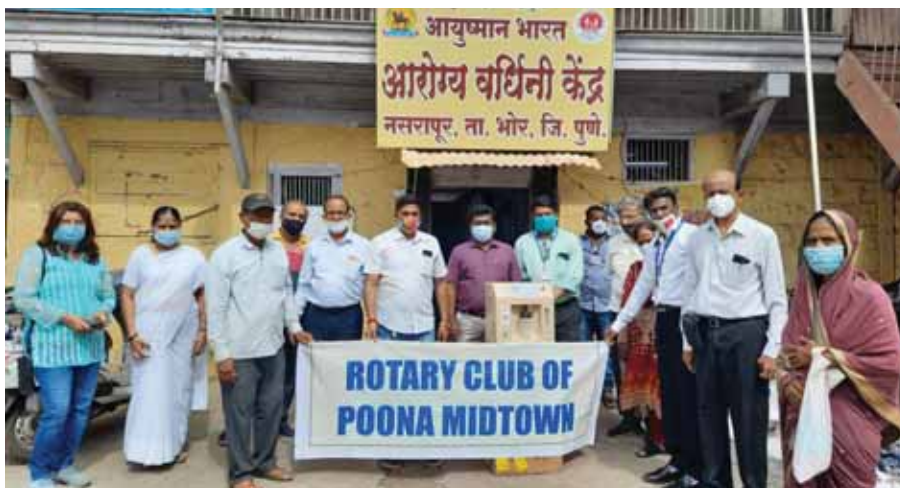
Rotarians handover oxygen concentrators to a rural PHC.

To meet the rising demand of oxygen supply in rural Covid centres near Pune, RC Poona Midtown, RID 3131, donated 10 oxygen concentrators to PHCs in Patas, Bhigwan, Nasarapur, Velhe, Manchar, Ambi, Pusegaon, Malvan and Vengurla villages in Maharashtra. The funds for this project were raised by the club and through individual donors.■