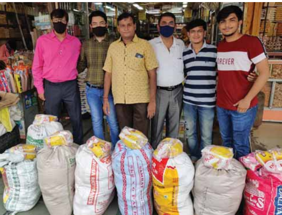
Club members ready to distribute ration kits to Covid-affected families.

received over 600 registrations from various parts of the world including Australia, Sweden, Denmark, USA, UAE and Saudi Arabia, in addition to different parts of India. She presented a step-by-step demo to make various flavoured ice creams and provided tips to enhance the output. The Anns team is planning to organise similar programmes, including workshops to enhance skills of underprivileged women, as part of their vocational service activities.