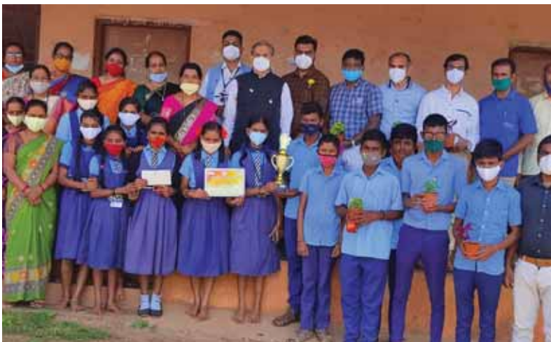
Rotarians along with students and teachers.