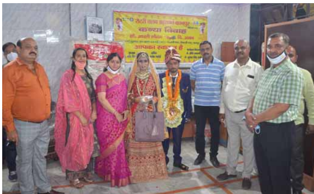
Rotarians sponsor the marriage of an underprivileged bride.

Rotarians from Rotary Club of Brahmavarat Kanpur, RID 3110, performed the kanyadaan of an underprivileged girl whose family could not afford a wedding