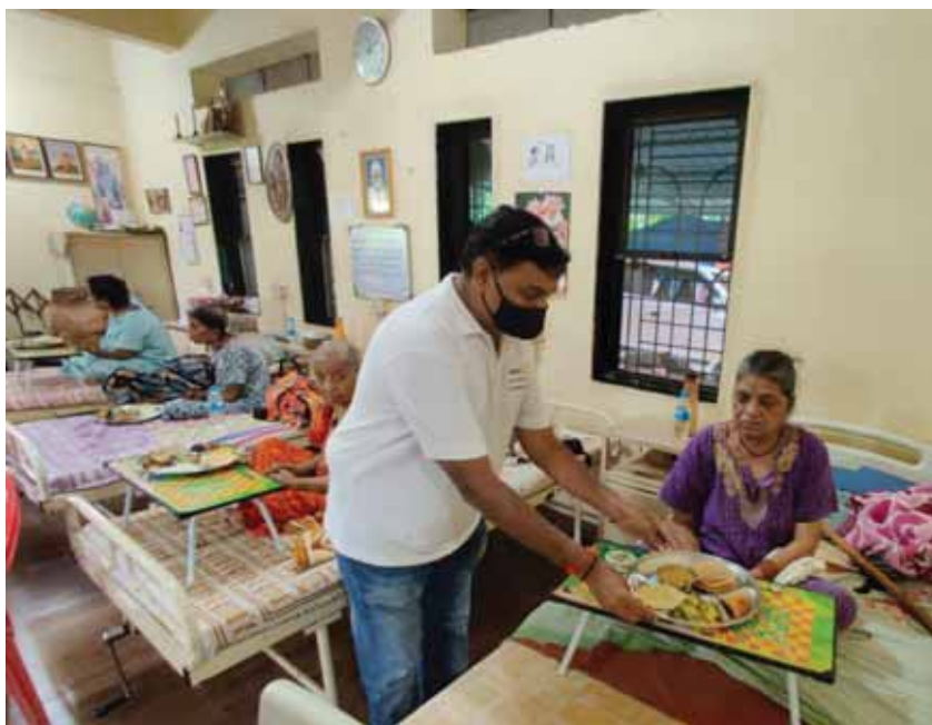
Rotarians serve food to senior citizens at an old age home.

RC Panvel Elite and RAC Belgaum South initiated a mega online Tokyo Olympics Awareness drive named 'Cheer for India'. One of the main goals of this video was to get Indians to cheer for our athletes so that they receive the recognition and viewership that they so thoroughly deserve. The video was