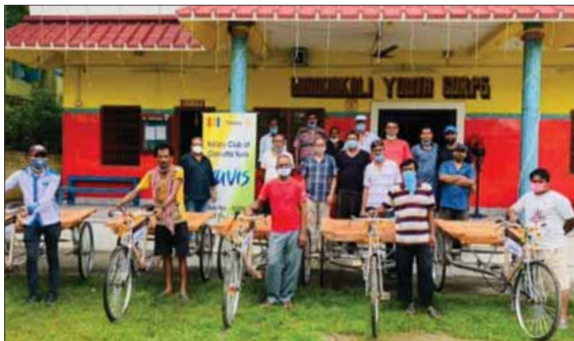
Rickshaw trolleys donated to five beneficiaries.

Twenty-five low-cost toilets were constructed and handed over to the beneficiaries at Chakdah village under Project Suchita at a project cost of ₹3.12 lakh. A polio vaccination drive was held at ward-8 of Kolkata Municipality in which over 50 infants were given oral doses. ■