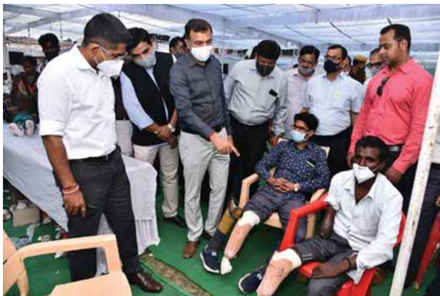
Beneficiaries at the limb fitment camp.

R C Kota, RID 3054, organised a five-day artificial limb fitment camp in which over 2,200 amputees were benefited. Organised at a cost of ₹2 crore in association with