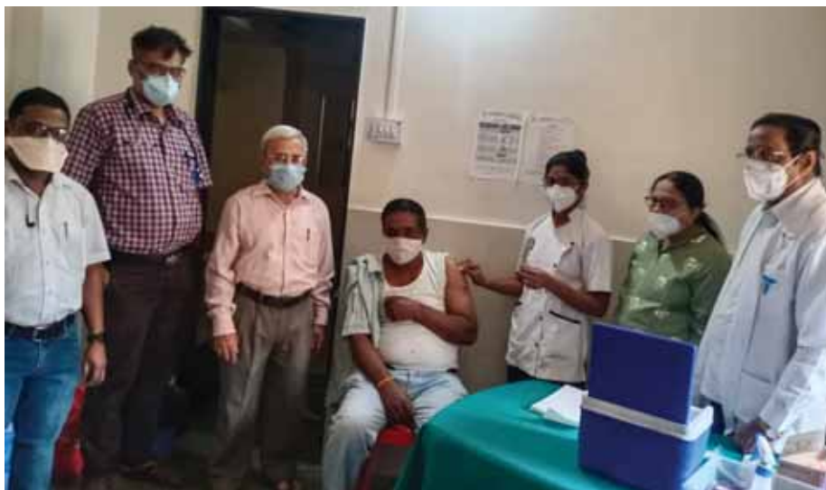
A vaccination camp in progress.

Rotary Club of Wai, RID 3132, conducted a hygiene awareness and training workshop for the medical staff to protect themselves against Covid at the Geetanjali Hospital, Wai. The project aims to help the