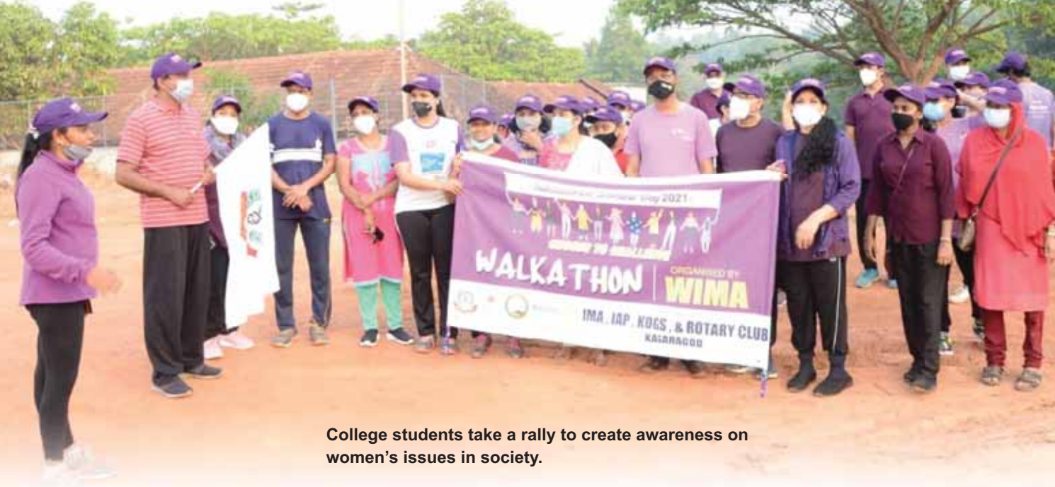
College students take a rally to create awareness on women's issues in society.