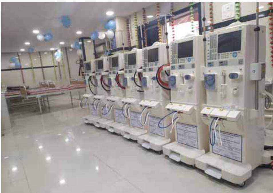
New dialysis machines at the Gurunanak Dharmarth Hospital, Surat.

R otary Club of Surat, RID 3060, has started a dialysis centre at the Gurunanak Dharmarth