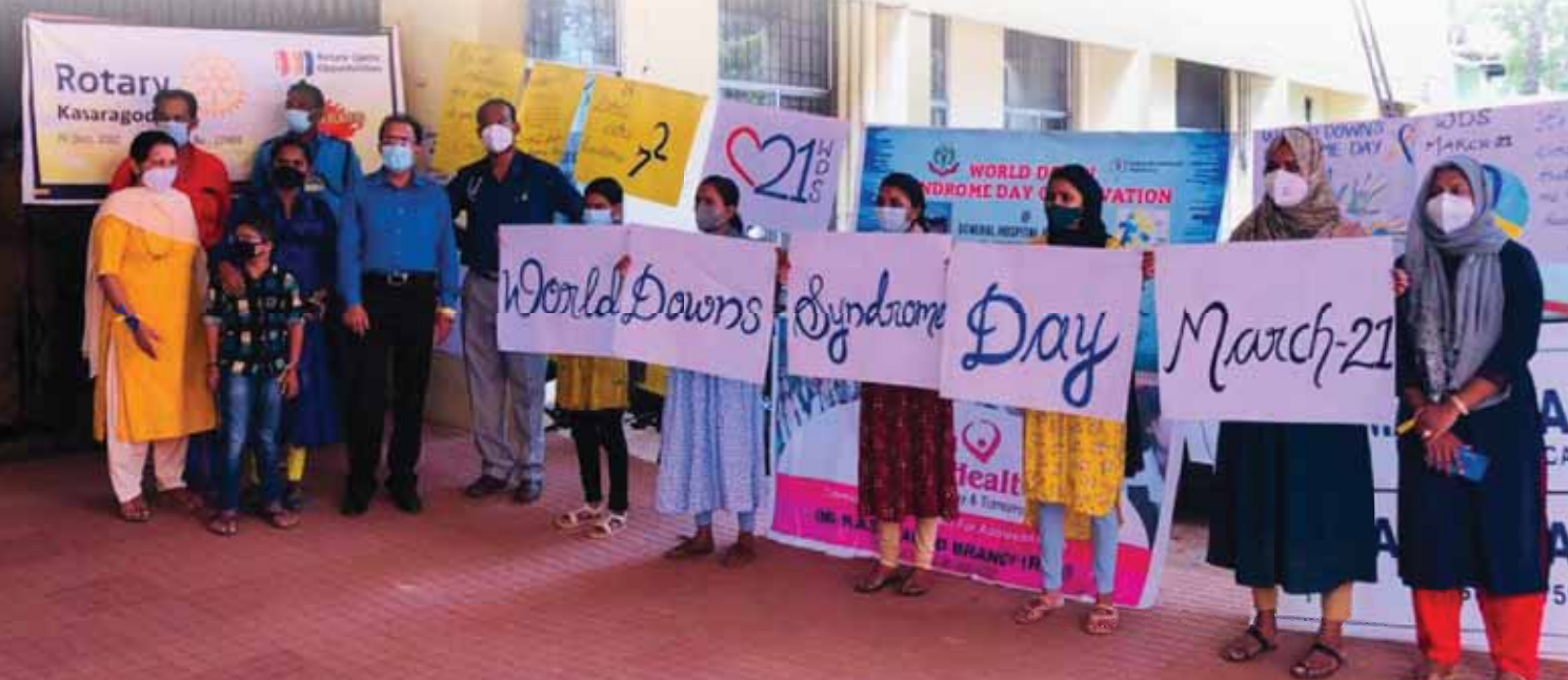
A poster exhibition to mark World Down Syndrome Day.

(Mar 21), followed by an event in which physicians and experts spoke on the subject. This programme was done in partnership with the Indian Academy of Paediatrics, Kasaragod, and the Indian Medical Association, Kasaragod. ■