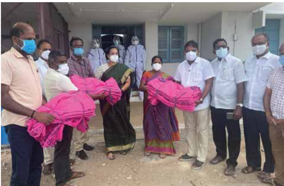
Bedsheets being given to the government hospital in Dharapuram.