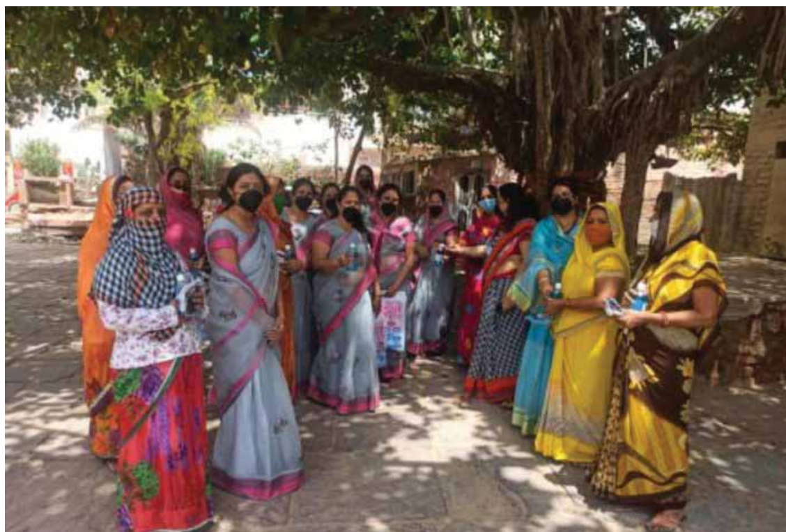
Rotarians with the anganwadi workers.

get the news out, but to normalise the experience and influence others to take the jabs,” says the club president.”■