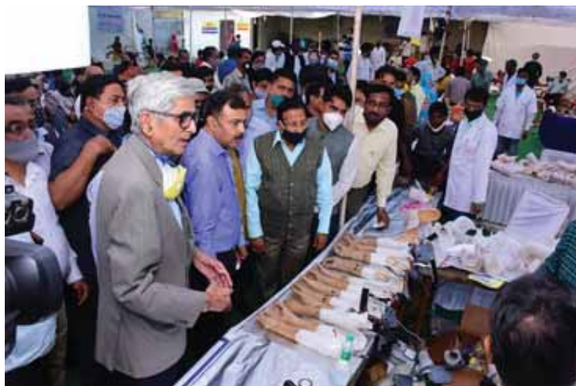
LN-4 hands and prosthetic feet on display.

The camp saw the fitment of 245 prosthetic feet and 56 LN-4 hands, and the distribution of 148 callipers, 215 crutches, 858 hearing aid machines, 335 wheelchairs and 343 tricycles. Food and lodging expenses of the beneficiaries and caregivers were also taken care of by the club. ■