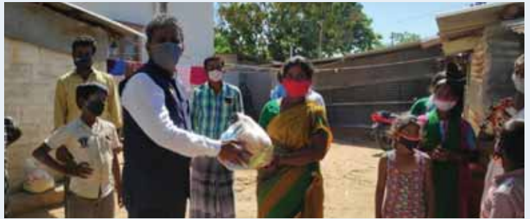
Grocery kits being provided to needy families on the outskirts of Coimbatore.