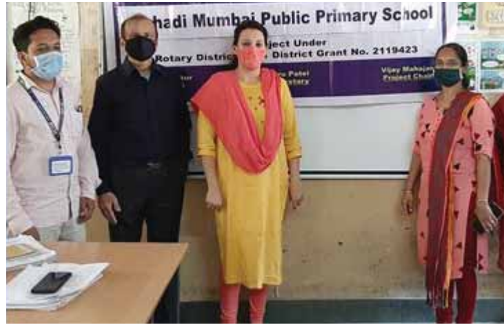
RC Mumbai West Coast members after installing e-learning facility in one of the schools.