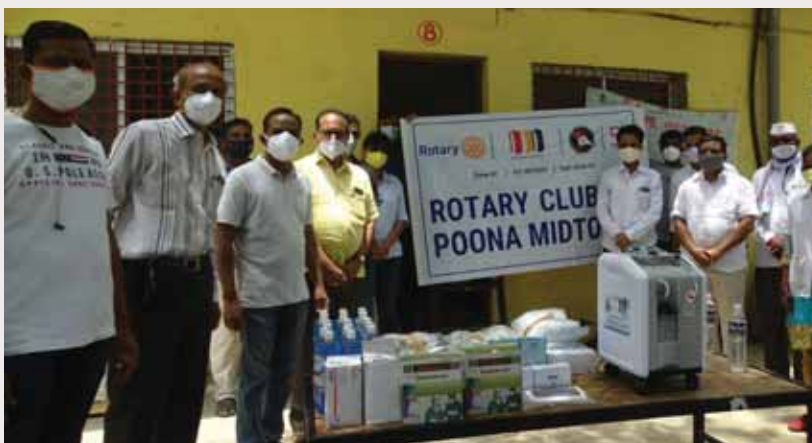
An oxygen concentrator and other Covid kits being given to a PHC near Pune.

The 51-year-old club had distributed PPE kits, masks and sanitisers to hospital staff during the earlier corona wave last year. ■