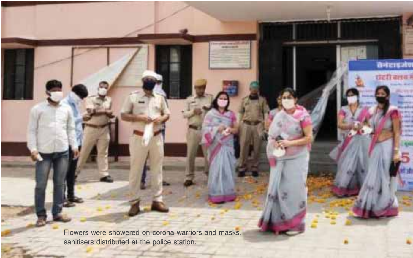
Flowers were showered on corona warriors and masks, sanitisers distributed at the police station.