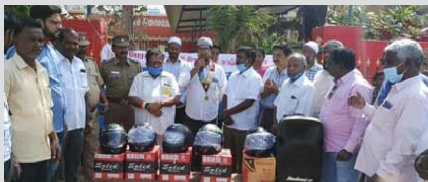
Helmets being donated as part of Road Safety Awareness programme.