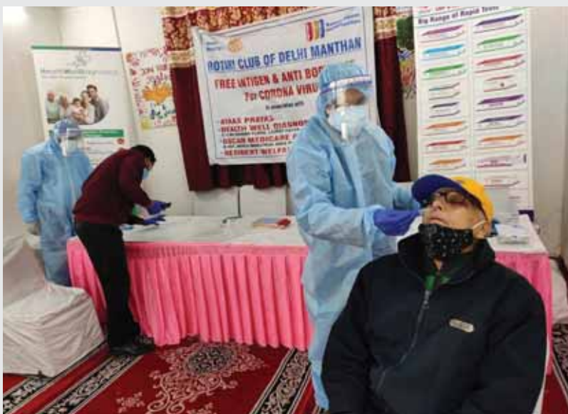
A corona testing camp at Jasola Vihar in Delhi.