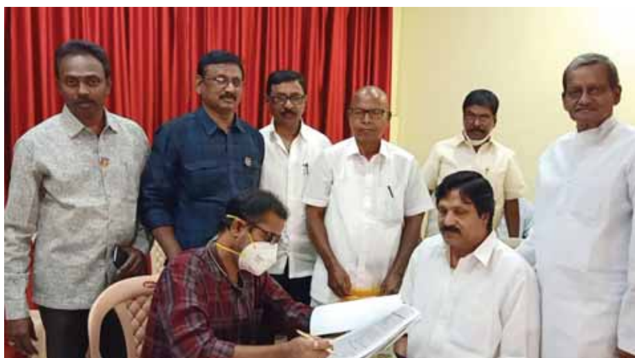
Cardiac screening camp in progress.

The club conducted essay and sports competitions for girl students on National Girl Child Day (Jan 24). The winners and participants were recognised with gifts and certificates. ■