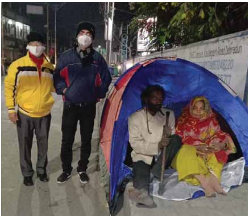
Rotarians donate a tent to a street dweller family.

In another initiative, the club provided 2,000 disposable hygiene bags to be placed