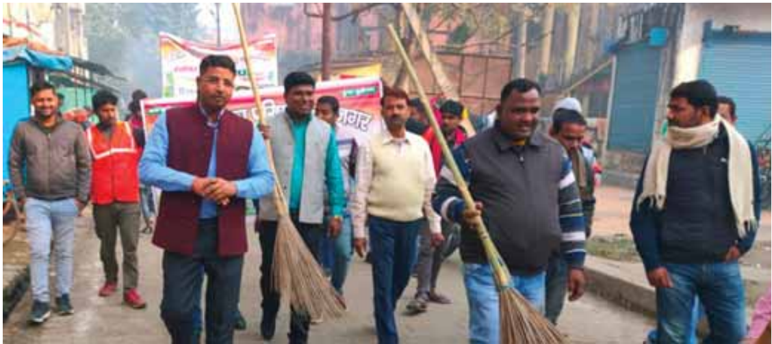
Club members on a cleanliness drive.

A cleanliness drive was carried out by RC Kushinagar, RID 3120, in association with the Municipality of Kushinagar. Members of the club and employees of the Municipality Kushinagar swept, collected and disposed wet and dry waste separately. The club spent a total of ₹5,000 for this drive.