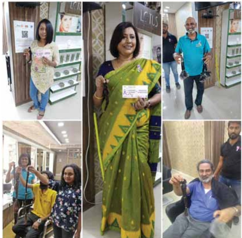
Donors give their hair for making wigs for cancer patients.