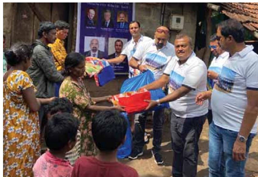
Blankets being distributed to the underprivileged.

To protect the underprivileged from the biting winter chill, the Rotarians distributed blankets to the tribal community at the Herur village.