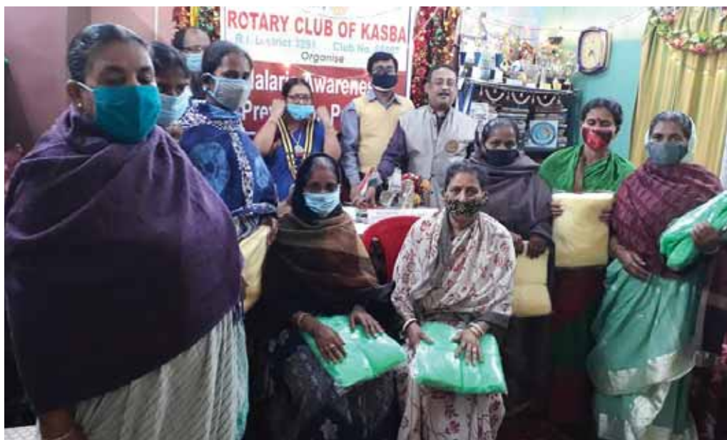
Villagers with mosquito nets at the awareness event.

Speaking at a malaria awareness and prevention programme organised by RC Kasba, RID