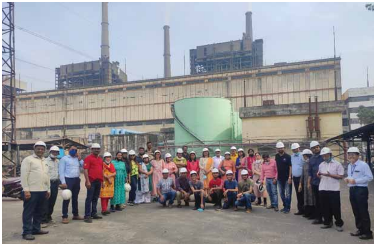
Club members at the thermal power station.

Rotary Club of Chandrapur, RID 3030, invited business leaders in the city for a summit and honoured them