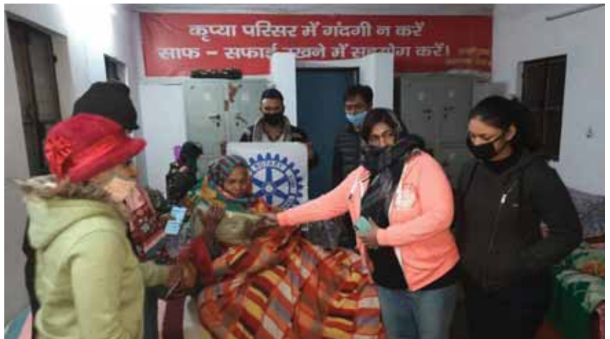
Rotarians gifting winter clothing to an elderly.

Winter jackets and blankets were also given to security guards on night duty at factories, schools and gated communities. Also, caretakers of Kali Mata temple, Lal Bagh, Moradabad, and street vendors were some of the