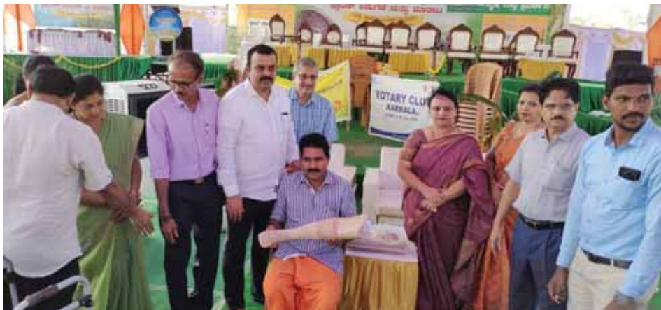
An artificial limb being given to a physically-challenged man.

The club, along with RC Karkala Rockcity, set up 16 polio immunisation booths in the city on the NID in January and sponsored food and beverages for the volunteers manning the booths. ■