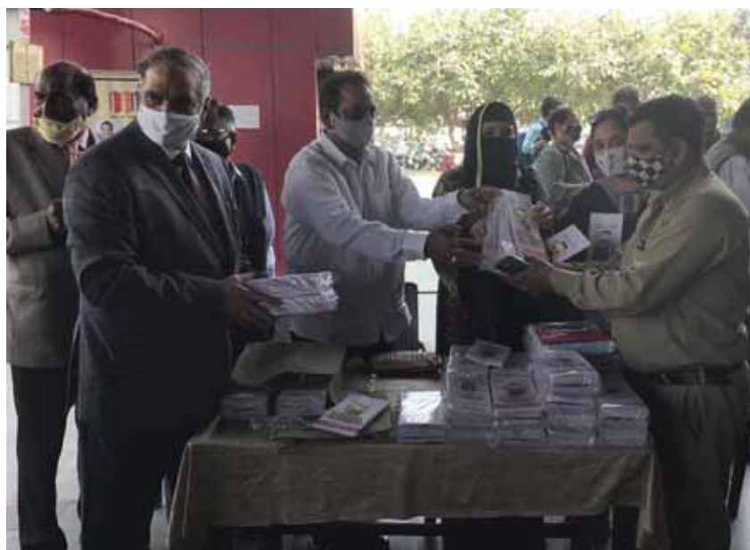
Hygienic vomit bags being given by the club members to transport authorities.