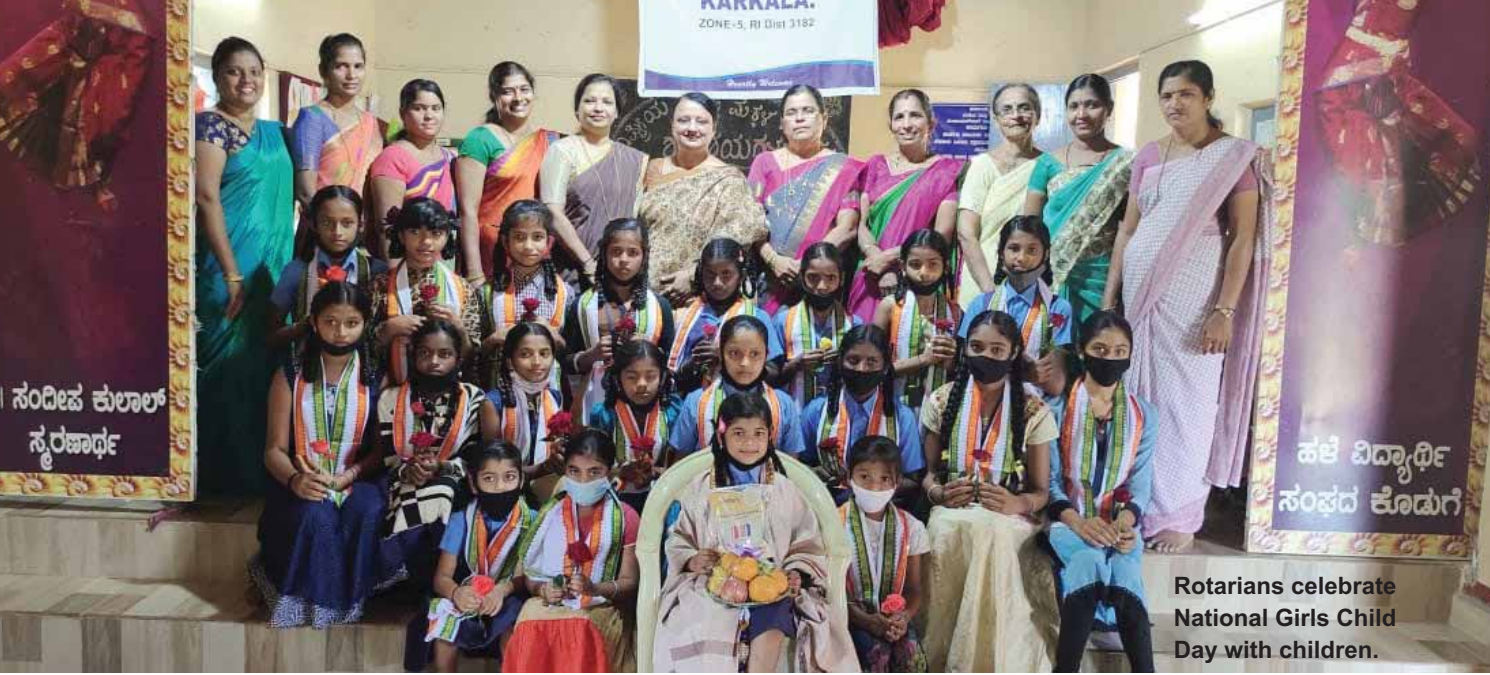
Rotarians celebrate National Girls Child Day with children.