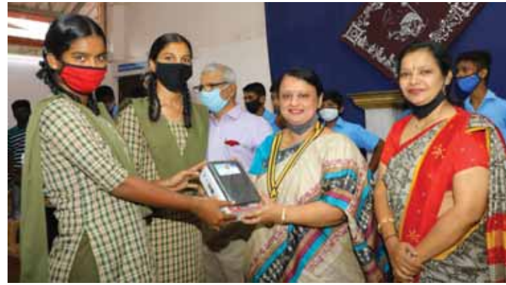
Students receive tabs from club members.

students of the Sundra Purinaka Government High School in Karkala. The devices will help these students, who otherwise do not have access to mobile phone or computers, to follow their lessons easily.