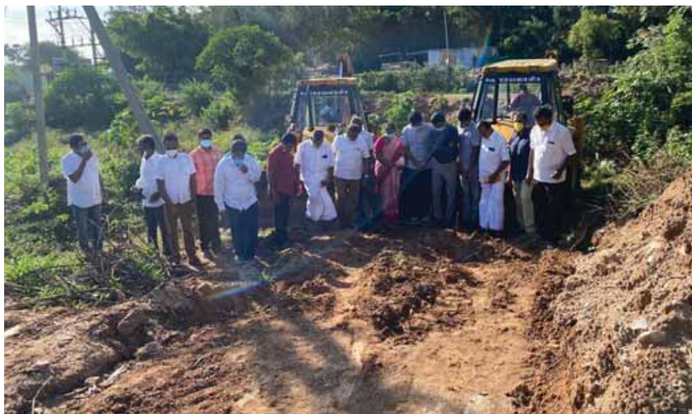
RC Tirupur Thirumuruganpoondi members and district officials inspecting the lake restoration work.

In a landmark project under Rotary's focus area of water conservation and sanitation, RC Tirupur Thirumuruganpoondi, RID 3202, desilted Rasathal Kulam (lake) and its 5km canal from Kaniyampoondi check dam to the lake in 48 days at a cost of ₹5.5 lakh. The lake restoration project would benefit over 10,000 families living in and around Rakkiapalayam village as the waterbody is the main source for drinking water and other needs in this rural area coming under Thirumuruganpoondi town panchayat.