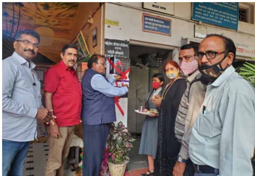
Rotarians install an automatic hand sanitiser facility in a school.

The club installed an automatic hand sanitiser unit at the Priyadarshini Kanya Vidyalaya school in Ghugus and the Rotarians delivered an awareness talk on Covid and how students can safeguard themselves from contracting the virus. The club has installed an Interact club in the school. ■