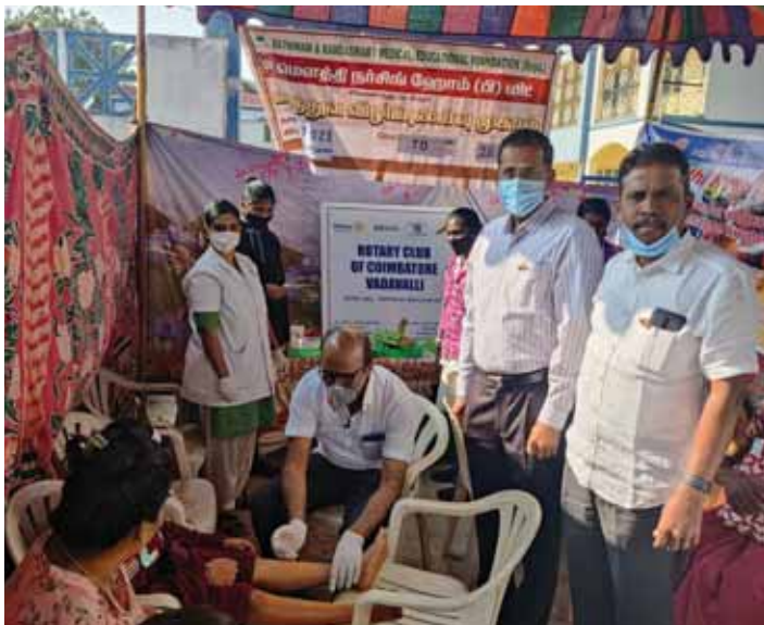
Medical assistance being given to devotees.