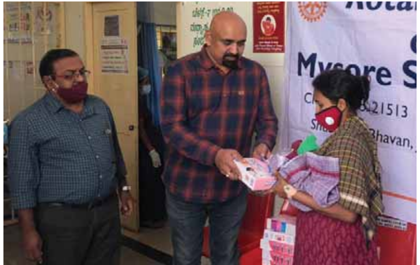
Hygiene kits being given to young mothers.