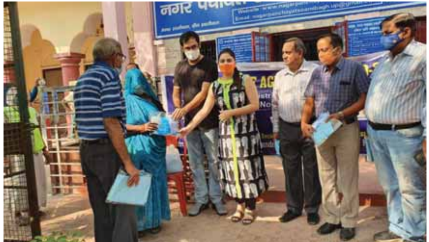
PPE kits being distributed to frontline warriors.

The awardees were individually honoured by with certificate of appreciation in recognition of their service to society and their achievement. They were chosen after an extensive survey conducted by the club following the norms and guidelines under Rotary's TEACH initiative. "The survey to choose the best teachers includes questions to be answered by the students, headmasters and the teachers themselves, ensuring that there is no bias and favouritism