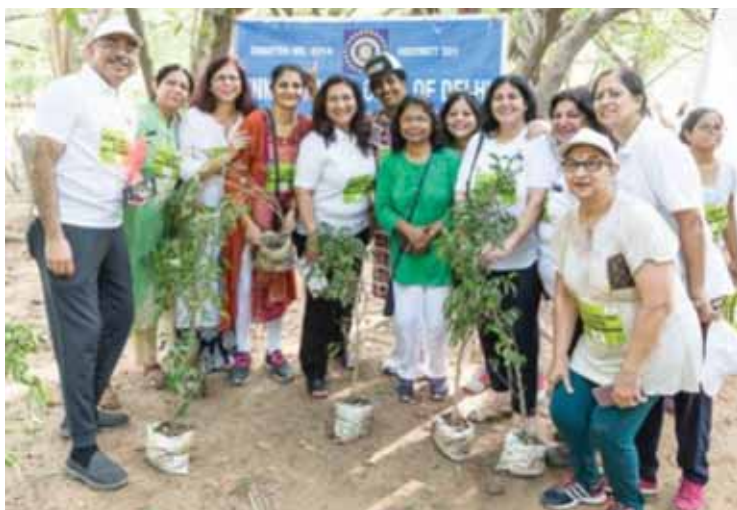
Rotarians at a green drive.

A free health camp for women was organised at the Malhotra Maternity Nursing Home. Close to 100 women received consultation at the camp. All tests were carried out at discounted rates and social distancing norms were strictly followed at the camp. ■