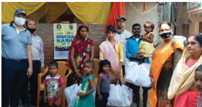
Children being adopted with the aim to provide them with good food and nutritious supplements.

Currently, the club is training 12 women at the centre and plans to enrol more women in the future. Women with basic stitching knowledge or a passion for stitching can approach the centre directly. The project cost has so far touched ₹90,000.■