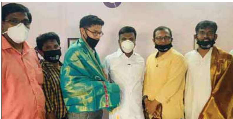
Auditors being feted on Chartered Accountants Day.

Immunity medicines against coronavirus were given to Rotarians and their family members. Over 300 people were given homeopathic pills, Arsenicum Album 30, as a preventive step against the pandemic. The various anti-Covid campaigns and relief work enhanced the public image of Rotary in and around Pattukkottai. ■