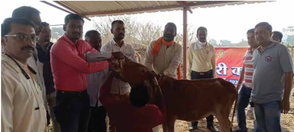
Rotarians feed a cow at a veterinary medical camp.

RC Manmad, RID 3030, organised a medical camp for cattle. Veterinary doctors treated the animals for illnesses and recommended healthy feed for