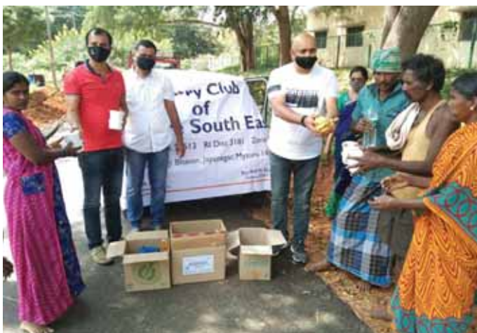
Food packets being distributed by the club.