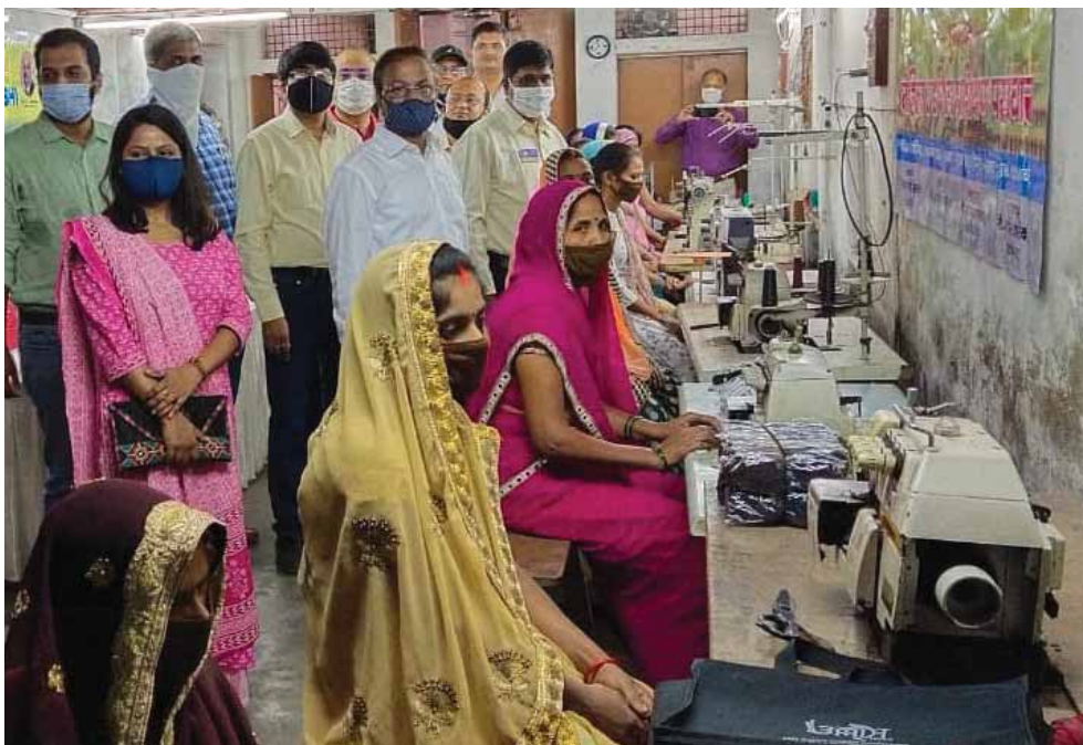
Women being trained in tailoring at the Entrepreneur Centre, Kashi.

R C Kashi Varanasi, RID 3120, is trying to change the lives of underprivileged and malnourished children in the city. Recently the club adopted five children below age six, suffering from malnourishment. The joint