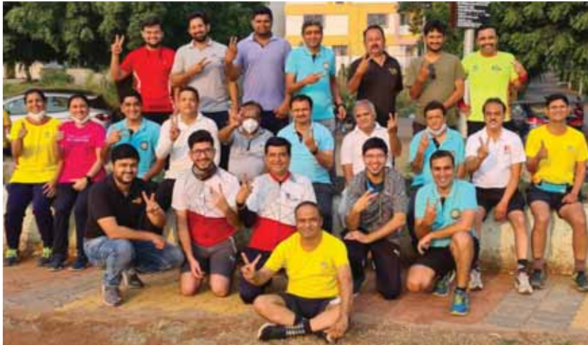
Rotarians during the marathon.