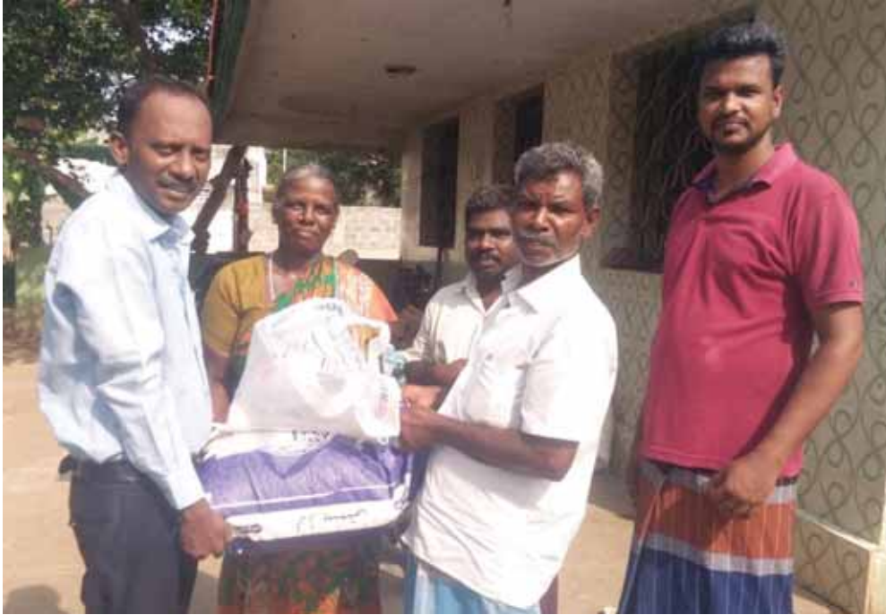
Grocery packs and other edible items being given to families in nearby villages.

During the lockdown to provide relief to needy families who had lost their livelihoods, RC Vellore Cosmos, RID 3231, distributed rice bags, grocery kits and gave mass feeding ( annadhanam ) in nearby villages.