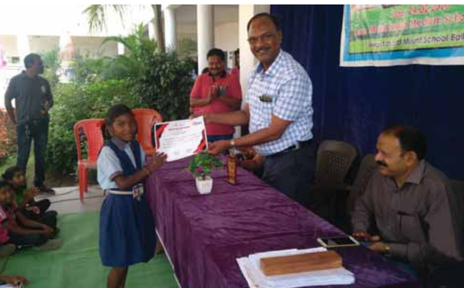
A winner receives a certificate.

All the winners were given certificates and medals sponsored by the club.■