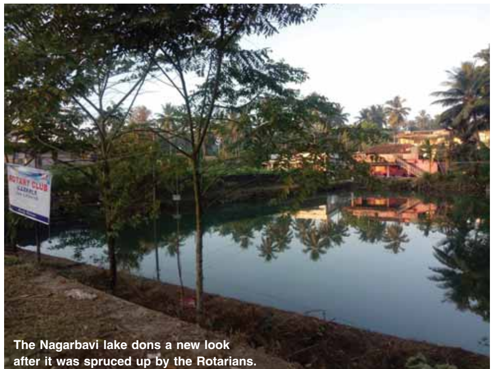
The Nagarbavi lake dons a new look after it was spruced up by the Rotarians.

organisations conducted a blood camp in a local school. Thirty units of blood was collected.■