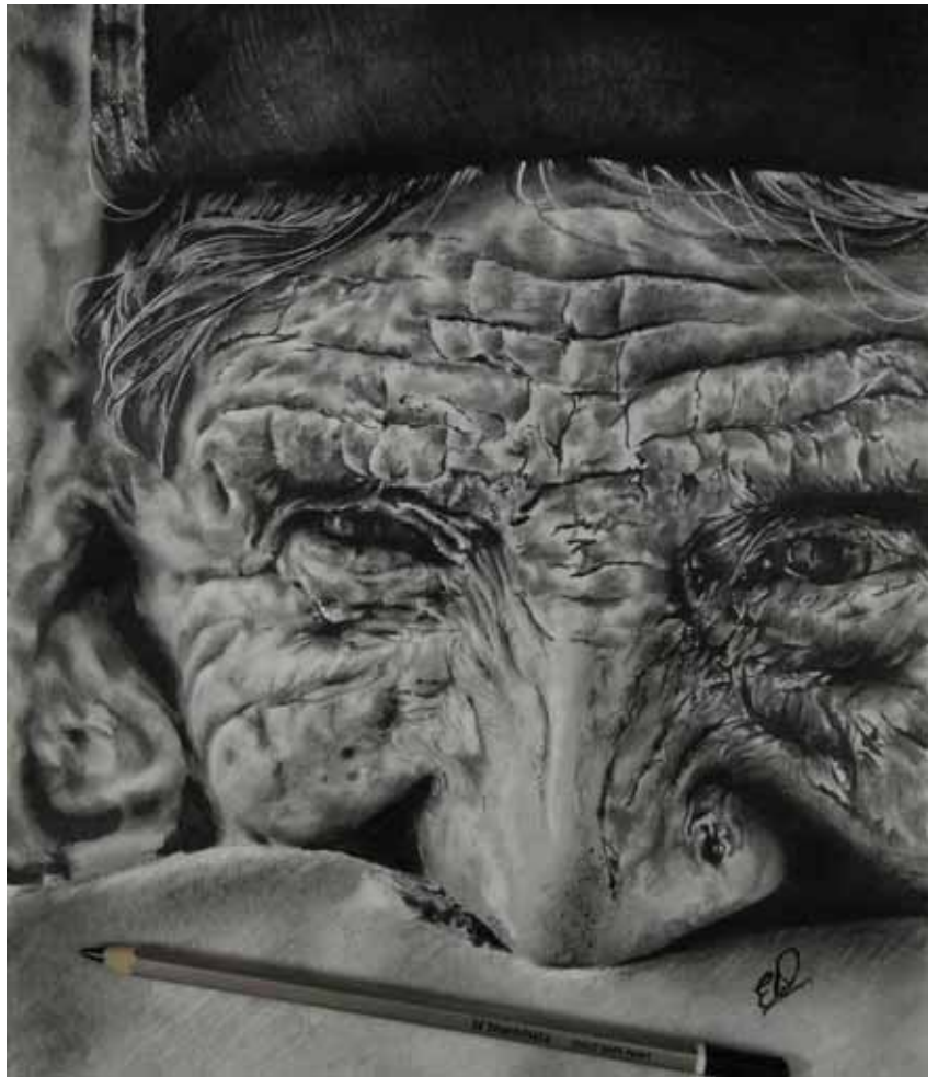
Above & below: Art work submitted by the RYLA participants.