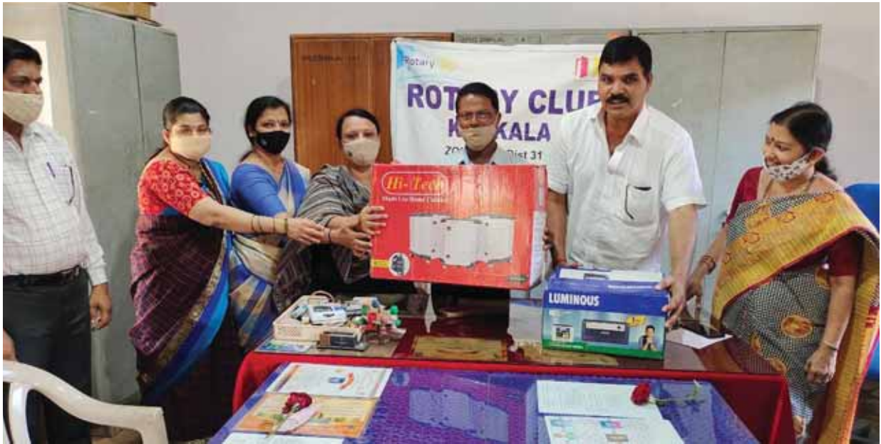
An inverter system being handed over to a government college.

R otary Club of Karkala, RID 3182, under its district project, 'Clean India Green India', has been implementing various cleanliness activities across the city. The club members recently cleared the wild weeds covering the Nagarbavi lake in the heart of the city. Earlier the club members targeted 12 bus stops in the city, cleaning them all, in association with the Hindu Rudra Bhoomi Samathi Kariakallu and PML Pest Man.