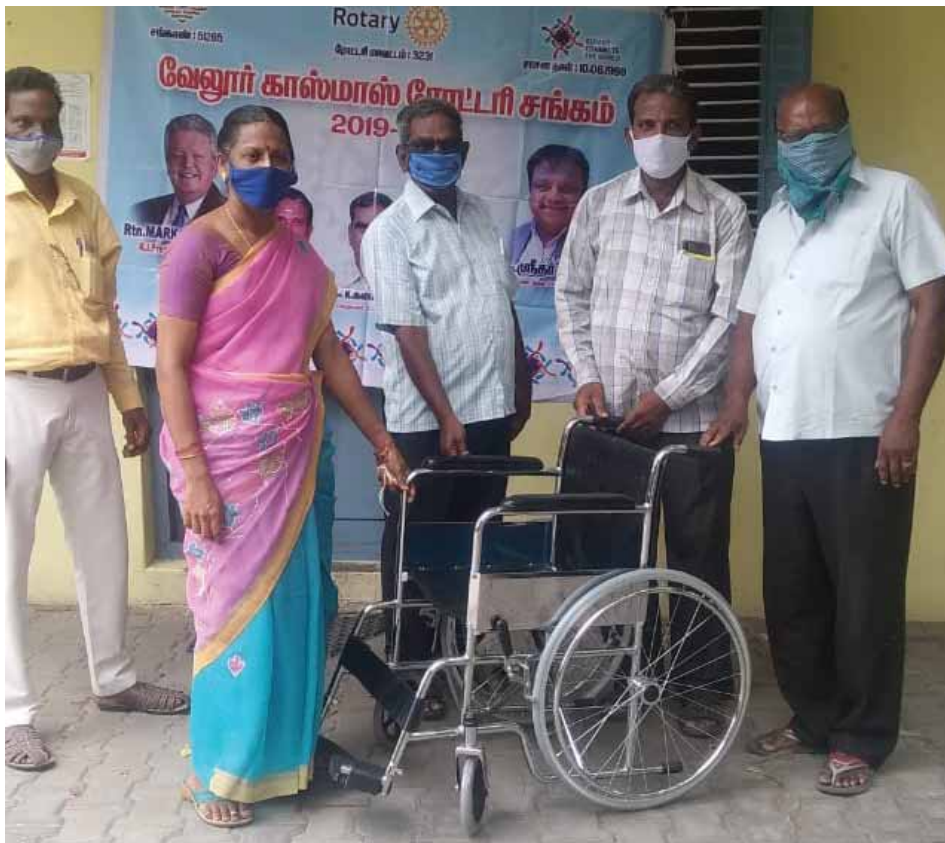
Wheelchair being donated to warden of a special home for women and children.

The club members donated ₹40,000 to the Covid relief fund being collected by the district which was handed over to the RISAO, New Delhi. The South Asia office, in turn, donates all the collected amounts from the RI districts to the PM CARES Fund.■