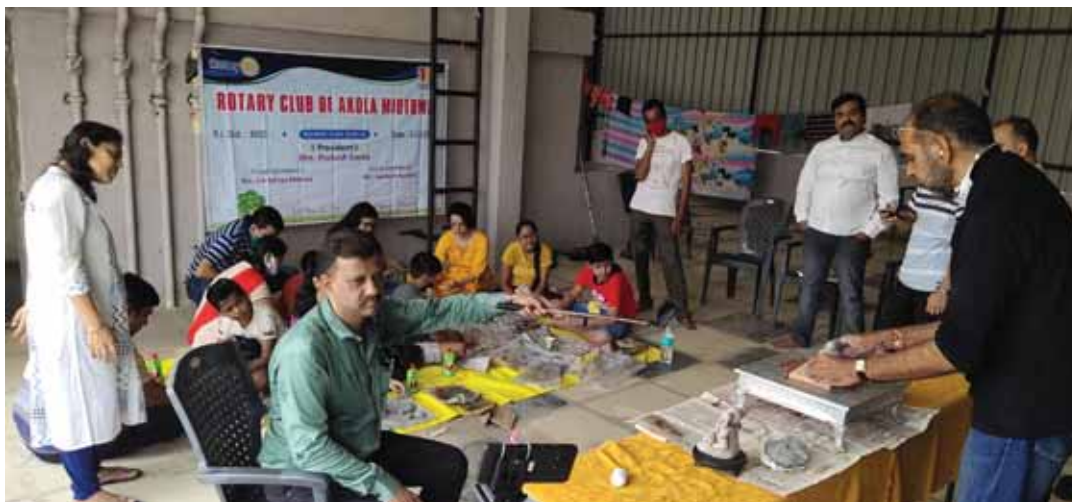
An online Ganesh idol-making workshop in progress.

A coagulation meter was installed at the pathology lab of the Dr Hedgewar Hospital and Research Centre by RC Akola Midtown, RID 3030, to provide speedy and accurate test results for patients at a nominal charge.