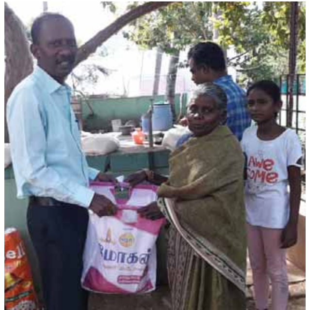
Rice packages being given to needy families.

All the eleven clubs in Vellore joined hands to organise a job mela at the Voorhees College in March. Around 2,000 students attended the camp, of them 850 were selected by 50 companies. The selected students were given offer letters by the recruiters.