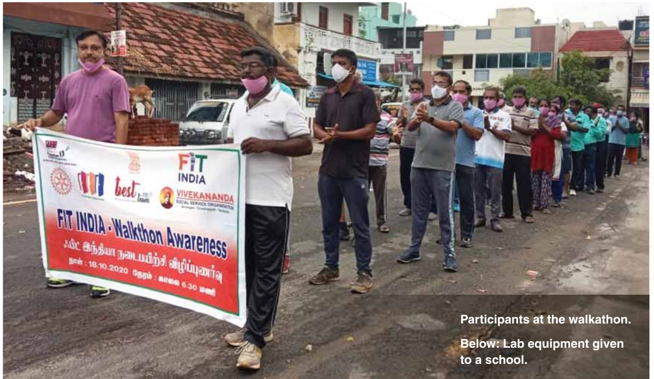
Participants at the walkathon.