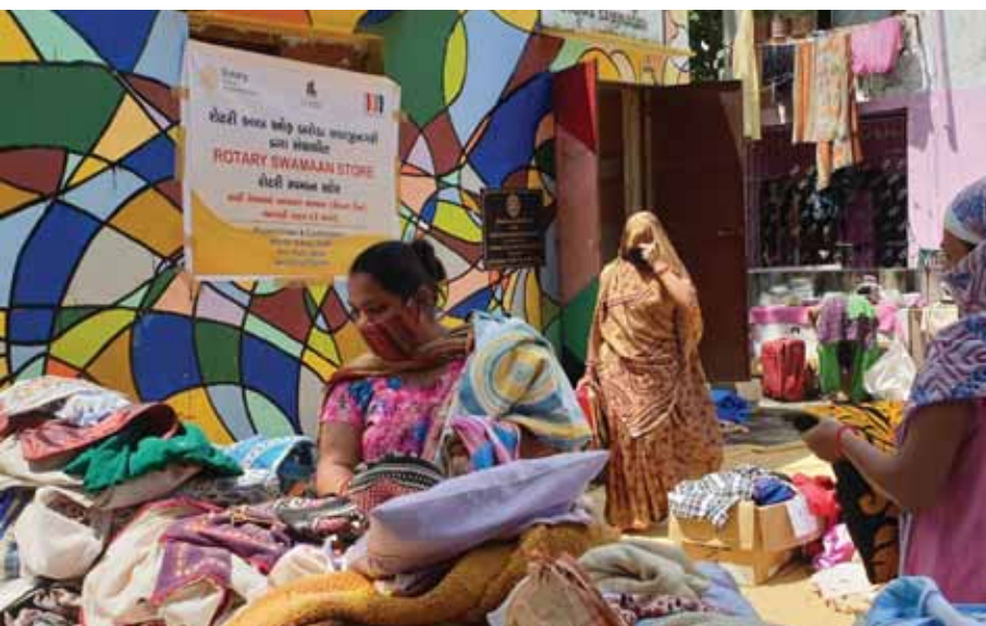
Customers visiting a Rotary Swamaan store.

Similarly, many other clubs in RID 3060 have opened their stores around the district and have pledged to continue them as permanent projects. ■