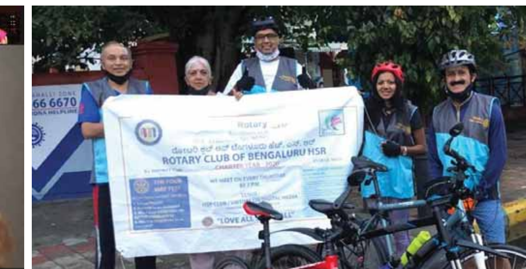
Left: A cyclothon organised by the IFCR at the Lalbagh, Bengaluru, to commemorate World Polio Day (Oct 24).