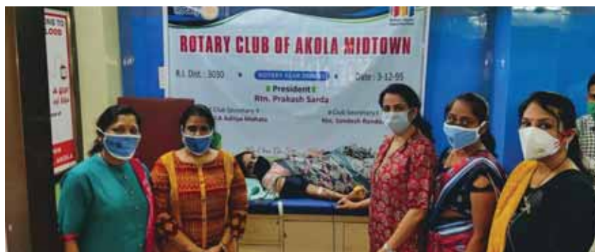
A blood donation camp to mark the charter day.