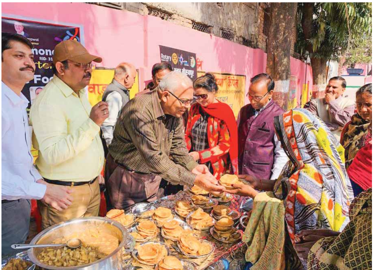
Rotarians distributing food to needy families to mark the fourth Charter Day of the club.

Colourful posters and banners were installed at prominent spots and intersections in the town to mark the centennial year of Rotary