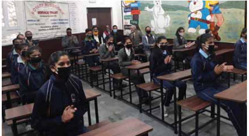
Students with the new sets of benches.