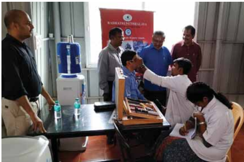
An eye screening camp at the City Union Bank.

As part of its ongoing project, RC Madras Chenna Patna, RID 3232, organised an eye check-up camp in partnership