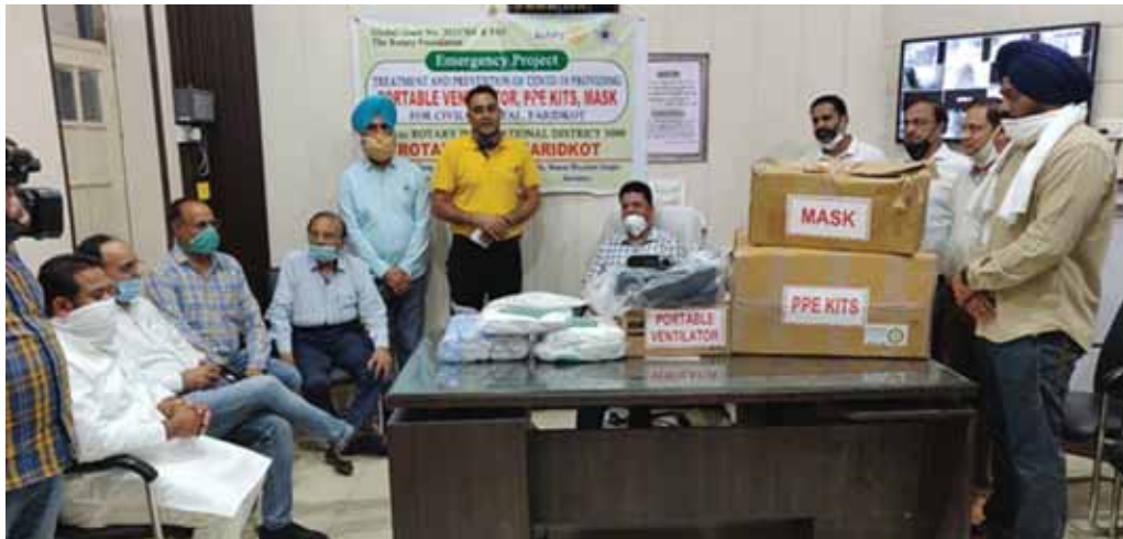
PPE kits and masks are being donated to the government hospital.

Rotary Club of Faridkot, RID 3090, gave a ventilator to the Government Civil Hospital in Faridkot. The Rotarians provided large number of PPE kits and masks to doctors and frontline staff in the hospital. Hand sanitisers