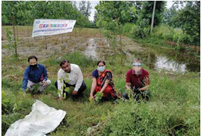
Rotarians on a plantation drive.