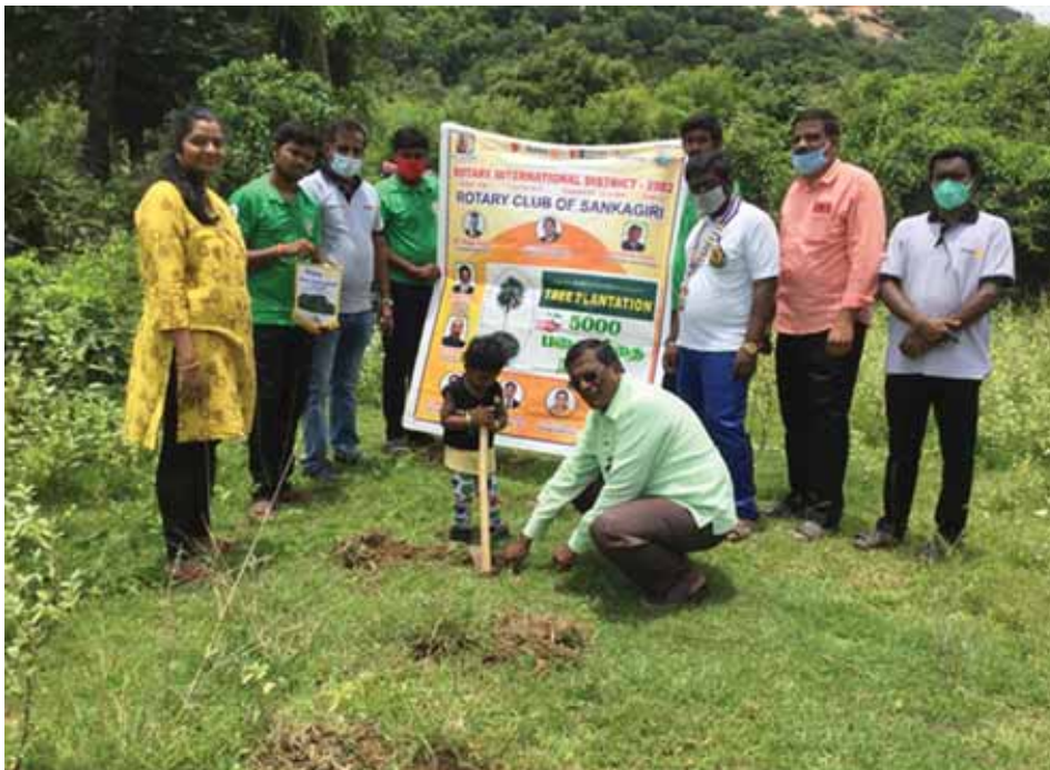
Rotarians on a greening mission.

A blood donation camp organised jointly with the Mohan Kumaramangalam Hospital helped collect 600 units of blood. ■