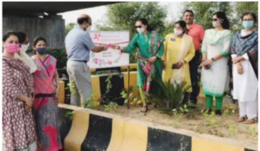
Empty blocks under the Veer Durgadas Rathore flyover were converted into green hubs.

The club partnered with the Rotaract Club of IIT Jodhpur to hold a medical camp in Jheepasani village. "The aim of the camp is to create awareness among the villagers who have no access to basic healthcare or knowledge about the diseases. Apart from the health camp, an eye check-up and a blood donation camp were also organised," said Rajshree.