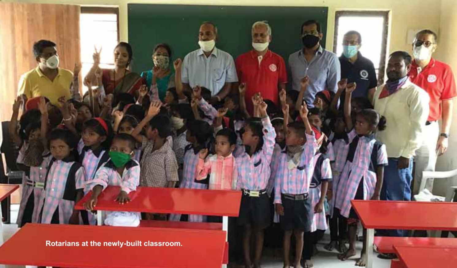
Rotarians at the newly-built classroom.

with proper sanitation and hygiene facilities the new classroom and toilet block were handed over to the villagers. ■