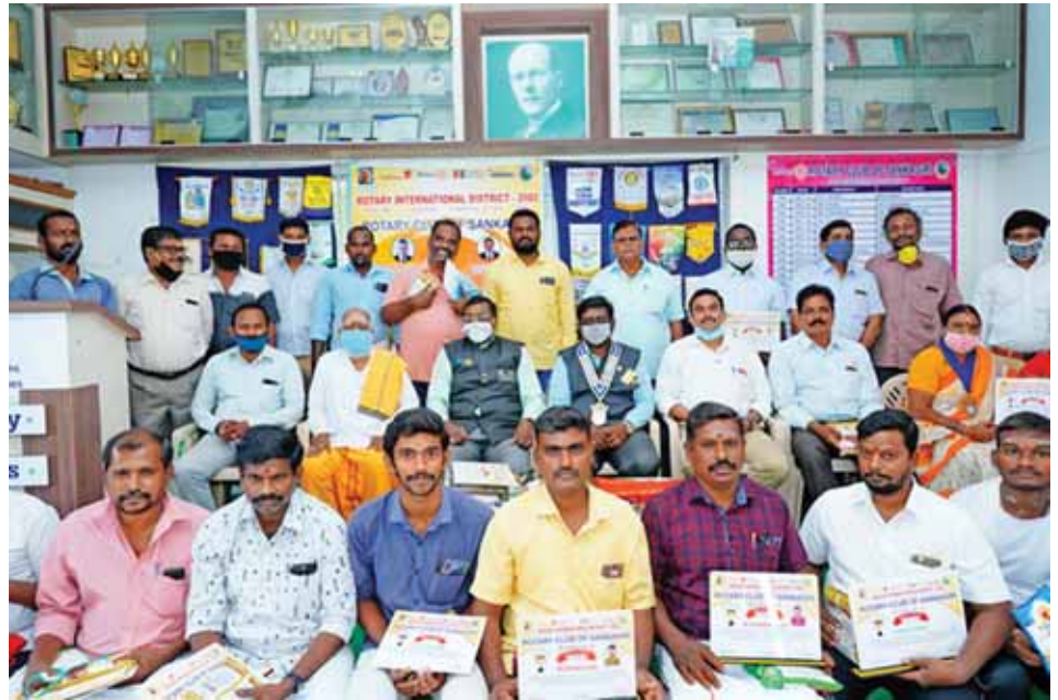
Frontline warriors and volunteers being felicitated.

The club honoured frontline staff and volunteers for distributing Covid protective gears such as masks and sanitisers among the public. The RCC members were also felicitated for distributing a herbal concoction that is believed to improve the immune system and protect people from contracting coronavirus.