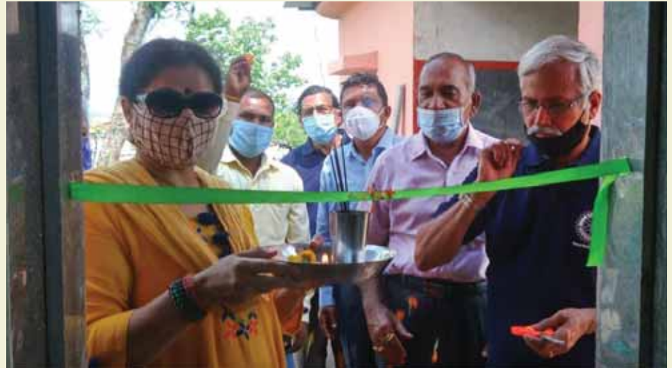
New building being inaugurated.

When members of RC Pune Grapecity visited the village, they decided to construct a new classroom and a gender-segregated toilet block at the school. A committee was formed under the chairmanship of