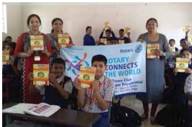
Students with Rotary notebooks having the Four-Way Test on wrappers.