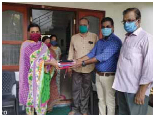
Covid gears being donated to residents.

The Rotarians of RC Badagara Central, RID 3202, distributed face masks and sanitisers to the residents of Thuruthiyil, a locality in Vadagara. They organised an awareness programme for the people to sensitise them about Covid-19 and why it is important to use face masks and sanitisers and maintain physical distancing as compulsory protocols to