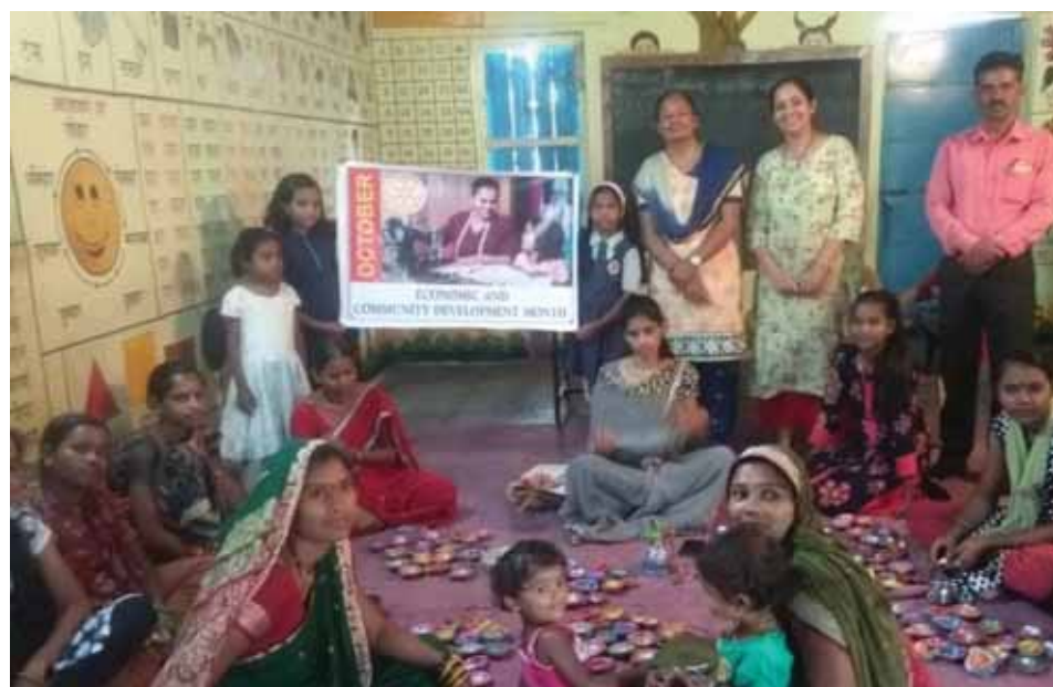
A diya-making workshop for underprivileged women.

With an aim to promote literacy through Asha Kiran Project, the club sponsored the education of 26 children with contributions from its members to this child development programme under TEACH initiative of Rotary India Literacy Mission. The Asha Kiran