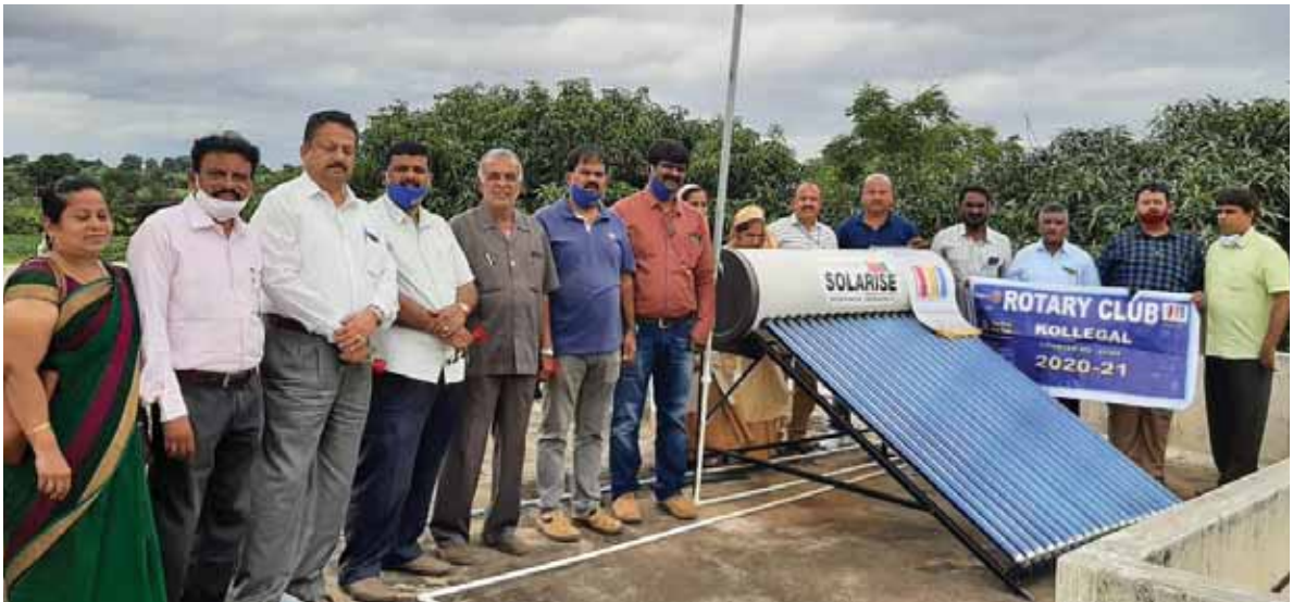
Rotarians at the installation of water heater.

In association with RC Mysore West, RID 3181, RC Kollegal donated a 200-litre solar water heater to Karuna Bhavan Home for the