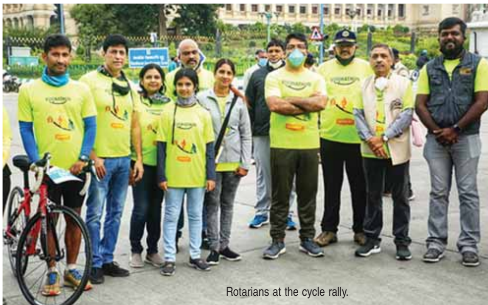
Rotarians at the cycle rally.

Rotary E-club of Bangalore, RID 3190, along with RCs Bangalore Central and Bangalore Brigades organised a cycle rally named Vidhiathon to create awareness on first aid and environment protection.