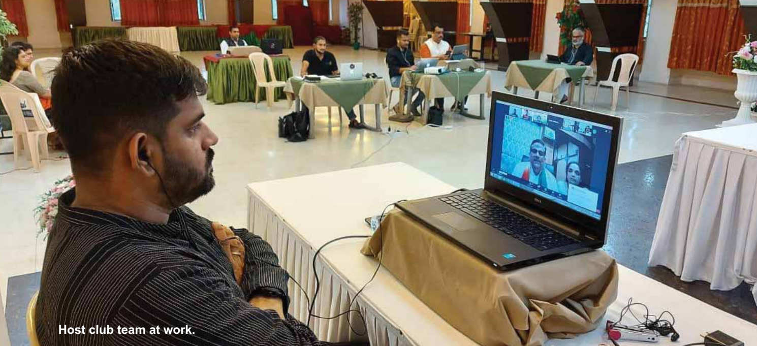
Host club team at work.