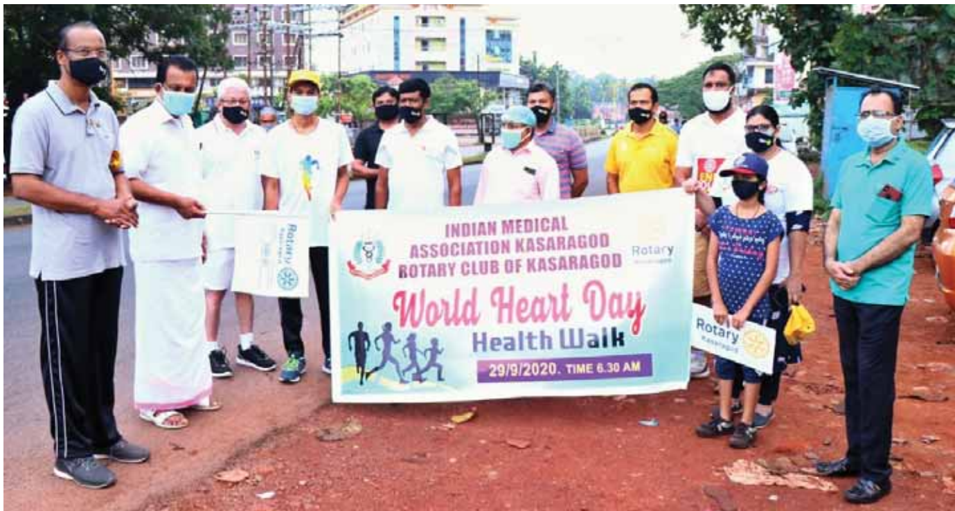
An awareness rally on World Heart Day.