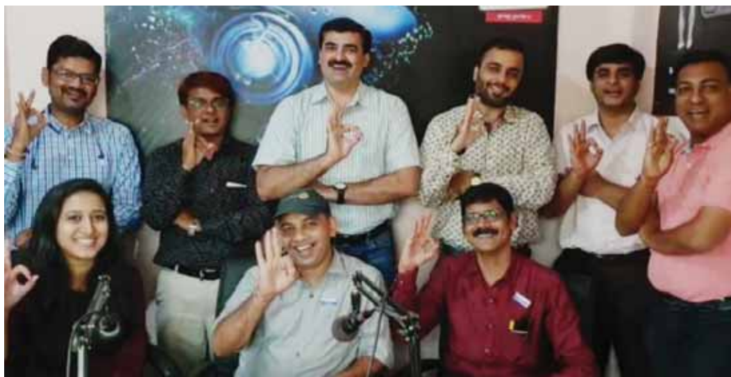
Rotarians and teachers at the FM radio programme.

R C Akola Midtown, RID 3030, is promoting a learning programme for students under the name Masti Ki Patshala hosted by Radio Orange 91.9 FM.