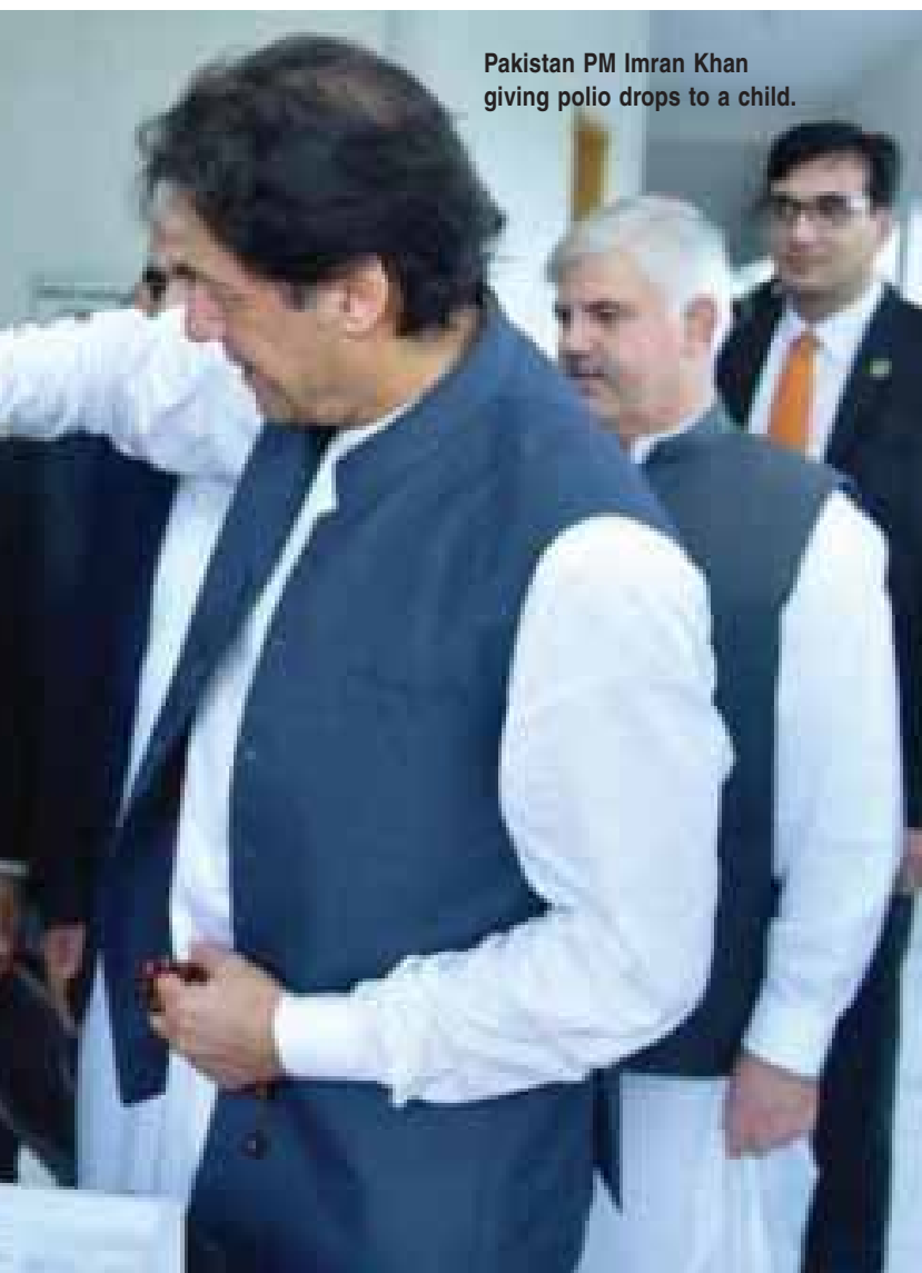
Pakistan PM Imran Khan giving polio drops to a child.

Unless we eradicate polio within 10 years, as many as 200,000 new cases could occur around the world each year. In the past few years, only two countries have reported polio cases caused by the wild poliovirus. But no child anywhere is safe until we've vaccinated every child. Polio mainly affect children under five, and there is no cure. But polio is preventable with a vaccine. Only two countries Pakistan and Afghanistan remain endemic. We have reduced cases by 99.9 per cent since 1998. Until we end polio forever, every child is at risk.