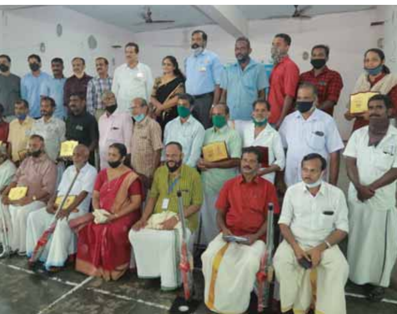
Farmers being honoured by RC Shoranur.