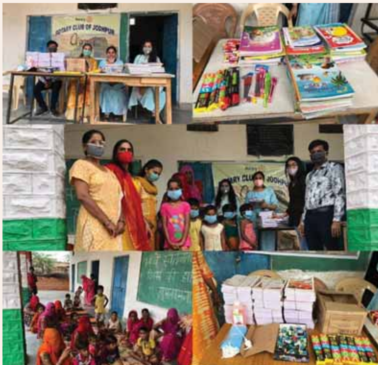
Rotarians presenting stationery kits to school students.

lecture, some of them incognito,” he said. The guest speaker narrated the Chola lineage and answered questions from the Rotarians with interesting anecdotes. ■