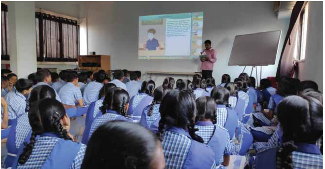
An e-learning facility at the Sarasvati High School.