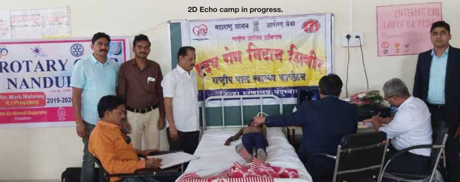
2D Echo camp in progress.

Other projects included a dental camp that benefitted 150 students and a kite-making workshop that enthused 70 children. ■