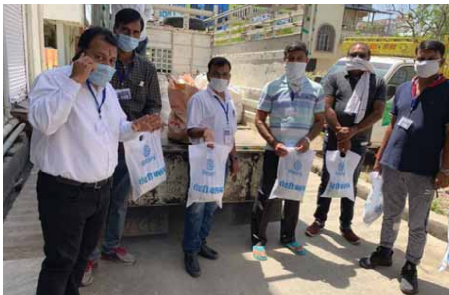
Rotarians with ration kits for distribution.

After the 21-day lockdown was imposed, Rotarians of RC Baran, RID 3053, distributed 100 dry ration kits to needy families in