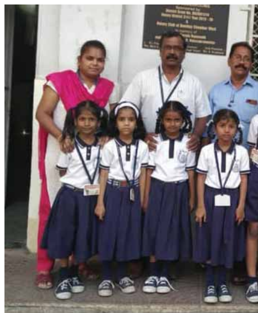
Right: Rotarians speak to schoolchildren about effective waste reduction strategies.