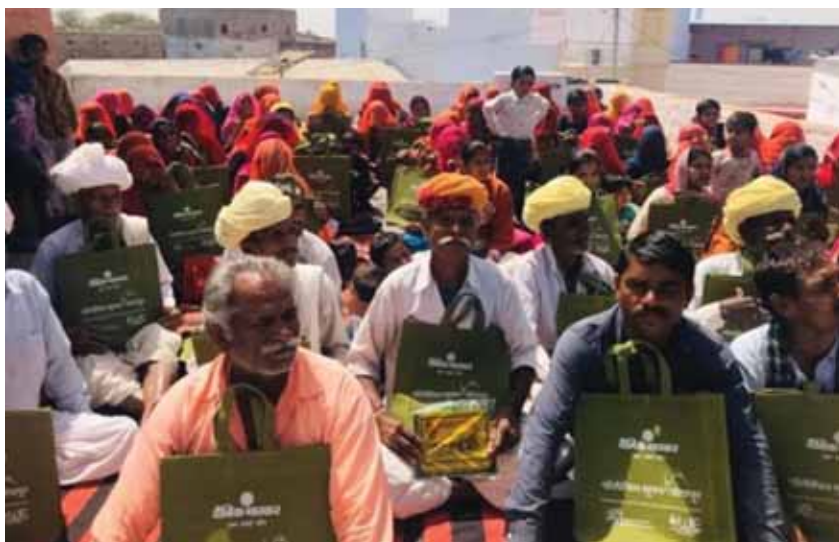
Adults at the newly inaugurated Swabhimaan Centre.