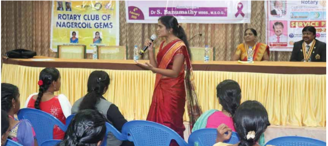
Above: A lecture session on prevention of cervical and breast cancer at the Manonmaniam Sundaranar University. Below: A Narikurava child being administered polio drops to mark World Polio Day.

A series of cancer awareness programmes was conducted by RC Nagercoil Gems, RID 3212, targeting the college girls and rural women who were educated on preventive steps against the disease. As part of this project, the club held an event for prevention of cervix