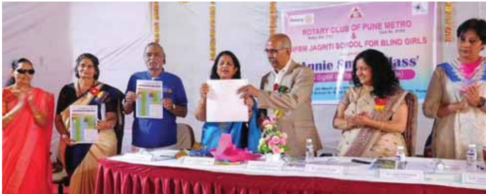
Top: Visually-impaired girls with the Annie device; Above: Club bulletin in print and Braille versions.

The smart class inaugurated in March provided fun-based education for visually-impaired students and to motivate the children, the club brought out its bulletin in a Braille version. ■