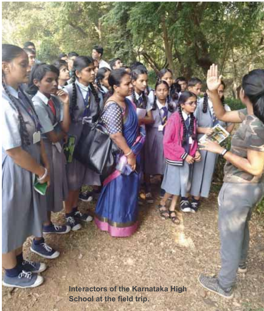
Interactors of the Karnataka High School at the field trip.

R C Bombay Chembur, RID 3142, took the interactors of Karnataka High School, Mumbai, for an educational field trip. The children visited the Maharashtra Nature Park where they got to see biodiverse plants, insects and animal life. Topics ranging from pollinators to birds and dinosaurs were discussed on the trip. The club spent ₹5,000 in arranging this field trip for 40 Interactors. At the end of the trip, they were each given a sapling to plant at their respective homes.