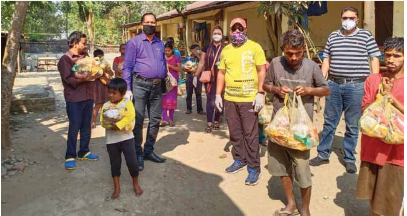
Above: Ration kits and cooked food being given to villagers; Below: Students at a Smart Classroom.

T hirty government higher secondary schools were installed with Smart Classrooms by Rotary Club of Siliguri Midtown, RID 3240, under its project 'eVidya'. The computers are loaded with West Bengal Board syllabus and the systems are equipped with solar power and battery backup.