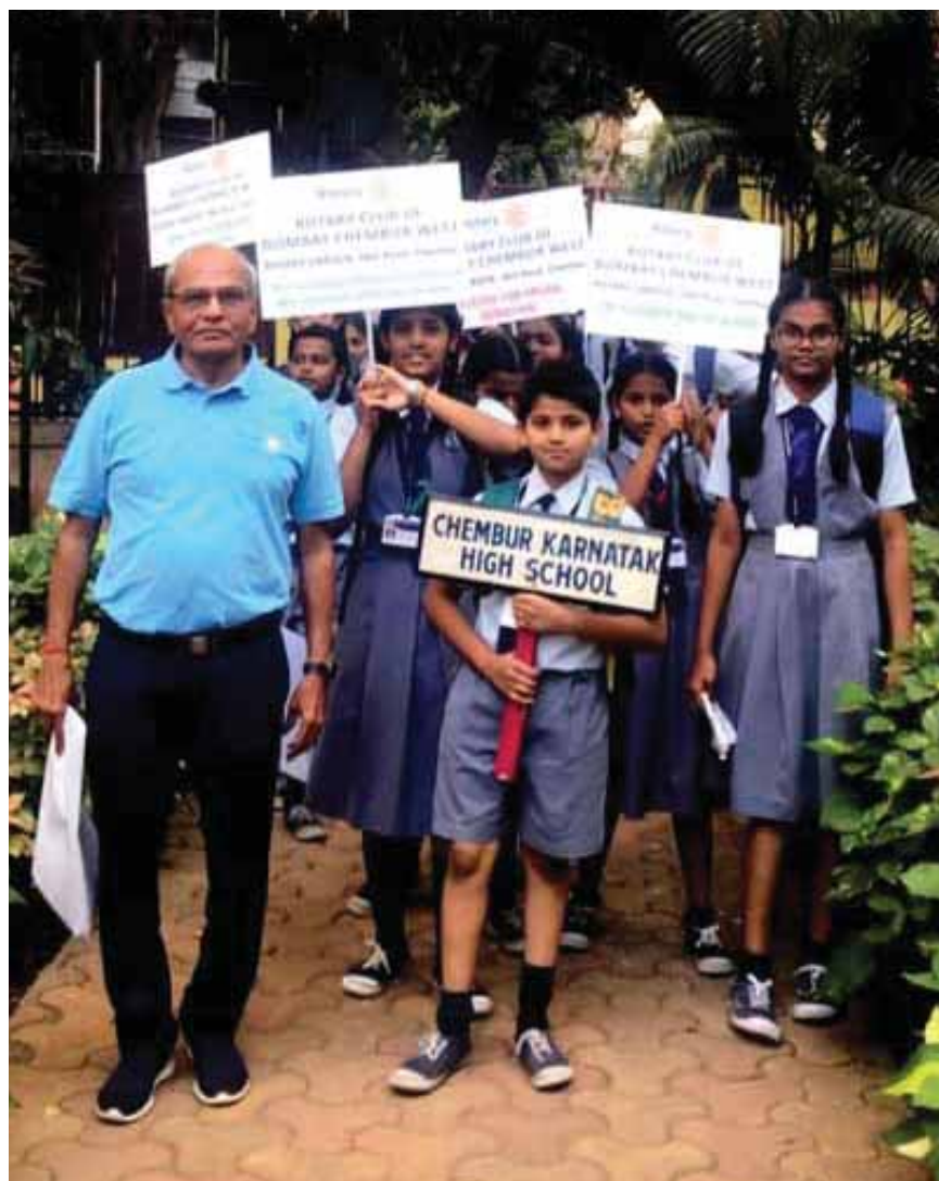
Interactors campaigning for organ donation.