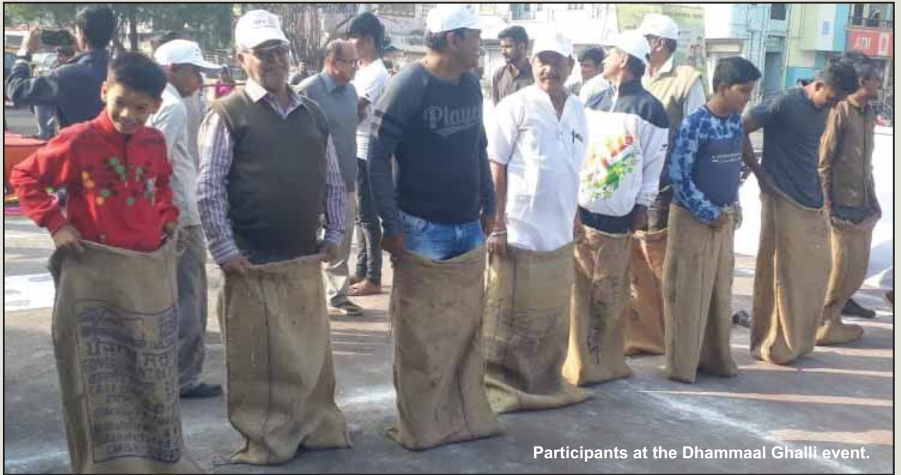
Participants at the Dhammaal Ghalli event.