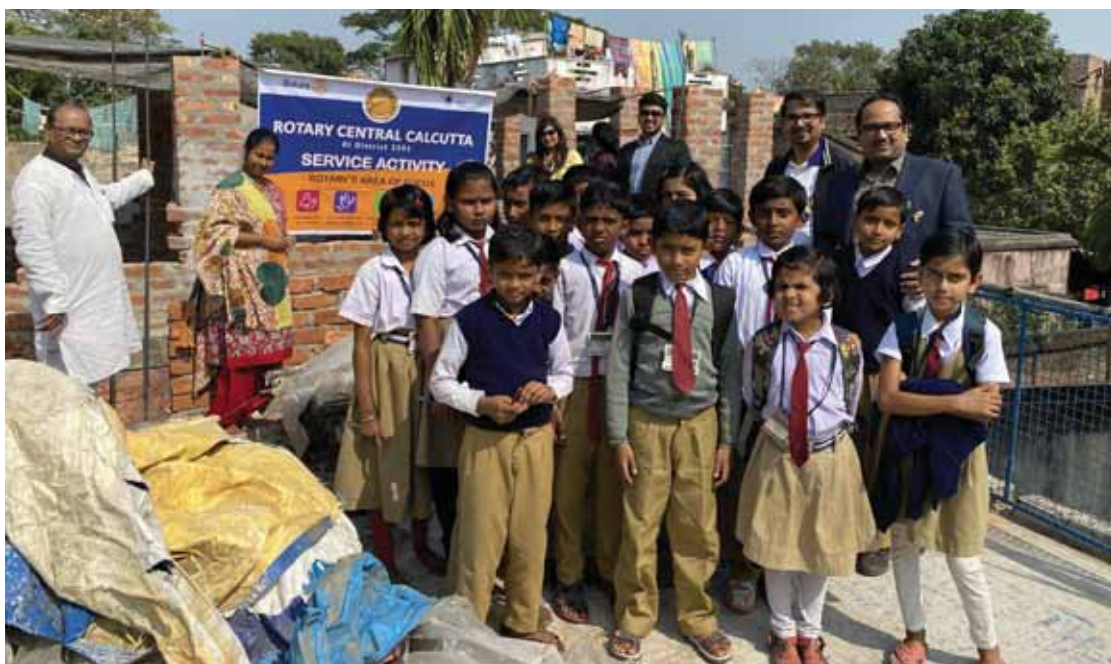
Rotarians with students at the Nibaran High School where an additional classroom was built.

T wenty sets of chairs and tables were donated to a government primary school in Tarkeshwar by RC Central Calcutta, RID 3291, to enhance the classroom experience for the students.