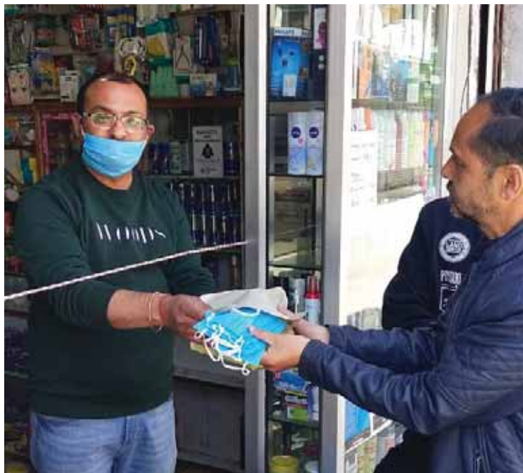
Masks being donated to corona warriors in Mussoorie.